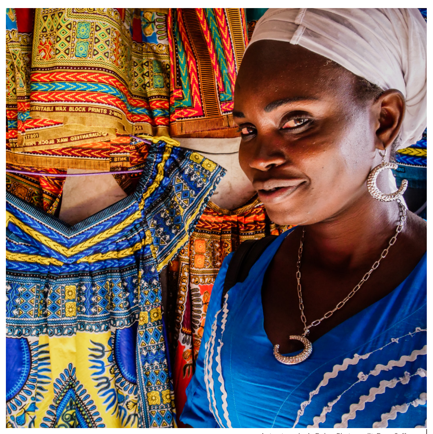
A street vendor in Dakar.

Women market traders in all three geographic regions have the highest per cent of secondary school attendance — 27 per cent in Dakar, 21 per cent in urban Senegal, and 17 per cent nationally. For all other groups, less than 15 per cent of women have attended secondary school at the national level, the per cent of women (as well as men) with no education increase, but substantial gender disparities persist. Among men, about a third of domestic and home-based workers in Dakar, and about 20 per cent nationally, have completed secondary schooling. Across all groups, the shares of women and men with completion of tertiary schooling is generally less than 5 per cent.