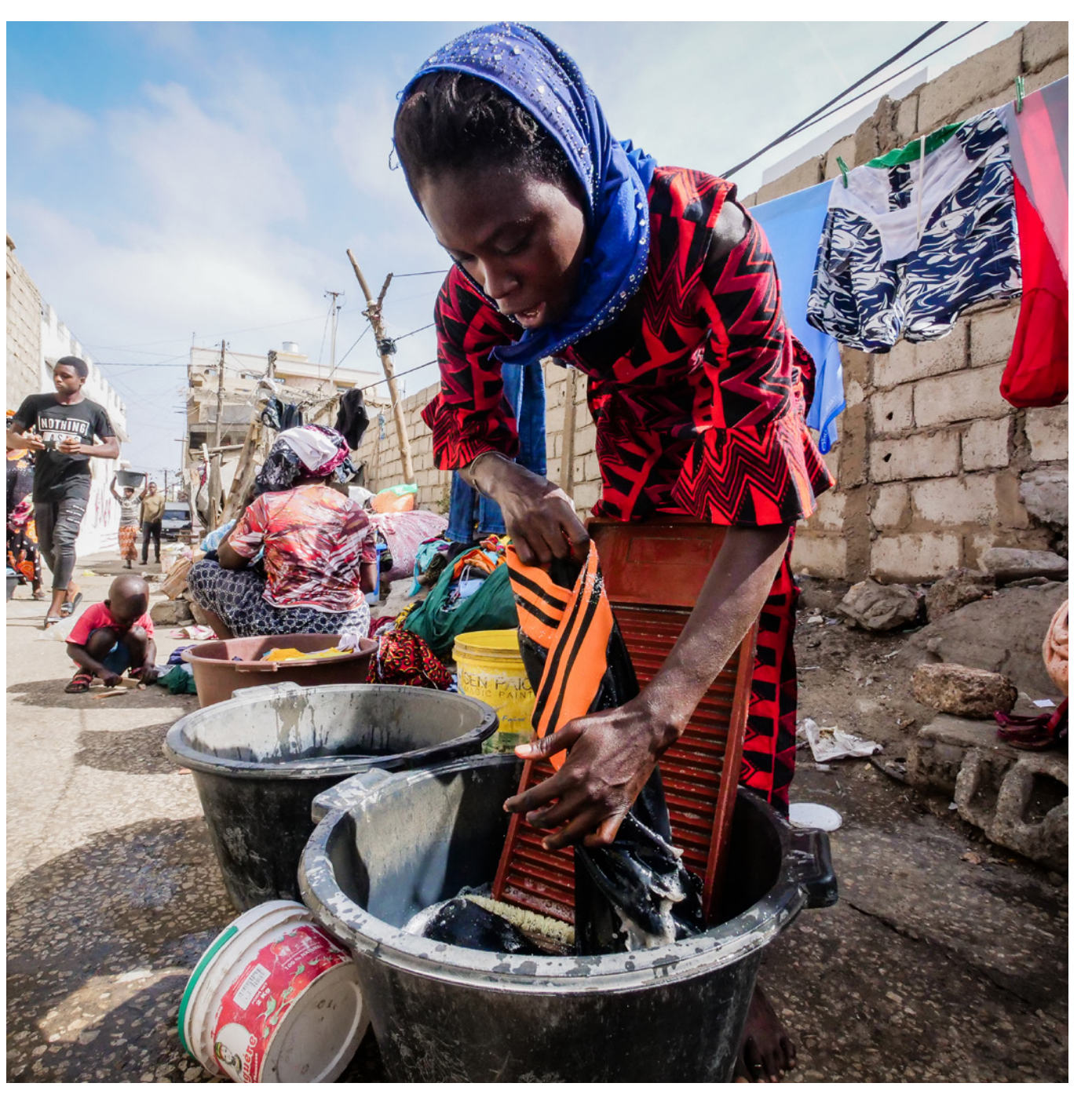
A laundress in Dakar.