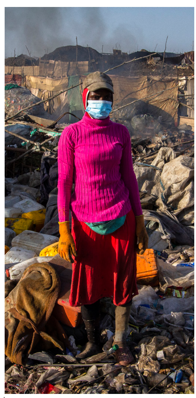
A waste picker working at the Mbeubeuss dumpsite.