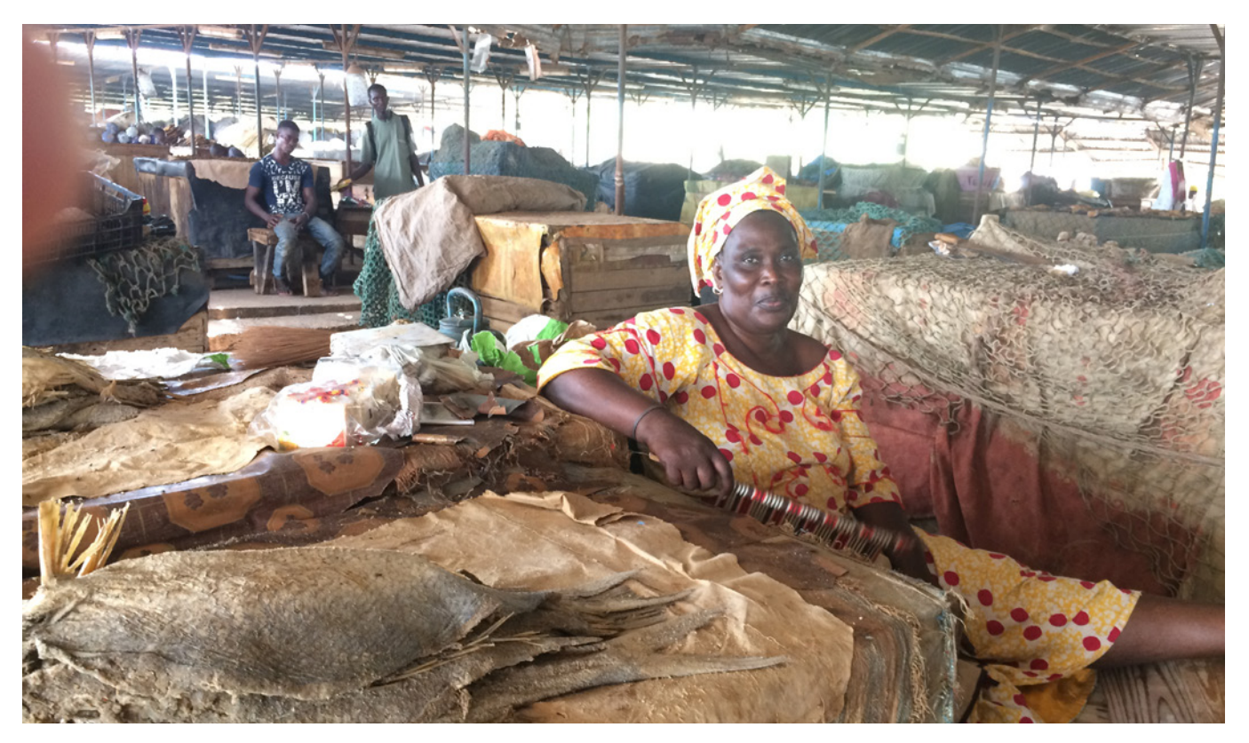
A market trader at the Marche de Diola Dakar.

Among women street vendors in all geographic areas, around 90 per cent are own-account