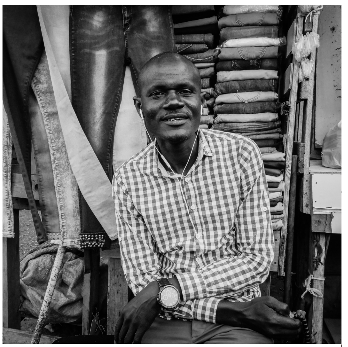
A street vendor in Dakar.

The results underscore the vulnerabilities faced by the majority of workers across these different groups of workers, which are related to the informality of their work.