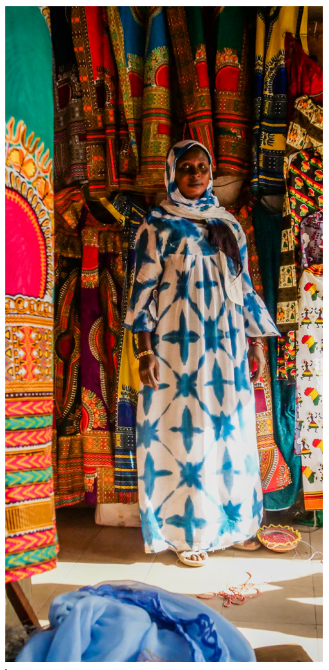
A street vendor in Dakar, Senegal.

Informal employment refers to economic activities that are not covered or insufficiently covered in law or in practice by formal arrangements through work — including, for