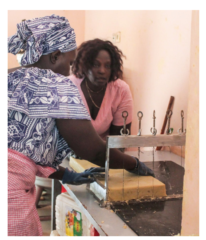
Home-based workers in Dakar

(45 per cent of men, compared to 27 per cent of women). In Dakar, the next largest group is street vendors, where women are more heavily concentrated (about 21 per cent of employed women, compared to 9 per cent of employed men). Women are also more likely to be in home-based work (19 per cent of women compared to 5 per cent of men) and in domestic work (19 per cent for women and 3 per cent for men). In the other two geographic areas, market trade is also the predominant group for both women and men, with higher percentages for men than for women. In urban Senegal, 37 per cent of men's employment is in market trade compared to 26