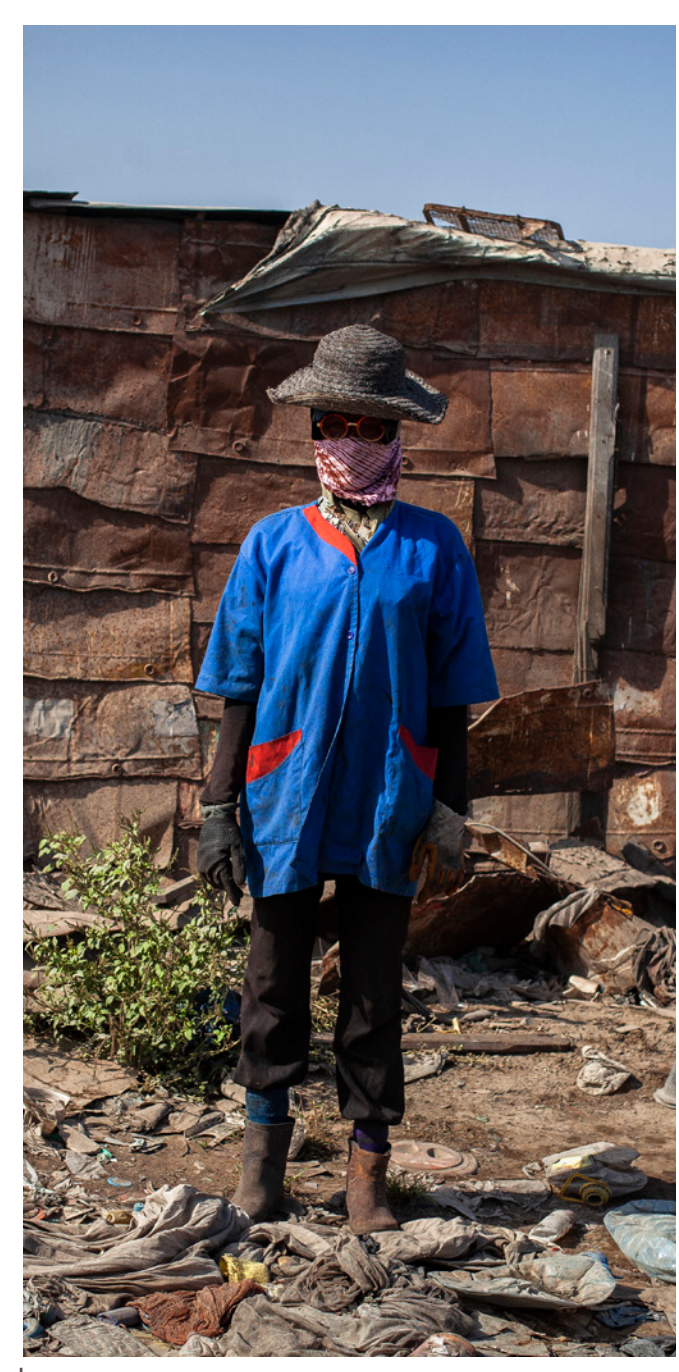
A waste picker working at the Mbeubeuss dumpsite.