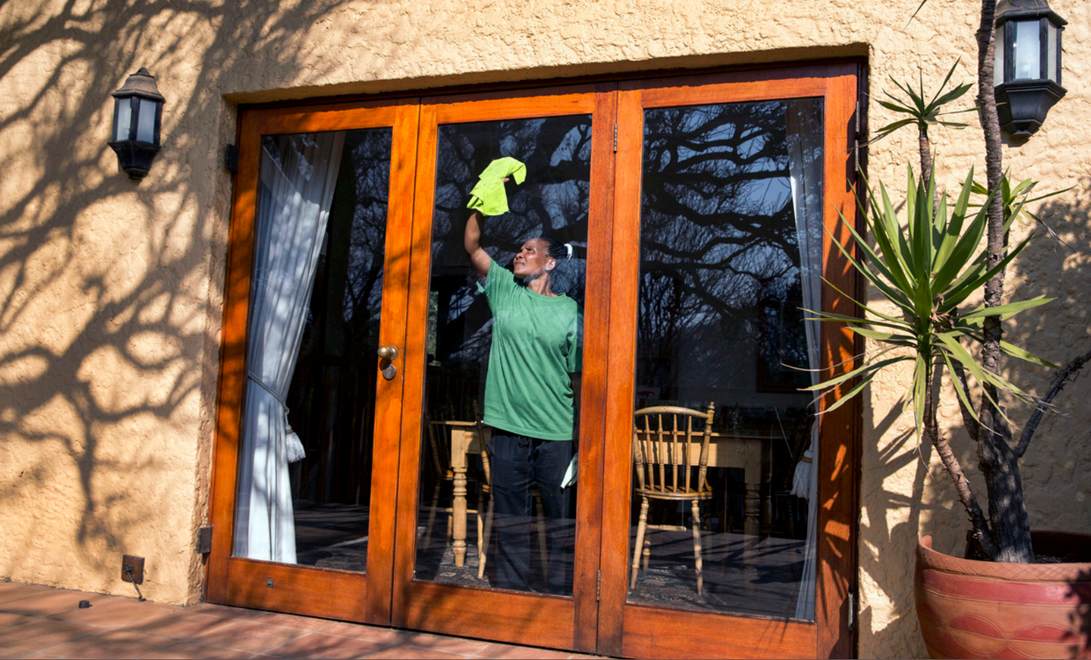
This is a posed photograph of a domestic worker in a private home in Johannesburg, South Africa.