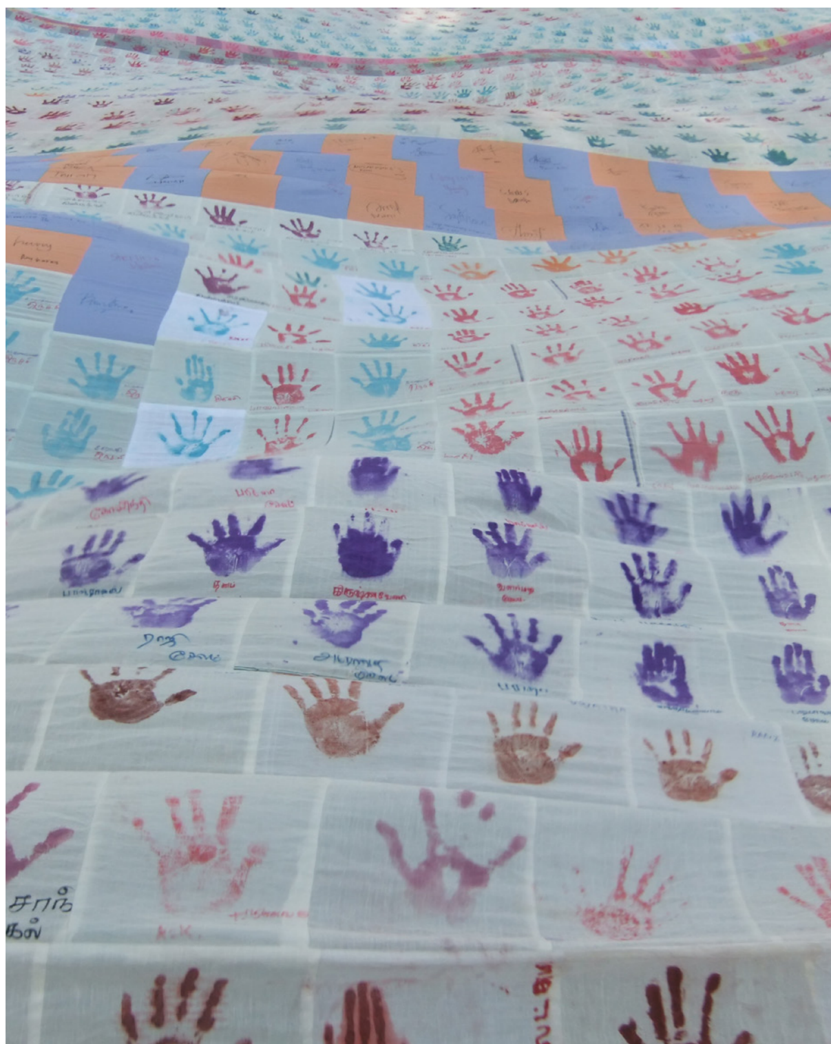
Domestic workers from around the world put their handprints on this fabric at an ILO meeting in Geneva, Switzerland, in 2011. Women joining hands in solidarity and celebration (opposite) at the launch of the African Domestic Workers Network in Cape Town, South Africa, in 2013.

Cover: Domestic workers play an essential economic role by providing necessary labour so others are free to work outside the home.