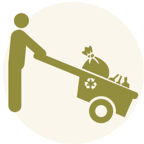
inefficient work routines