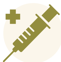
Non-communicable diseases such as diabetes and hypertension