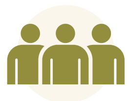
Community-based violence and socio-economic vulnerabilities