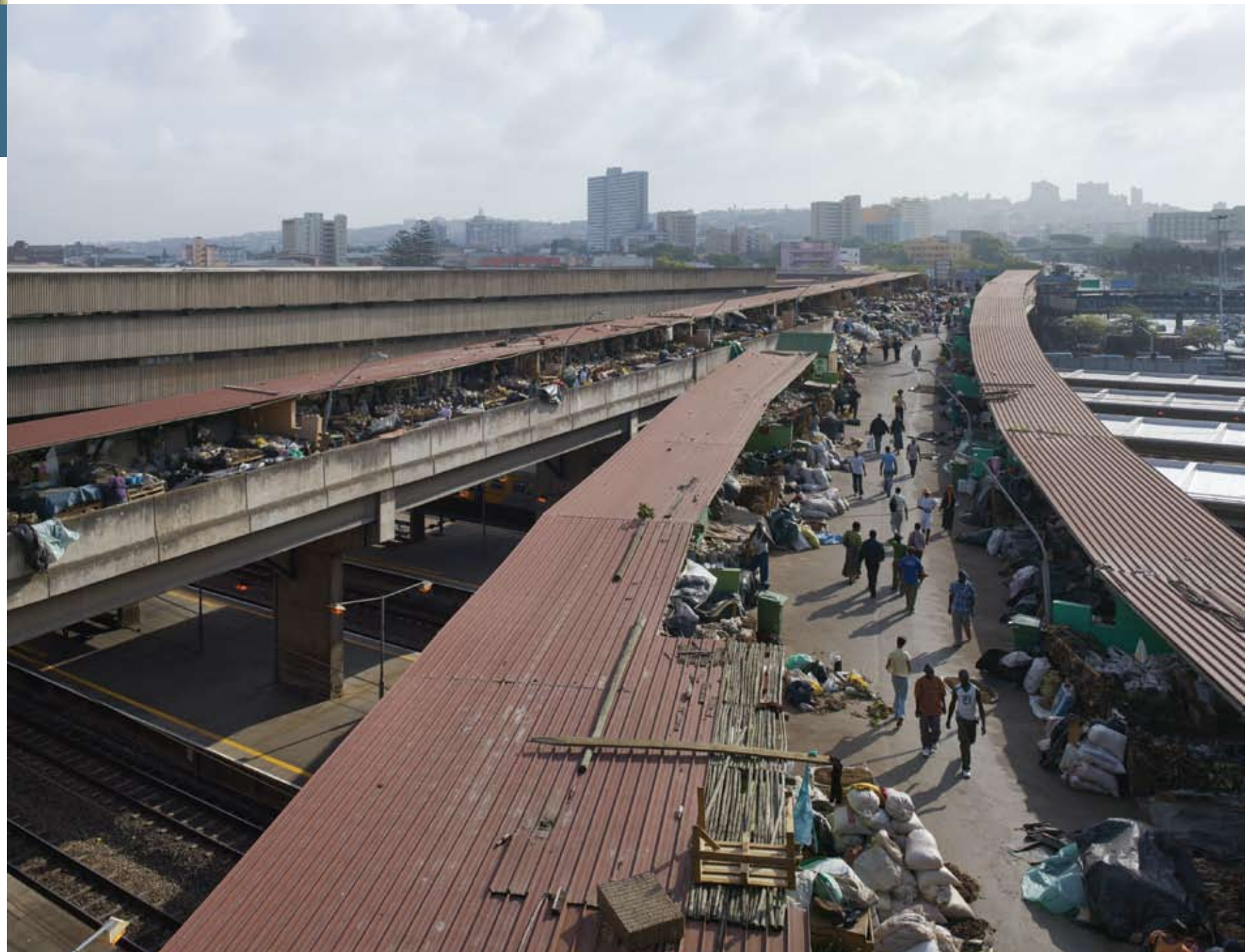
An aerial view of the Traditional Medicine Market