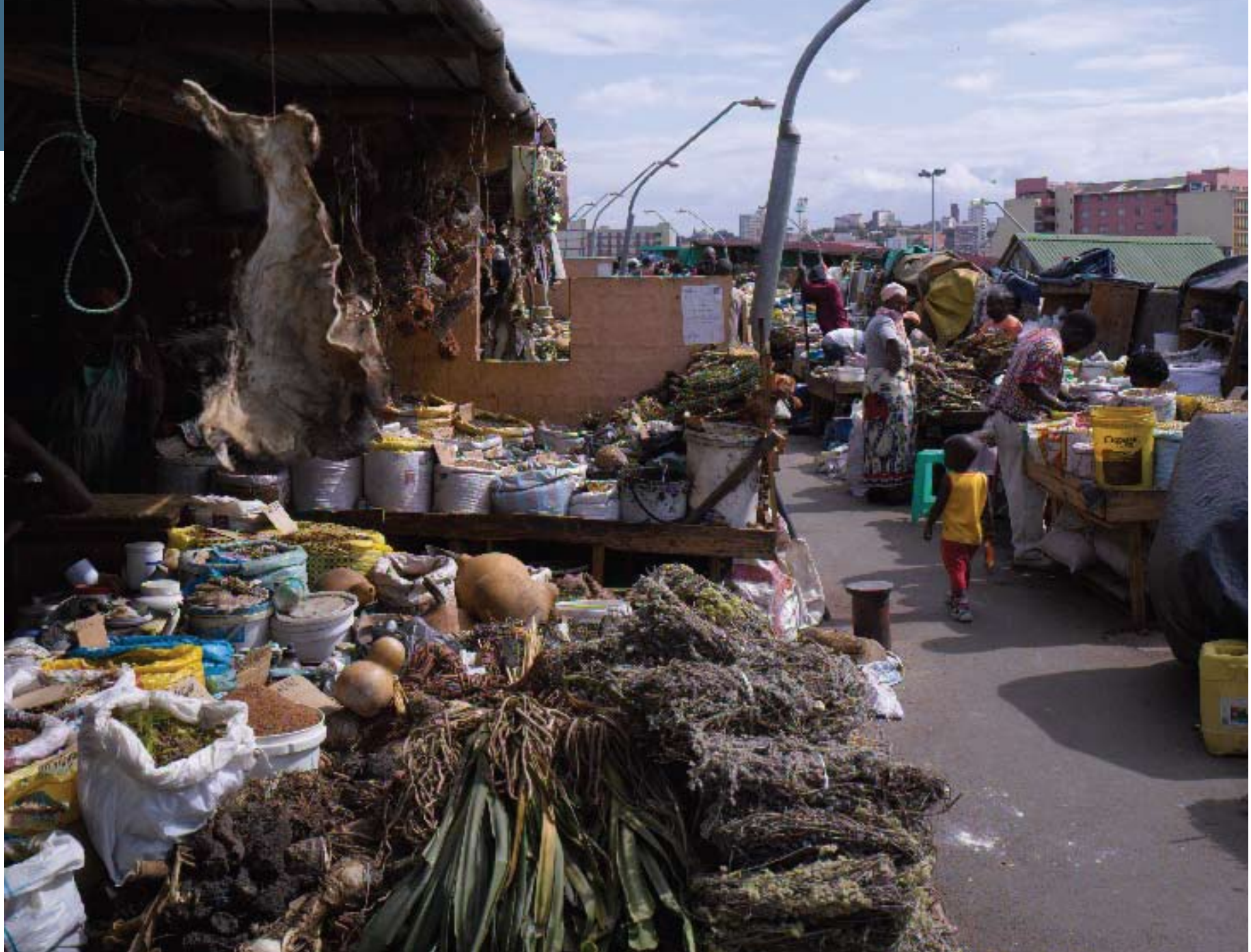
The Traditional Medicine Market