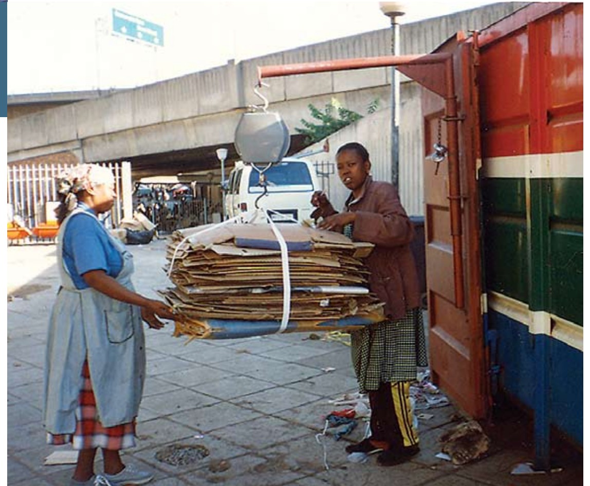
The cardboard buy-back centre in action