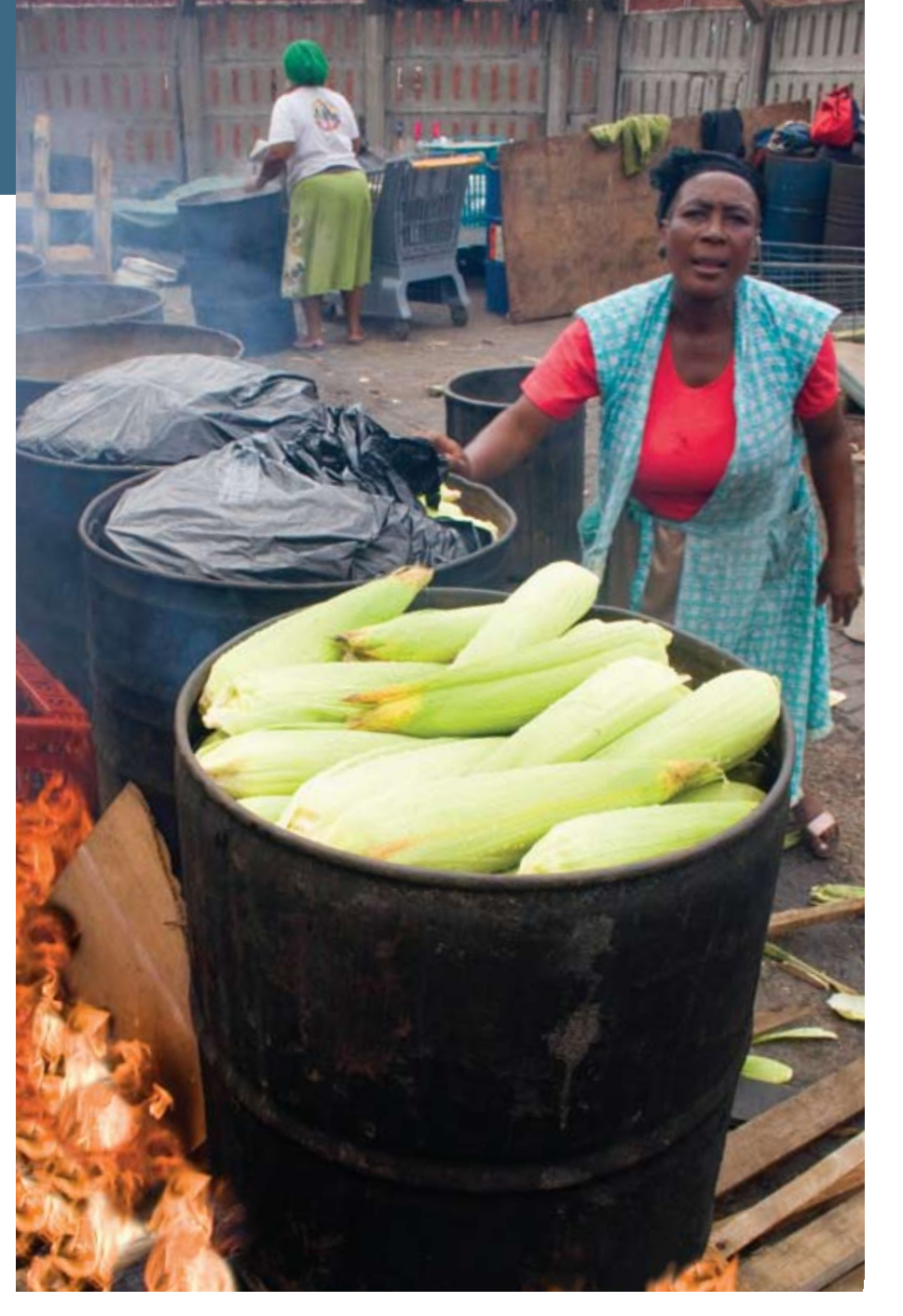
Mealie cooking at the new site

The 'cook-off' took place on the vacant site with a group of cooks, the Project leader and some officials from the task team. The women had agreed to provide all the necessaries for the experiment, with the exception of the gas. They paid someone to deliver the two 200 litre drums to the site, both filled with 50 litres of water. A second operator delivered firewood and kindling. Barrow operators brought the fresh mealies. Finally the mealie cook arrived with her supermarket trolley and polythene bags, two of which were used to cover the tops of the drums.