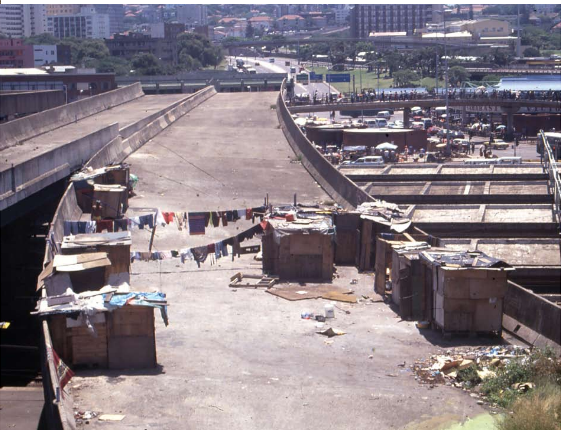
The disused freeway off-ramps that became the Traditional Medicine Market