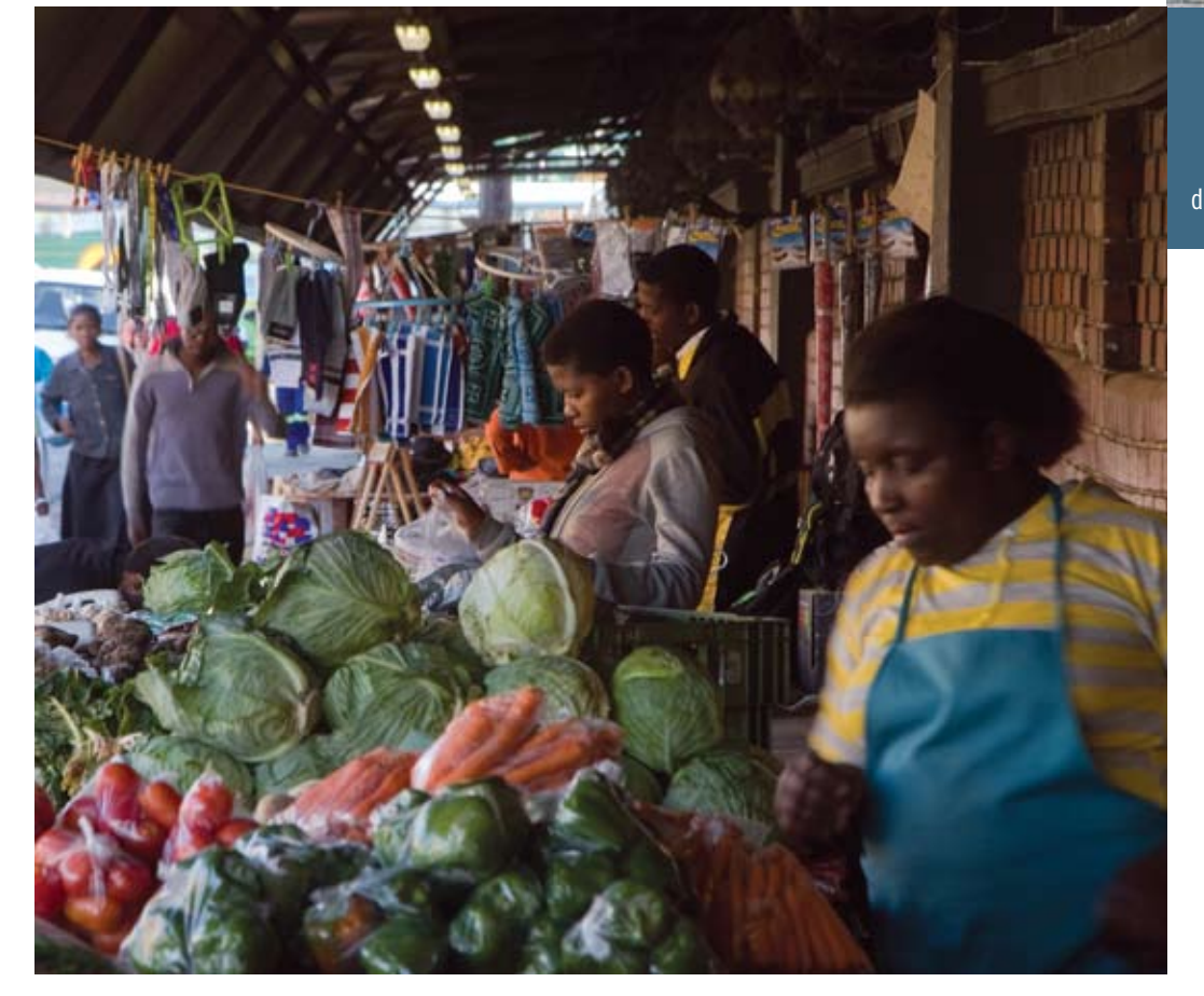
Trading outside the Early Morning Market

Any attempts to make trading more economically viable must take these diversities into account. This is a challenging process: it requires a clear and detailed understanding of each trade which in turn requires patience, a willingness to respect the knowledge and experience of traders, and mutual trust. This economic understanding needs to be supplemented with an understanding of the role of infrastructure and other services in the pursuit of the right to work.