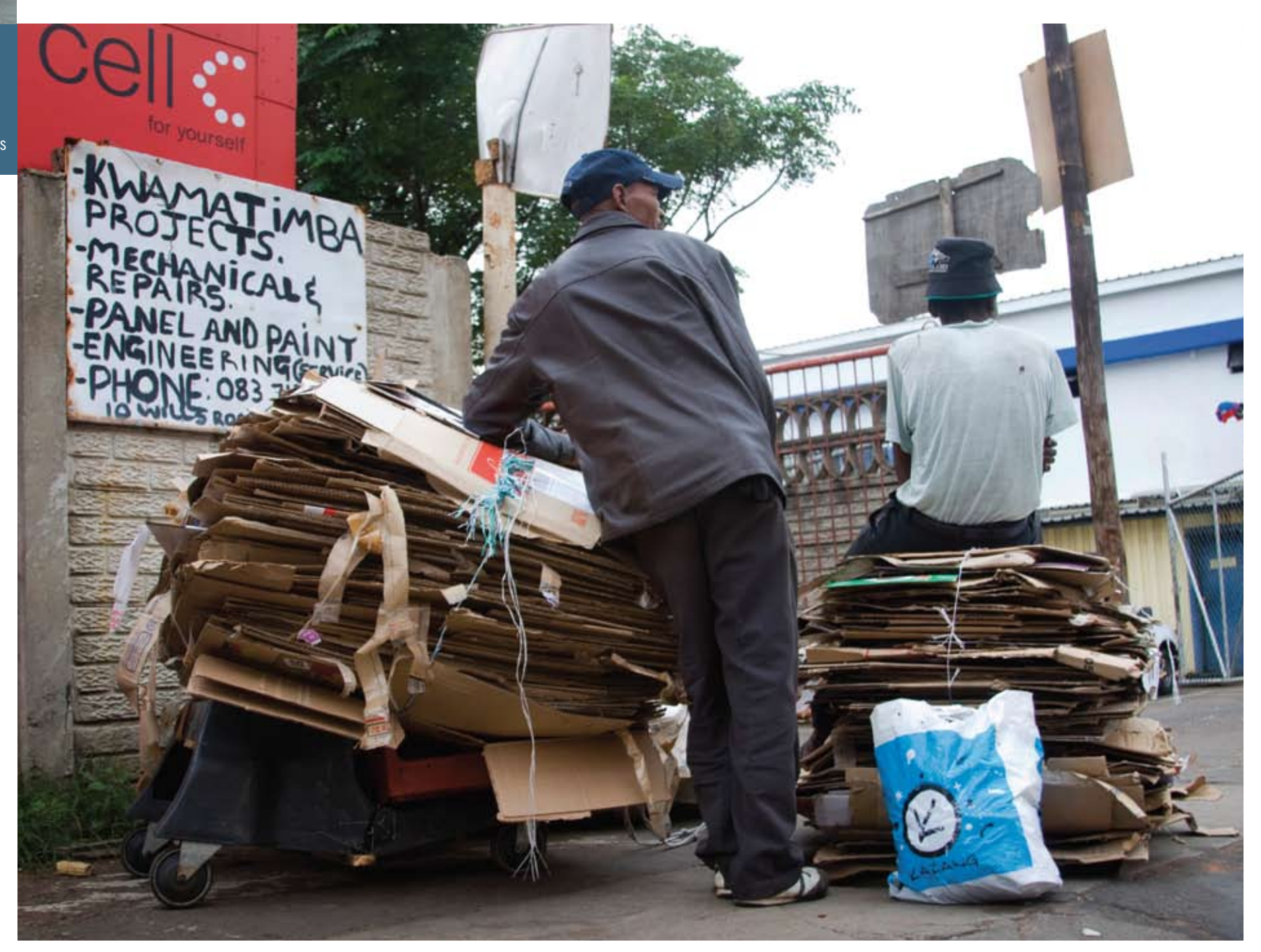
Cardboard collectors waiting to sell materials salvaged from the neighbourhood