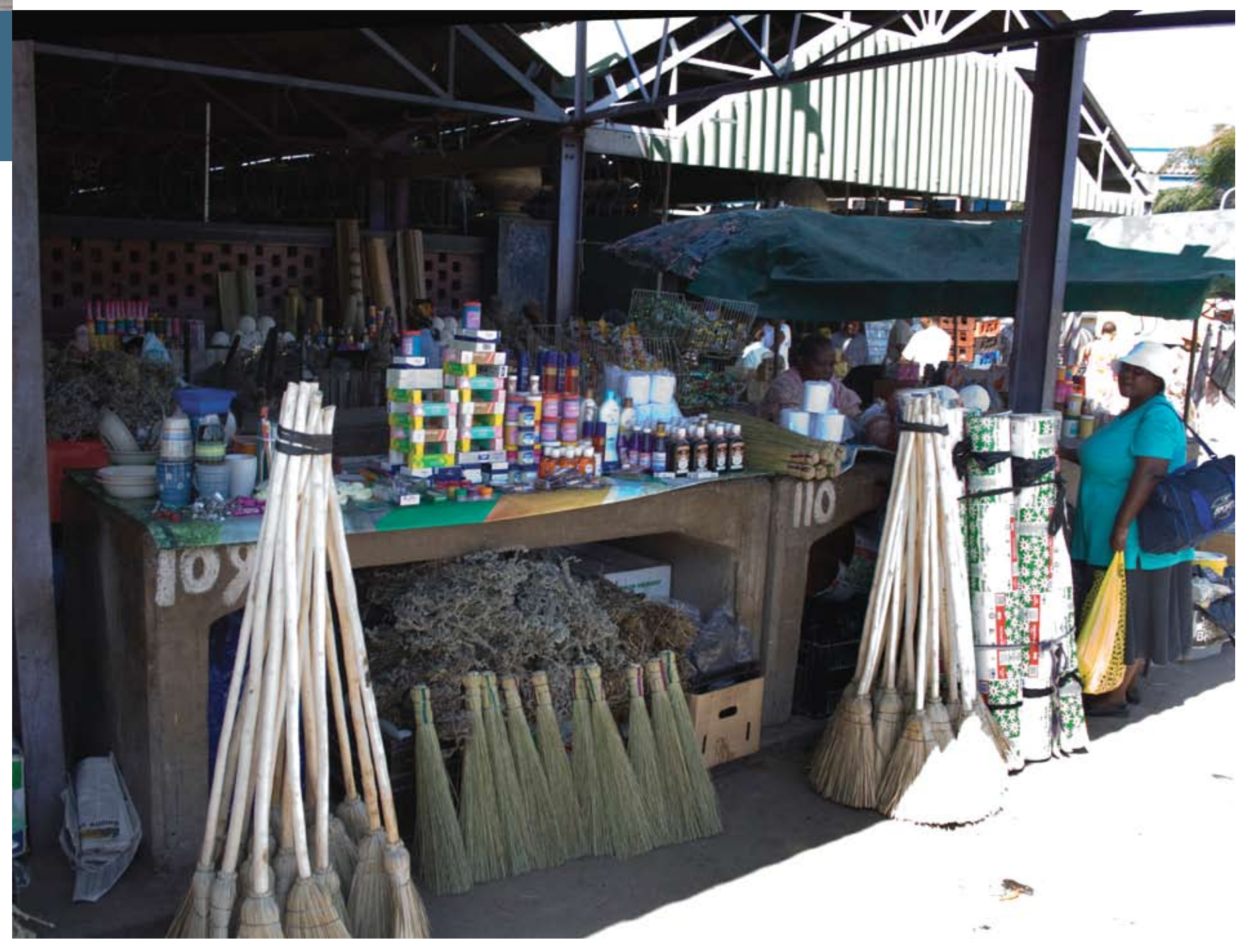
Household goods trading outside the Early Morning Market