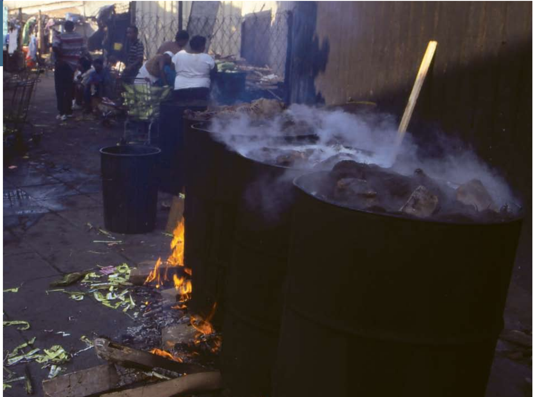
Mealie cooking conditions prior to project interventions