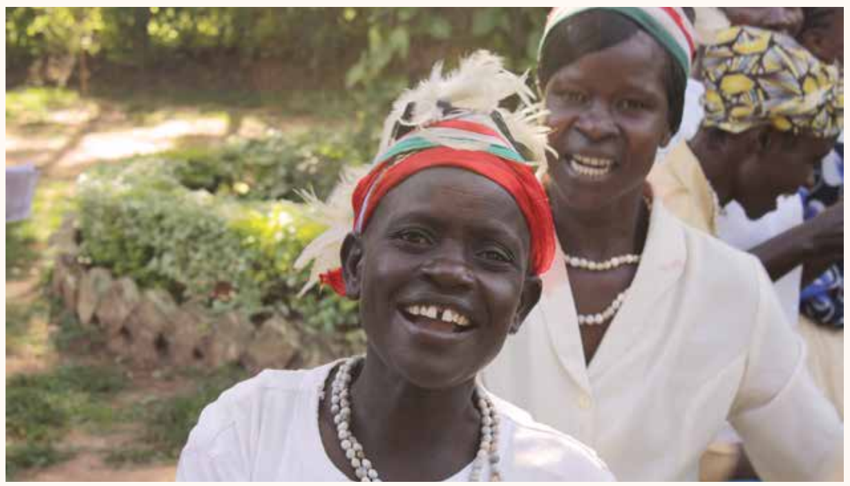
Home-based workers from the OYES Cluster in Kenya, 2015

Developing Leadership & Business Skills for Informal Women Workers in Fair Trade, one element of a multipronged project (sidebar) targeted poor workers in Africa—specifically in Ghana (cocoa farmers), Kenya (handicraft producers) and Uganda (coffee farmers and handicraft producers) and offered training to help them improve and diversify their livelihoods.