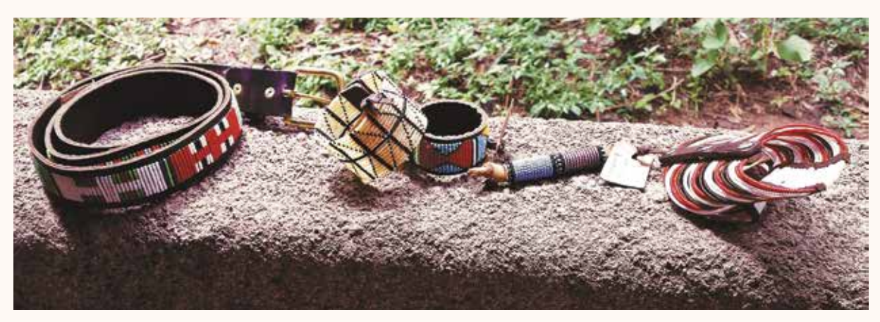
A range of Basecamp Maasai Brand products.