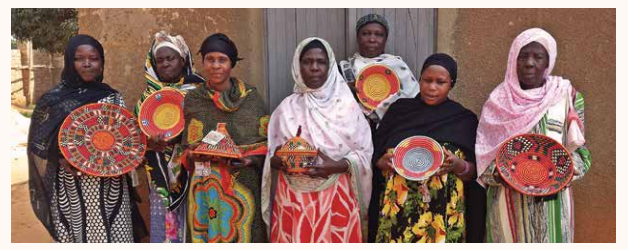
Nubian Crafts group members show off some of their intricately-woven products.

The group does plan to register in the future, when funding allows, and is slowly trying to recruit new members. New members pay a one-time fee of 10,000 Ugandan shillings to join.