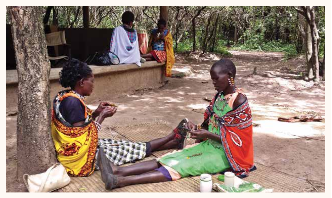
The women who produce for Basecamp Maasai. Brand say learning to do things better has improved their lives. They too have spent their increased earnings on livestock, on more functional homes, and most especially on education for their children.