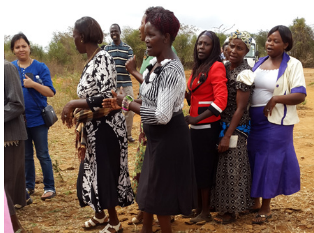
Visit to the Malembwa Women's Group in Kenya, 2014.

During the regional workshop in Nairobi (2014) the South African Self-Employed Women's Association (SASEWA) was identified as the focal organization in South Africa to lead the organizing and networking process amongst home-based workers. WIEGO facilitated a series of capacity-building workshops for leaders, as well as existing and newly-recruited members of SASEWA.