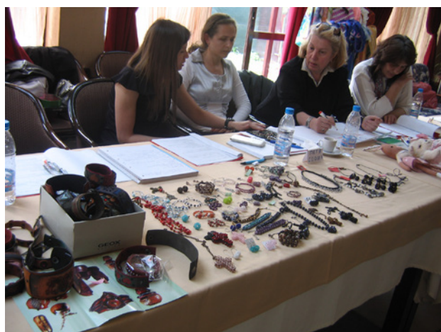
Innovative Workshop in Sofia, Bulgaria.

In 2015, WIEGO and HNEE jointly organized a training workshop in Sofia, Bulgaria. The focus was on strategic planning for the organization as well as market and product innovation for the separate country networks of Albania, Bulgaria, Georgia, and Kyrgyzstan. By the end of the five-day workshop, the hope was that members had an increased understanding of marketing methods and available markets—critically important for own-account home-based workers. This workshop was also central for developing