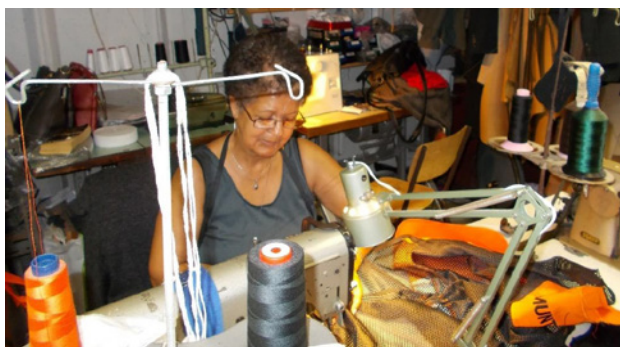
Machinist working out of a garage, Athlone Cape Town.

Home-based workers' organizations in South Africa tend to be fragile where they exist. Trade unions have not been successful in organizing their ex-members and many groups are supported by NGOs. The type of support differs for craft workers and garment workers. For the former, NGO support tends to be for social groups whose main existence may not be economic, but instead organize