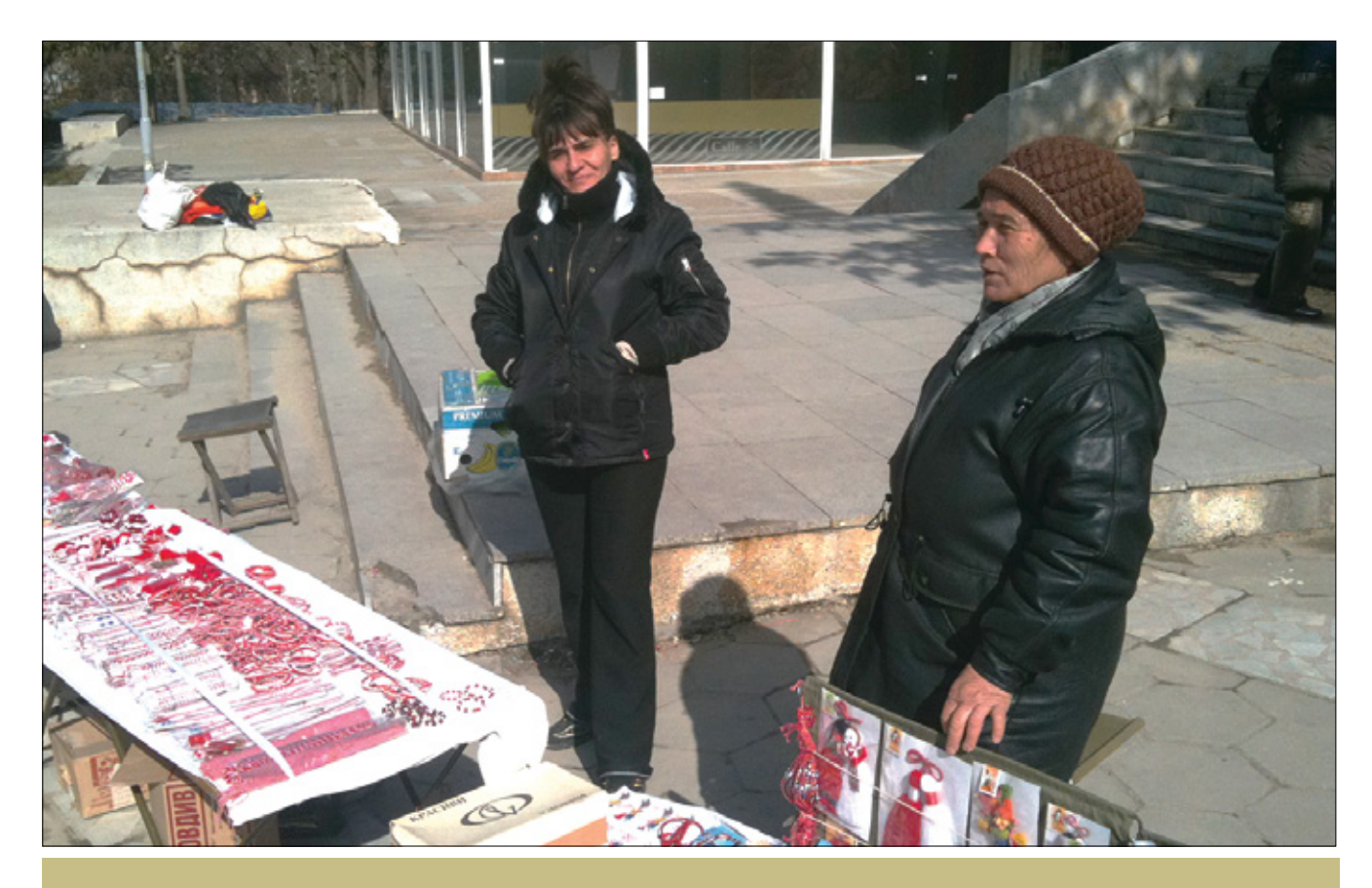
Some Association members sell their products directly on the street.

The Pleven Association, for example, endeavours to maintain cultural traditions by demonstrating and teaching craft skills such as weaving and garment-making to young children. The program is currently trying to raise money for a professional standard weaving loom. The Association also works closely with the cultural centres in the 120 villages in the province, demonstrating crafts (breadmaking etc) at local fairs, festivals and public celebrations. These centres are remnants of the former regime large meeting halls, social clubs, and offices built in each village during the 1960s and 70s, now very neglected, but still playing an important function in village communities. The Association has representatives in every village, thus forming a province-wide network. There is a revival of folklore groups, traditional choirs, dancing, and rural folk festivals, which match the Association's craft products very well and provide a good market for sales. The resurgence of interest in dancing and the fashion for traditional dress at weddings fuel demand for traditional costumes made by Association members.