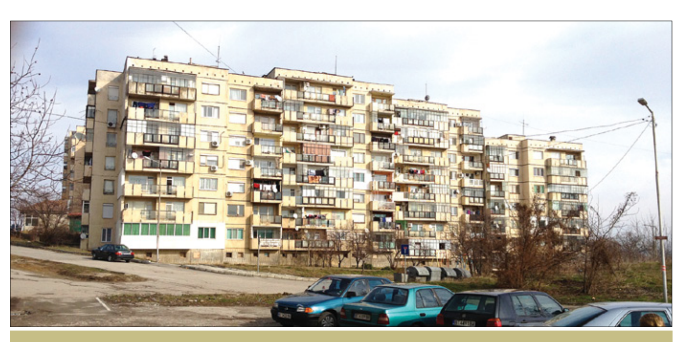
Typical housing for many home-based workers in Veliko Tarnovo