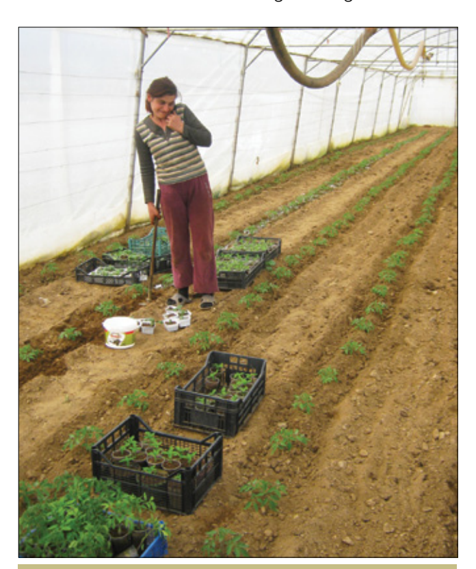
Outworkers in winter will often become own-account workers in the summer, for example in small-scale market gardening.

Many home-based workers do both own-account and out-sourced work, often on a seasonal basis. Out-sourced workers in winter are often own-account workers in the summer, particularly as agricultural smallholders or in small-scale market gardening.