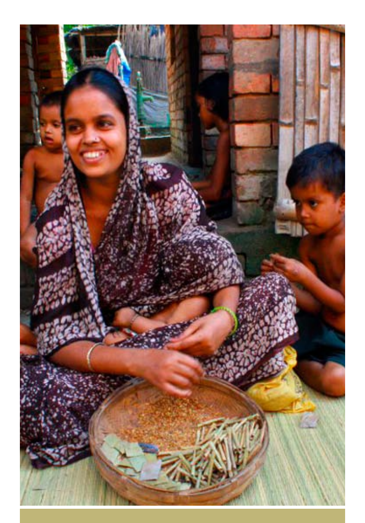
Social security is a crucial need for all home-based workers; health care, maternal benefits and childcare are of particular importance.

Gujarat State Women's SEWA Cooperative Federation brings together a great many poor women's cooperatives. The Federation believes women workers can take a firm hold in the marketplace – thus securing their livelihoods and increasing income – by building their own collective businesses. In order to make its members competitive and compatible with market demands, the Federation provides need-based training, guidance, marketing and design services. It also promotes SEWA Kalakruti, a retail marketing outlet for the products generated by women artisans organized under cooperatives. Kalakruti is a concept of collective marketing to mainstream the products of these cooperatives, directing linking customers to the artisans' products and eliminating the middlemen. The Federation also has an export license, which