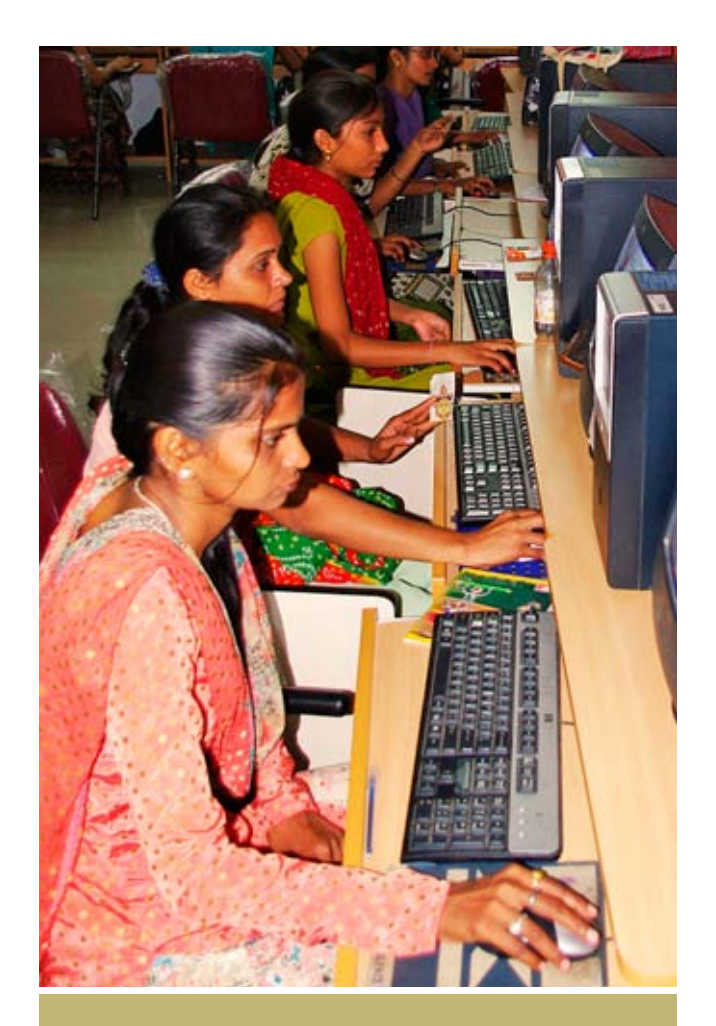
SEWA has been running classes to help its members gain new production, marketing and business skills.

Compounding the very low average wages of the homebased workers is the fact that homeworkers have to pay for many of the non-wage costs of production: notably, the overhead costs of some, or all, of the raw material. The ready-made garment workers in Ahmedabad get raw material from the employer/contract, but have to purchase thread from the open market with their own money. During the festival season, when the workers get more work, the thread shop owners also increase their price, thus eating into the income of the worker.