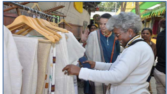
Ethiopian Ambassador to India checking the products in the stall

The reception at Dastkar was encouraging not only for Ethiopian products but also for SEWA Bharat promoted stall Loom Mool. It was not just a good platform for display of products for work of grassroots Ethiopian and Indian artisans but also a unique place for artisans to interact and build market linkages. The exposure was valuable for the artisans and the festival visit followed by interaction and visit for SEWA Bharat's producer company Ruaab and an opportunity for Ethiopian