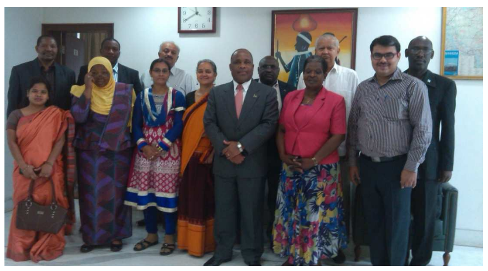
SEWA team with Tanzanian delegation in New Delhi

During our Tanzania visit in last November, the Tanzanian Social Security Association (TSSA) proposed a study tour of their officials to know in detail about the Social Security in India and experience of SEWA. In this regard, a high level ministerial delegation was on a 2 days tour of India. They visited Employee Provident Fund Organisation and interacted with Labour Department officials in New Delhi. The team was supposed to visit Ahmedabad on 24<sup>th</sup> February but due to paucity of time it was cancelled and they invited us to meet in New Delhi.