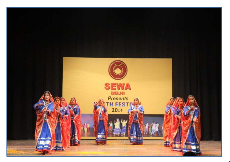
SEWA Delhi Polytechnic Students performing folk dance

Like every year, SEWA Bharat concluded the 2014's successful run up of activities by celebrating ShramikMahotsav (Labour Festival) and Youth Festival in Delhi. The festival is celebrated to honour the lives and achievements of the remarkable women and girls of SEWA who have faced and overcome tremendous barriers in their everyday life. The celebrations this year were held on the 23<sup>rd</sup> of December, Thursday at the well-known Shah Auditorium in New Delhi.