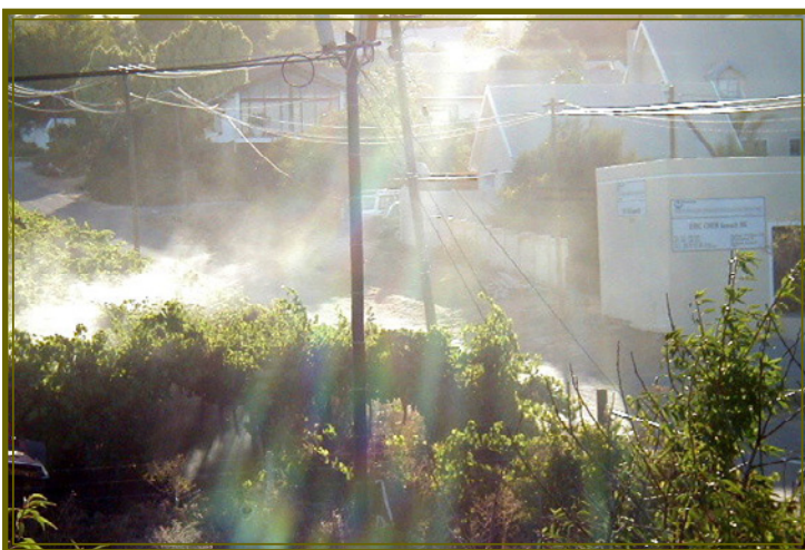
Poisonous pesticides floating into a residential area nearby a farm in the Western Cape, South Africa. Photograph: Leslie London.

Within the discipline of Occupational Health and Safety, the major concern with pesticides has usually been their use in agriculture, where they are used to protect crops from those pests that can cause crops damage. The chemicals do not only have a harmful effect on the insects. They can also be very dangerous to the health of the agricultural workers who apply them.