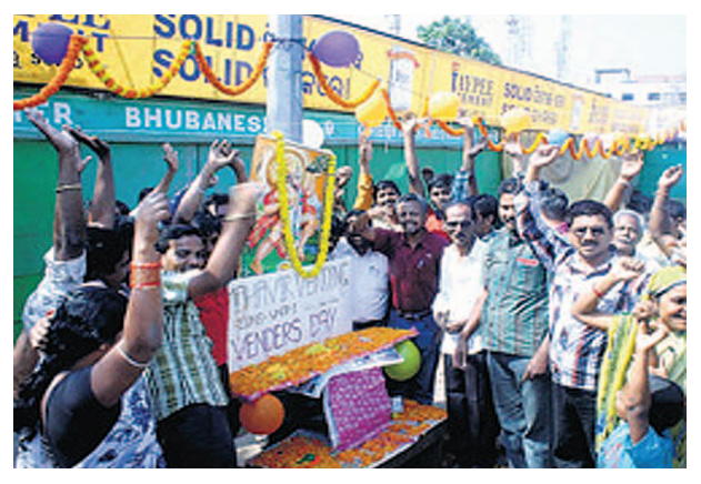
Traders celebrate vendors' day in Bhubaneswar

Bhubaneswar, which consists of 60 wards, is currently having 56 vending zones where 2,600 street vendors