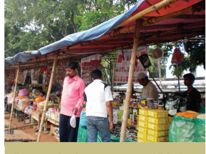
Temporary bamboo structures established over the probation period.

Representatives from all the stakeholders together constituted a body called the City Management Group (CMG). Several rounds of meetings were organized in which the models proposed were debated and improved upon. During the meetings, the stakeholders also came up with a mutually agreed-upon action plan detailing how to proceed with the creation and dedication of vending zones. The members of CMG who missed the scheduled meetings were later apprised about the proceedings and the consensus built during the discussions. This was of particular significance as it avoided last minute objections, which could potentially have cropped up during implementation.