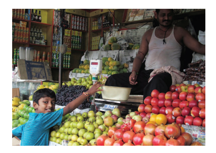
the Bhubaneshwar model and work towards regularizing the street vendors in Delhi. 10

However, the formulation of coherent informal sector policy needs to be context specific. It also must be predicated on an informed understanding of the economic contribution of the sector. Furthermore, it needs to be participatory and inclusive in nature, which requires involving the organizations representing the informal sector, authorities and other appropriate social actors who must work collaboratively towards negotiated solutions (Chen 2004). The vending zone model of Bhubaneshwar is a good case that brings together all the above-mentioned characteristics.