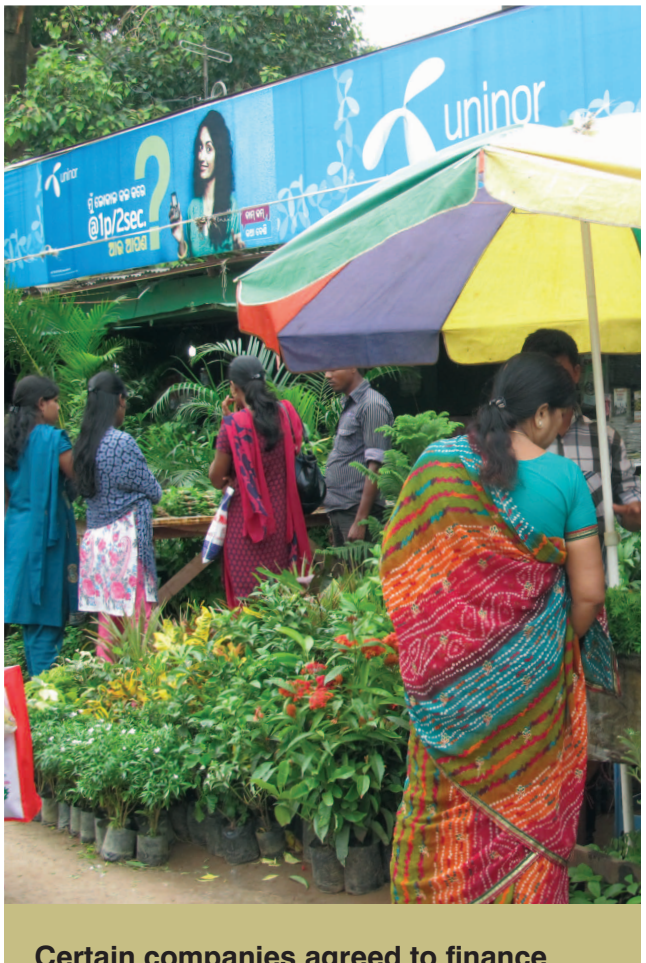
Certain companies agreed to finance trader infrastructure in exchange for advertising rights.

In the second phase, the list of proposed vending zone sites was sent to the GA department for approval. However, gaining approval was a daunting task and once again vendors had to struggle. The usual process was to send a letter to GA authorities who, after a long period, would send back a regret letter arbitrarily stating the non-availability of the proposed piece of land. In some cases when the land was allotted, the possession was not formally given. The situation was further aggravated due to opposition from some of the municipal councillors and almost all the proposed pieces of land met with some objections or roadblocks. It was only after persistent communication and continuous pressure applied by