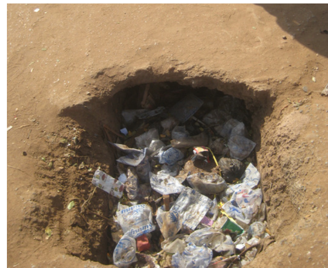
The lack of proper waste management in the markets has led to the creation of makeshift garbage disposal areas such as the one pictured here.

The problems that confront the market traders and street vendors of Accra are many. The focus of this case study is