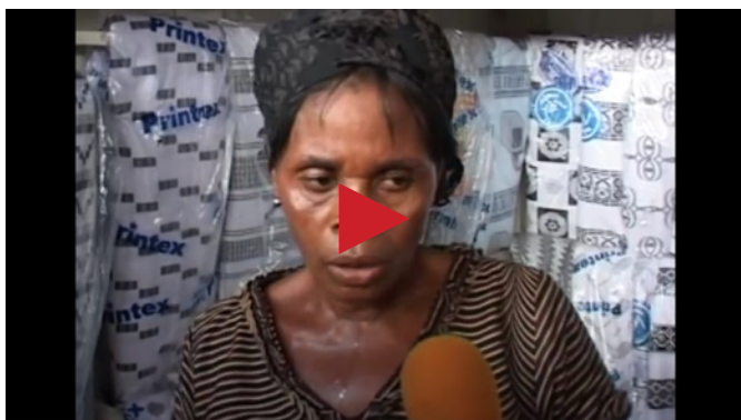
Makola Market Vendors on the Challenge of Fires.