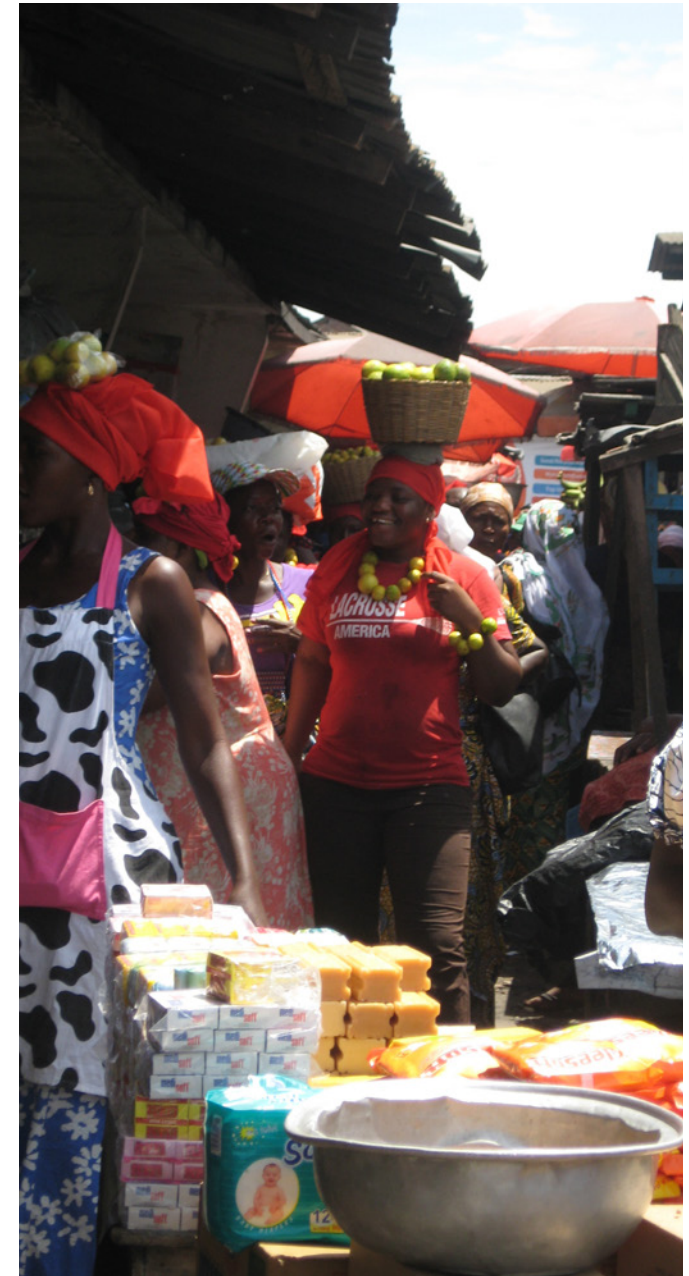
Working as a Kayayei is a difficult job in Accra. The hours are long, the loads heavy, and the pay meagre.