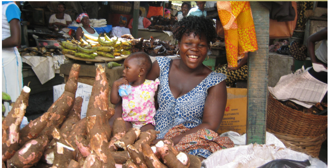
A street vendor sells her wares while caring for her child in the markets of Accra.

The local government law already states citizens have the right participate in governance and in the planning and execution of projects. It is up to the traders to push for and insist on this, especially when it comes to the maintenance, design, and construction of markets and other facilities like toilets, so that they meet the occupational health and safety standards traders need.