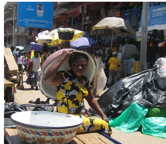
A kayayei (head porter) sheltering from the sun.

Through the workshops, the traders have also come to the realization that they need to be represented directly within the local government structures if their voices are to be heard and their issues addressed. For this reason, in the 2010 Local Government Elections, one executive member of the Ga East Traders Union stood to be elected as an assembly member of the Ga East Municipal Assembly. Though she lost the elections, the union lobbied for her to be one of the 30 per cent of assembly members that the government appoints. Now she is a member of the Gender and Children Sub-committee of the Assembly. Another member was elected as a member of the Unit Committee (community level structure of the local government system). As a result, he is representing his community on the Area Council and is secretary to the development sub-committee. Through these two executive members, the traders unions' interests and issues are brought to the fore at the municipal assembly and area levels, which partly accounts for the successes they have won so far.