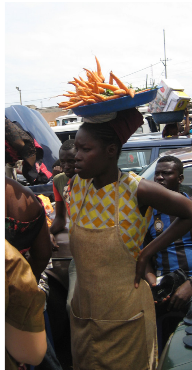
A woman working as a Kayayei, a head porter, in the Accra market.

In addition to the workshops, WIEGO and ILGS organized dialogue sessions between the traders and vendors on one hand and service providers and local government authorities on the other hand. To start with, as part of these workshops,