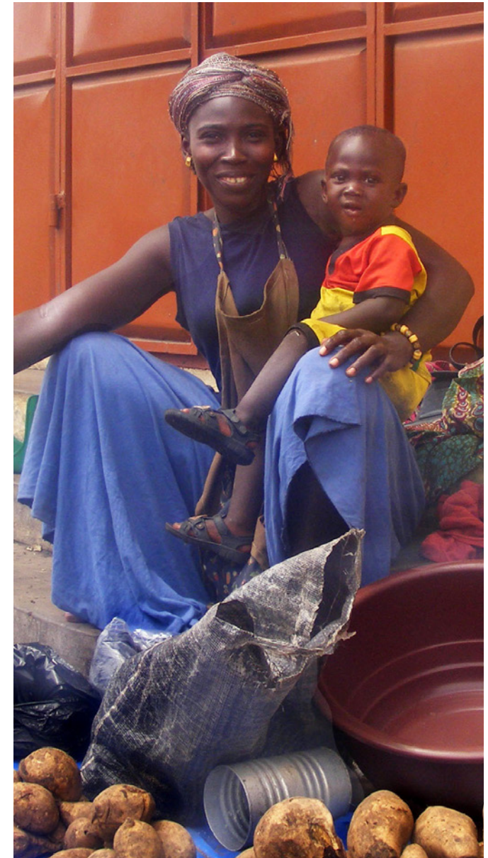
Women street vendors comprise over half of all informal workers in the GAMA region. For many, like the street vendor pictured here, this income is their sole means of providing for their families.

Low earnings usually characterize the informal economy. More than half of the workers in the informal economy earn below the legislated national minimum wage, work long hours, have no or little education, lack social and legal protection, and have a low level of organization or unionization (Baah 2011). Informal economy workers face exposure to