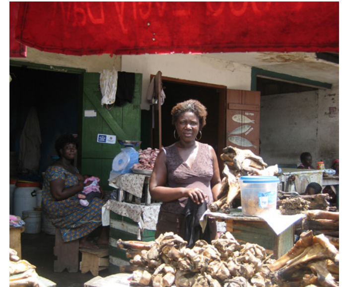
An informal vendor in the market making use of the cramped space available to sell her wares.