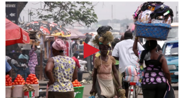
Head Porters in Accra Access Opportunity Through an Informal Savings Bank.

In 2014, WIEGO started a new partnership with the People’s Dialogue on Human Settlement. This community-based NGO works in alliance with the Ghana Federation of the Urban Poor, which is a network of savings groups in slums, informal settlements, and depressed communities in Ghana. This partnership is for the implementation of the Local Economic Development-Led Forum. It was a one-year project meant to step up and strengthen the existing work WIEGO has been doing with the market traders and street vendors and the existing fora and platforms they have cre-