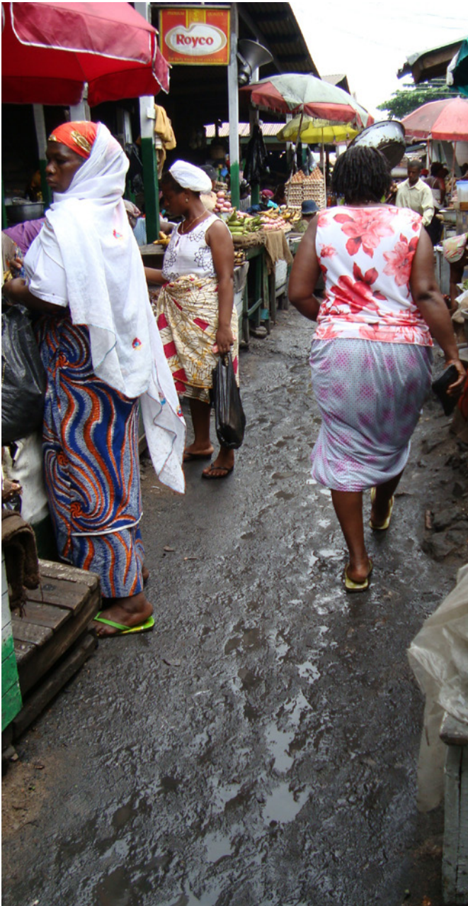
A rainy day for Accra market vendors means a muddy trek for their customers.

they organized “clinics” with some of these officials by inviting a local government financial expert to have in-depth discussions with the traders on how to deal with officials of the Ghana Revenue Authority in relation to income tax and VAT. They also invited the Chief Budget Officer of a local government authority who explained to them the functions of the local government and the relationship that should exist between traders and their local government. Outside the workshops, WIEGO and ILGS organized dialogue sessions between the traders and officers from the National Board for Small-Scale Industries, the Ghana Revenue Authority, the Accra Metropolitan Assembly (AMA), the National Health Insurance Scheme (NHIS), the Informal Sector of the Social Security, and the National Insurance Trust.