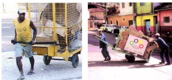
Street pickers-Nova Lima-MG

A National Training Programme was started whose innovative character lies in the coordination of the various sectors involved in waste management, where each part continued to take up its specific responsibility, though within a framework of integrated work which enabled each institution involved to acquire an overall