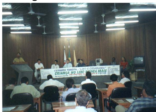
A seminar organized by the Municipal Waste & Citizenship Fórum of Paracatu City (Minas Gerais State)

To be able to have a long-lasting effect, Waste & Citizenship Forums need to evolve into Waste & Citizenship Councils (at national, state and municipal levels). The 1988 Brazilian Constitution has incorporated policy-making institutional arrangements - called Councils for Public Policies 21 -, which have deliberative powers, meaning that decisions taken in its ambit must be enforced. Although the existence of the Waste & Citizenship forum has been able to bring about many achievements in the area of solid waste management,, there is a widespread feeling that the implementation of the waste & citizenship principles needs a stronger legal backing so as to be able to consolidate progress made, requiring the evolution into Councils.