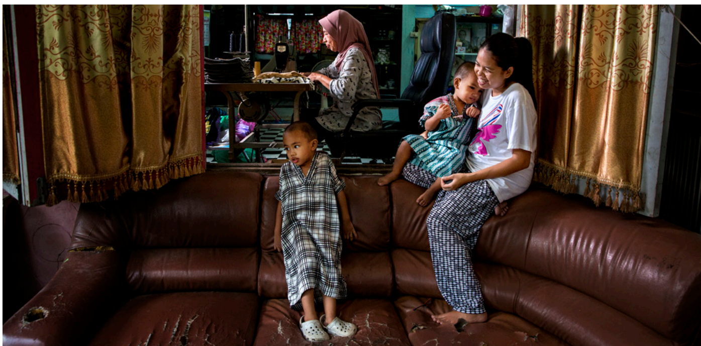
A home-based worker sews garments while her grandchildren play in their home in Bangkok, Thailand.