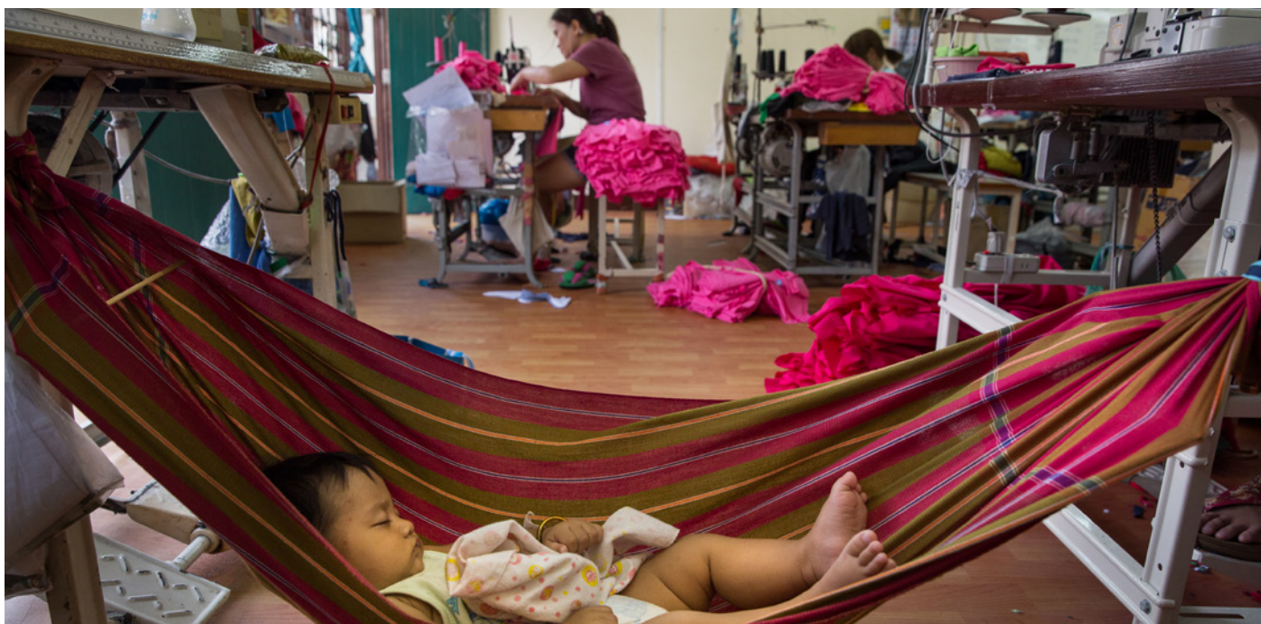
The 6-month-old child of a garment worker naps while her mother sews at a garment factory in Bangkok, Thailand.

“ Before when I didn’t have a small child, I used to work till late, around 16:00 or 17:00. Trucks bring good materials at the end of the day and I feel that I am missing out on all of this. ”