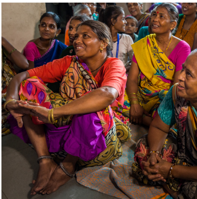
A group of women listen during a nutritional meeting about healthy foods at the BalSEWA centre in Ahmedabad, India.

able to save money for their old age. While all women workers may experience this problem, informal workers in the global south experience it most acutely as they do not have access to the labour and social protections that can help formal women workers to manage child care and paid work. In this way the responsibility for unpaid care work generates and reinforces social inequality.