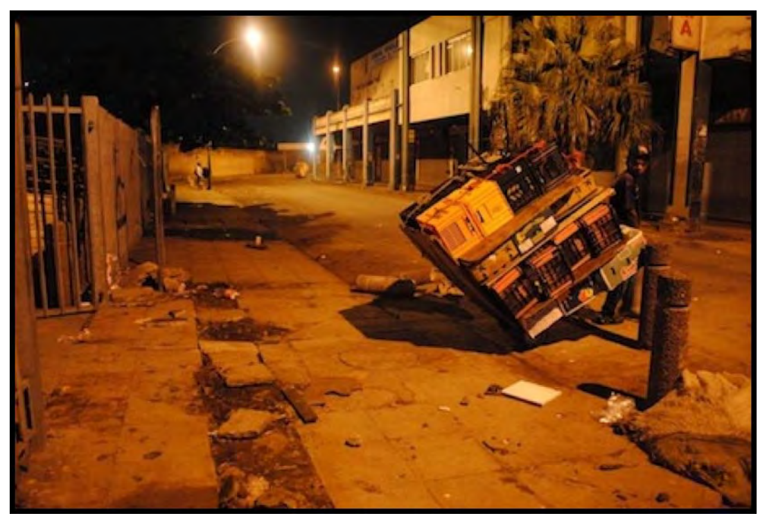
A barrow operator successfully pulling his barrow over broken cement (4/20/11)