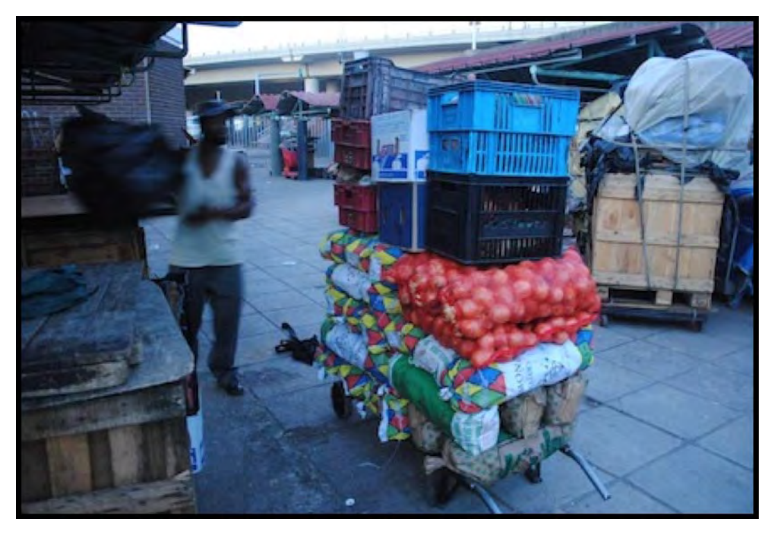
Barrow in storage area outside Victoria Street Market (4/20/11)