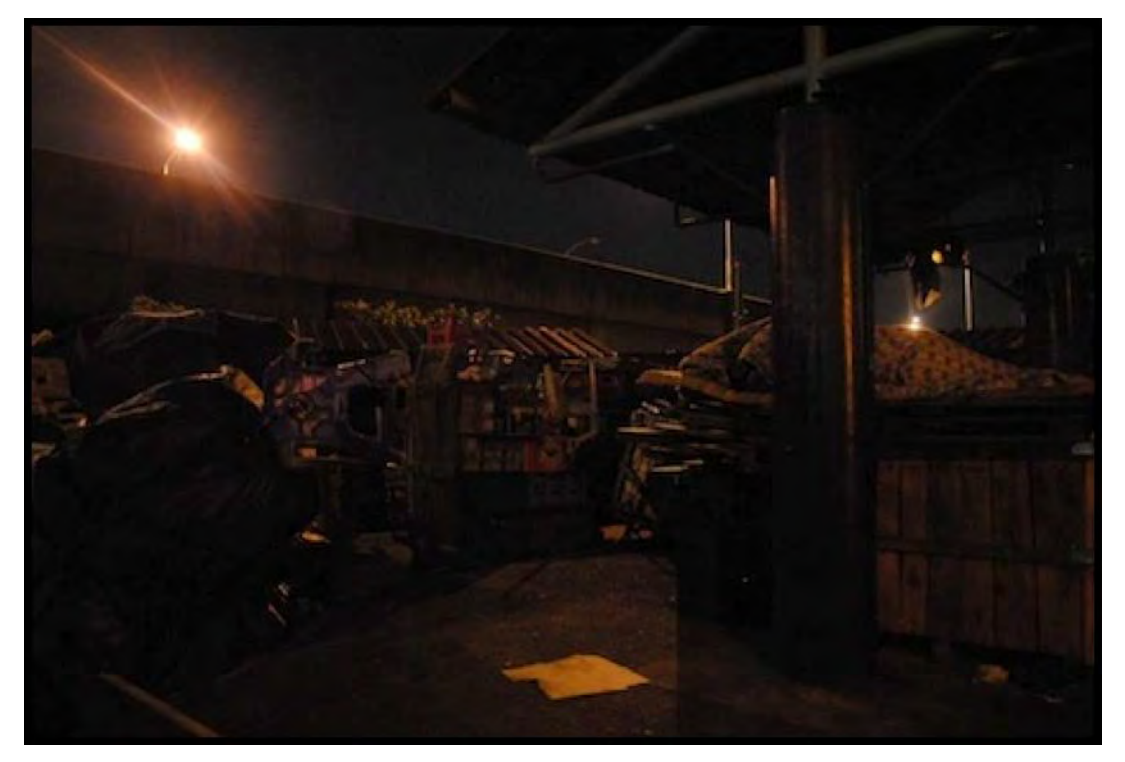
Barrow operators sleeping under blankets in storage area outside Victoria Street Market (4/20/11)