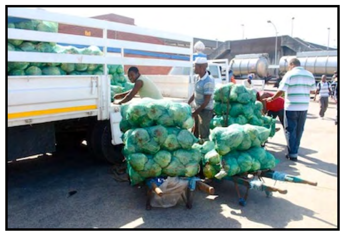
Goods being offloading onto barrows on south side of the Early Morning Market (4/7/11)