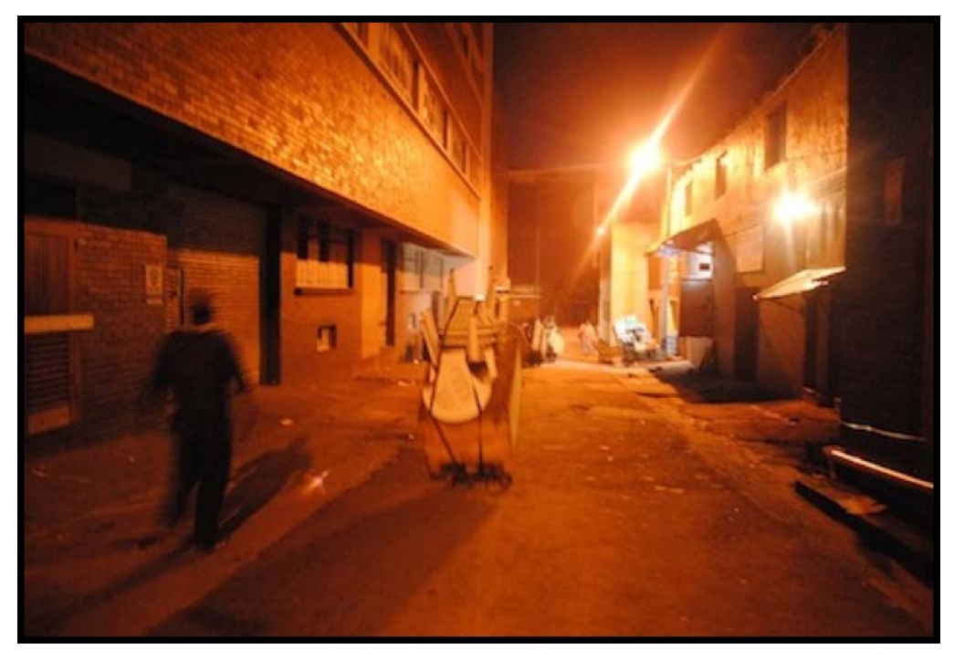
Following Eric Mthethwa on his route from the storage center to the Bovine Head area (4 AM 4/20/11)