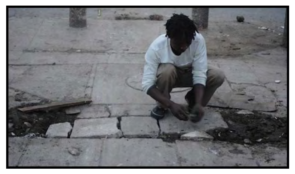
A barrow operator patches holes with pieces of broken cement to pull his barrow out of a storage area outside Victoria Street Market (4/20/11)