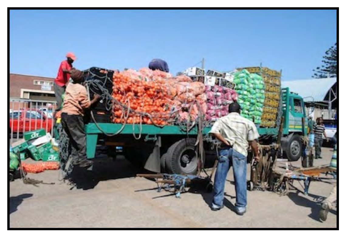
Fruits and vegetables being offloading onto barrows on south side of Early Morning Market (4/7/11)