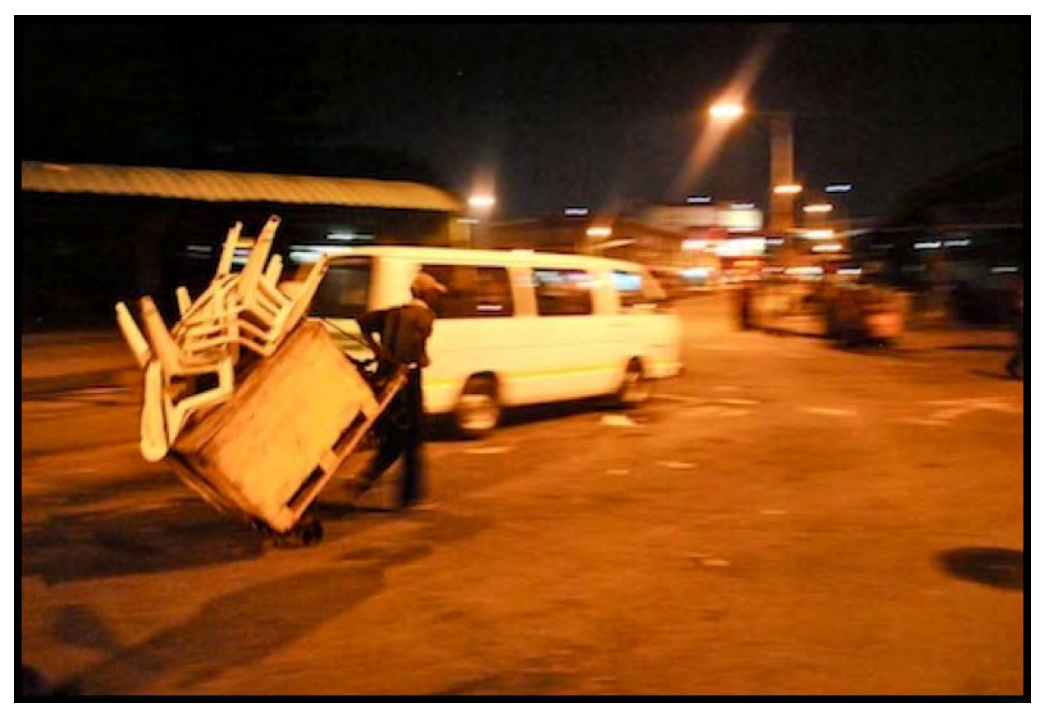
Eric approaching the bovine head area (4 AM 4/20/11)