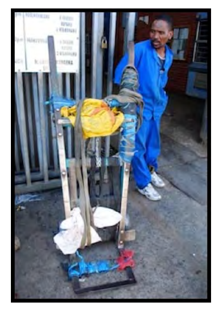
Older metal barrow with wooden handles

Barrows carry between 100 kg and 500 kg of goods. Barrows are expensive, and can be bought for around R3000. The majority of informal traders own the barrows that they rent to their barrow operators to use.