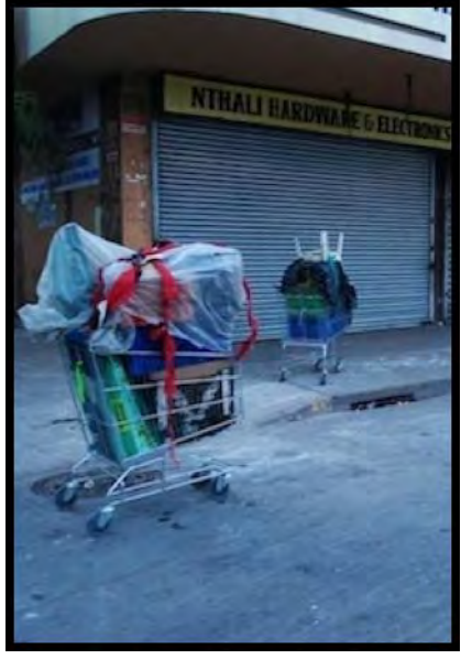
Shopping card barrows