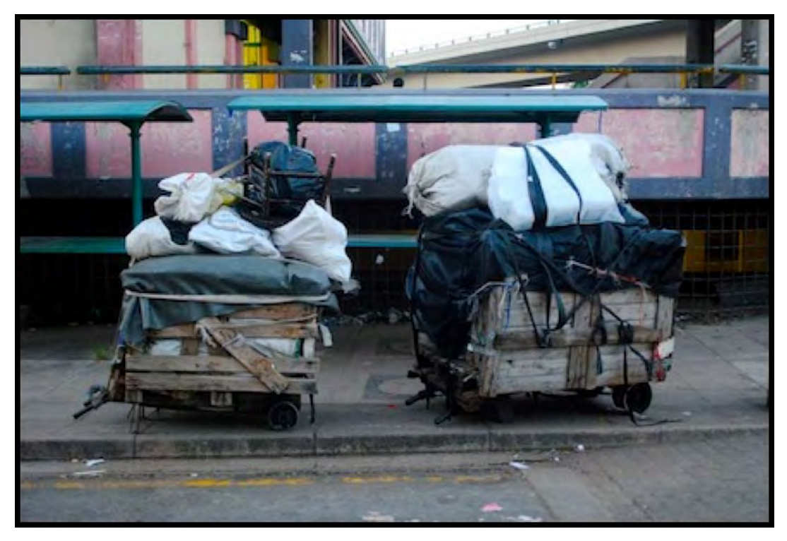
Barrows dropped off trader stalls outside Victoria Street Market (4/20/11)