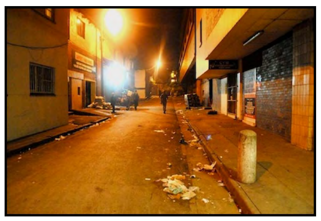
View from back alley that connects street to storage (4 AM April 20th, 2011)

Eric allowed Patric and me to follow and photograph his morning shift (2:30 AM-4/4:30 AM) moving goods from the storage areas to Lindiwe's stall.