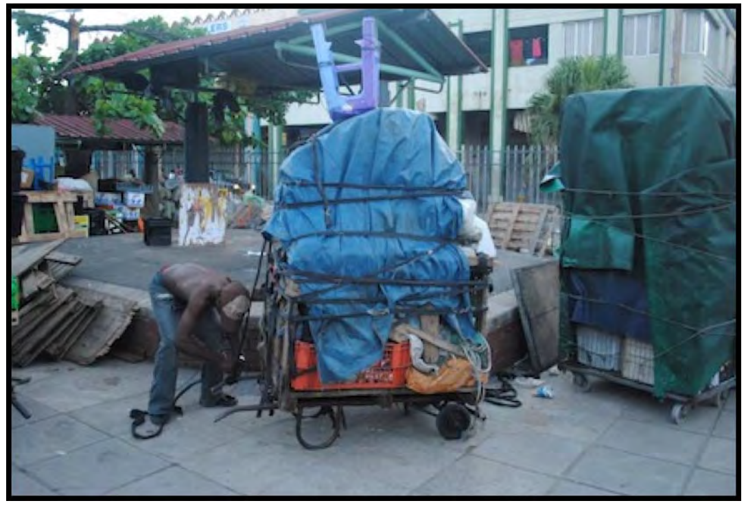
Another barrow in the same storage area outside Victoria Street Market (4/20/11)