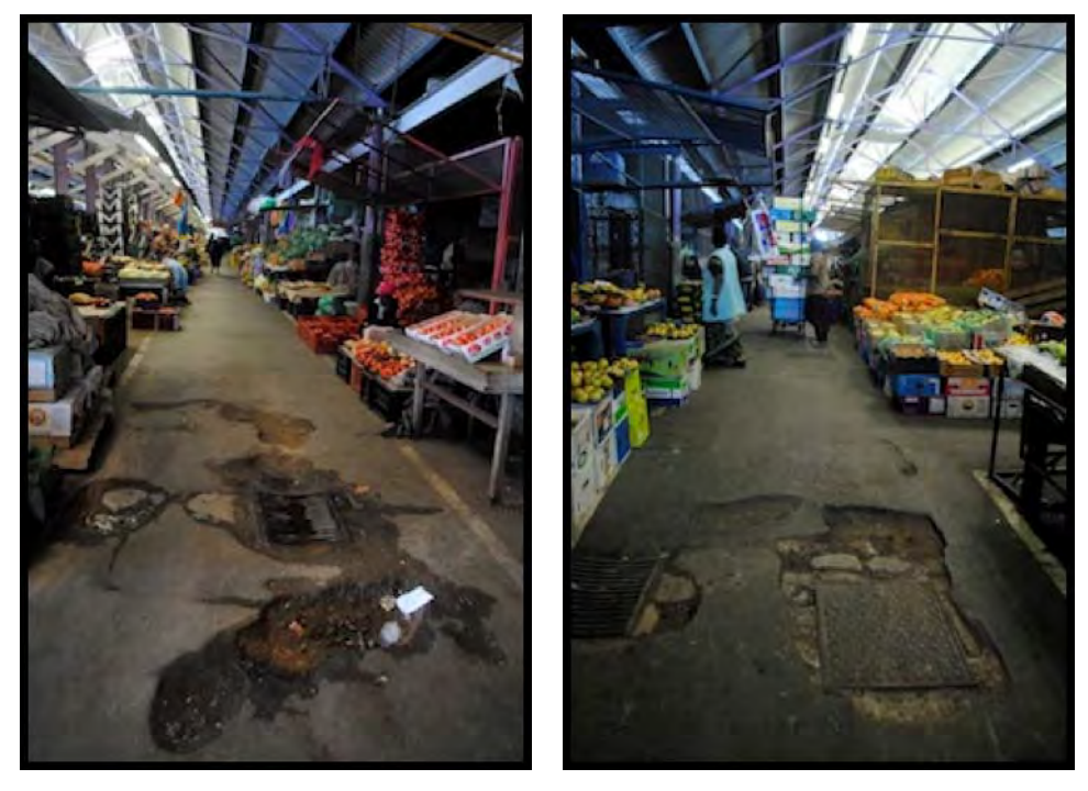
Potholes inside the Early Morning Market (4/7/11)