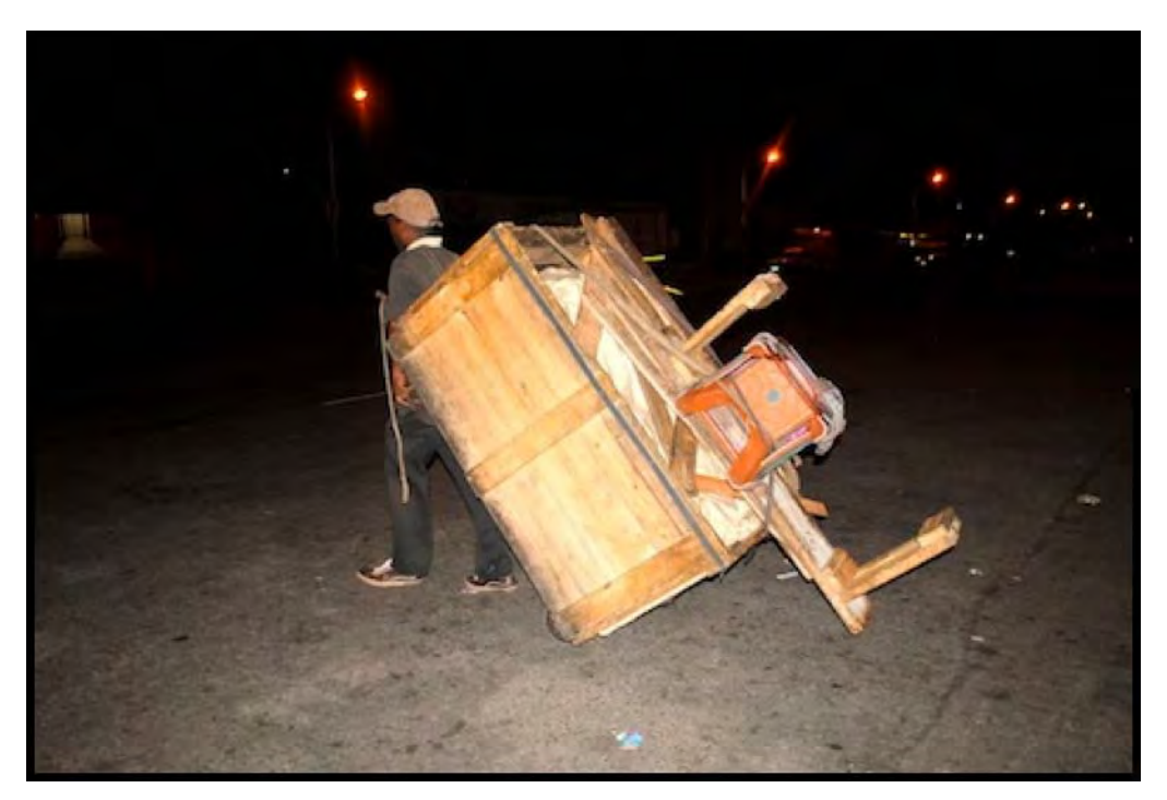
Eric crossing a main road in route to bovine head area from the storage area (4 AM 4/20/11)