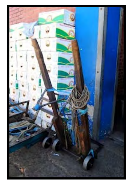
Old wooden barrow