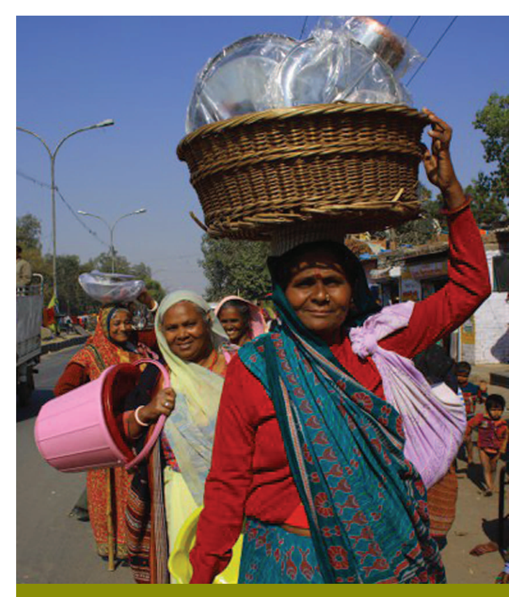
India's National Policy on Urban Street Vendors explicitly recognizes the contributions of street vendors to urban life.

In India, a national policy is essentially a statement of intent by the government and does not have the legal "teeth" that a law has.3 Rather, it is often an important first step toward the establishment of laws. Though its implementation since 2004 has been weak and uneven, India's Supreme Court has upheld the fundamental rights of street vendors in court cases over time, and in October 2010 called on the government to enact a law on street vending no later than June 2011. This Supreme Court judgment reinforced the need for state and local governments to implement binding laws based on the National Policy.