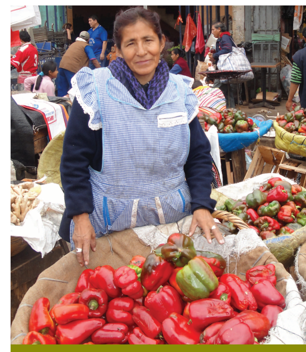
The Women's Network of Street and Market Vendors (Lima, Peru) combats the underrepresentation of women in leadership positions within street vending organizations.

One promising example of a new model is the Women's Network of Lima. Women represent two-thirds of all street vendors in Lima, and yet very few women hold leadership