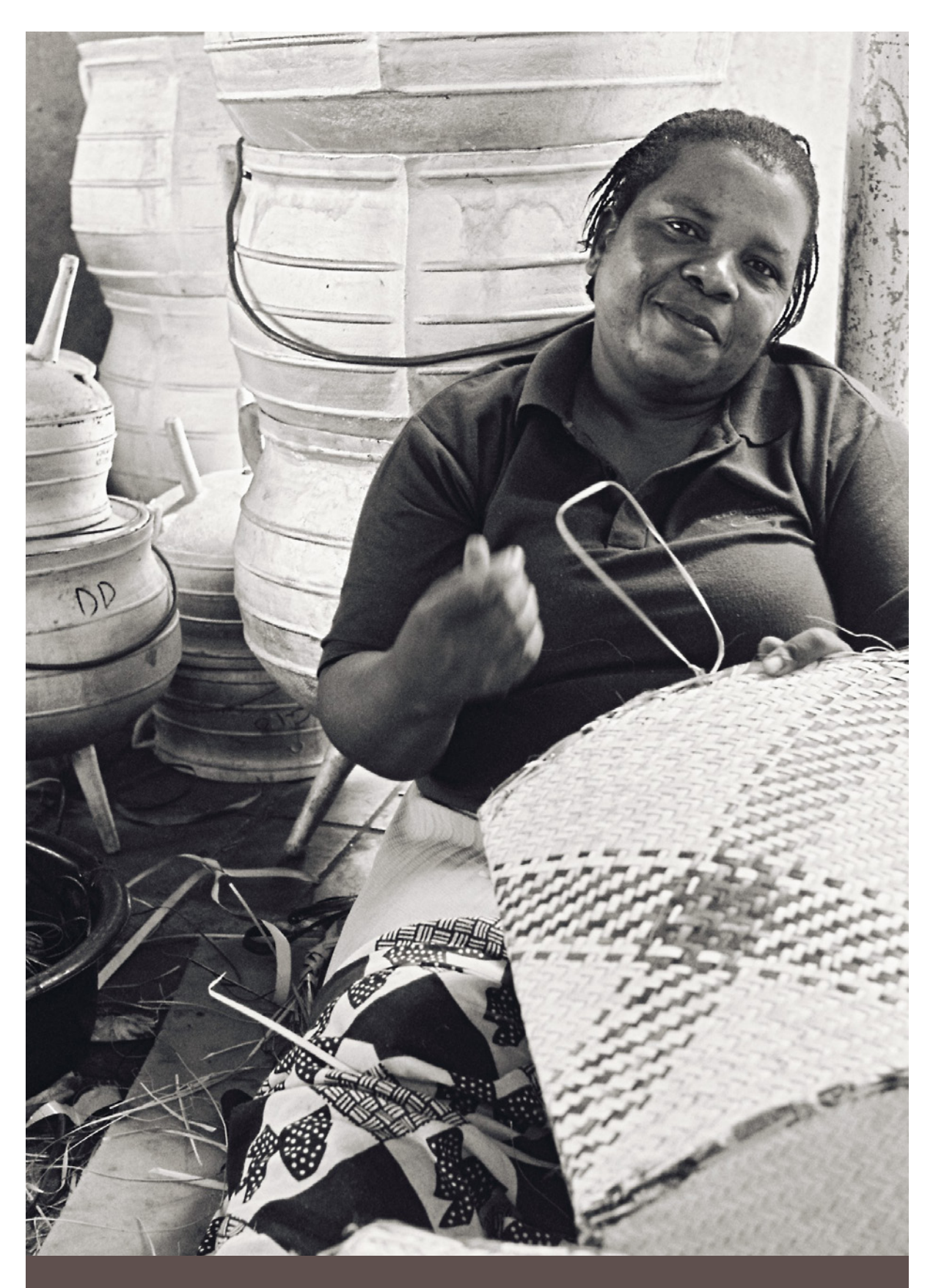
Durban's street vendors weave baskets to sell as these are popular with tourists. Traders in the coastal city have felt a sharp drop in income with COVID-19 restrictions severely hampering tourism.

WIEGO website. 2020. COVID-19 Crisis and the Informal Economy: WIEGO Global Impact Study. Available at: https://www.wiego.org/covid-19-global-impact-study