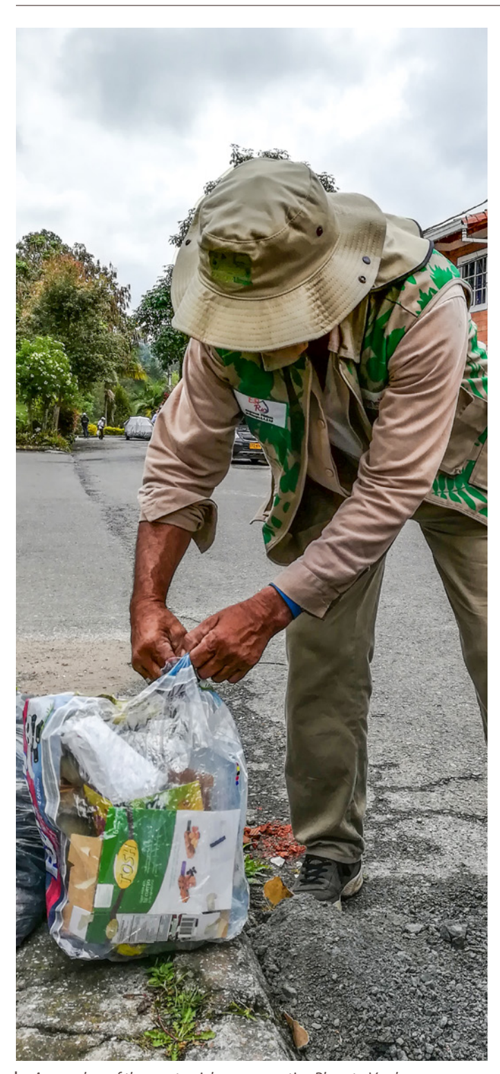
A member of the waste picker cooperative Planeta Verde.