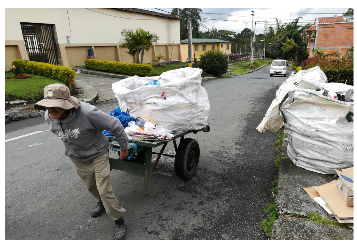
On the recycling road.

City Council of Bogota. Article 2 of this agreement restricts the beneficiary population to those waste pickers experiencing conditions of poverty and vulnerability. Translated, it reads: