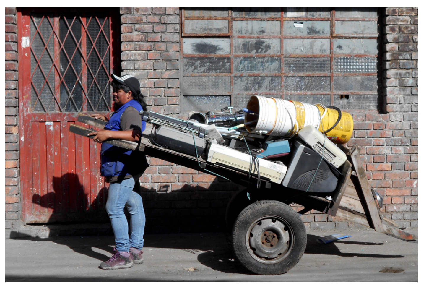
A human-powered vehicle called 'Zorro'.