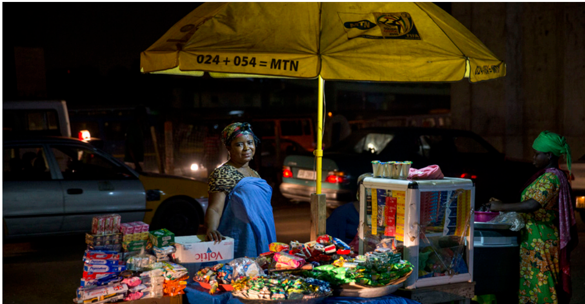
Work-related violence can come from a number of sources, most prominently: the state, fellow workers, household members, the public and/or users of the service provided by the informal worker, criminal actors, and powerful vested interests.

“Each member shall take appropriate measures to prevent violence and harassment in the world of work, including: (a) recognizing the important role of public authorities in the case of informal economy workers;” (Art. 8).