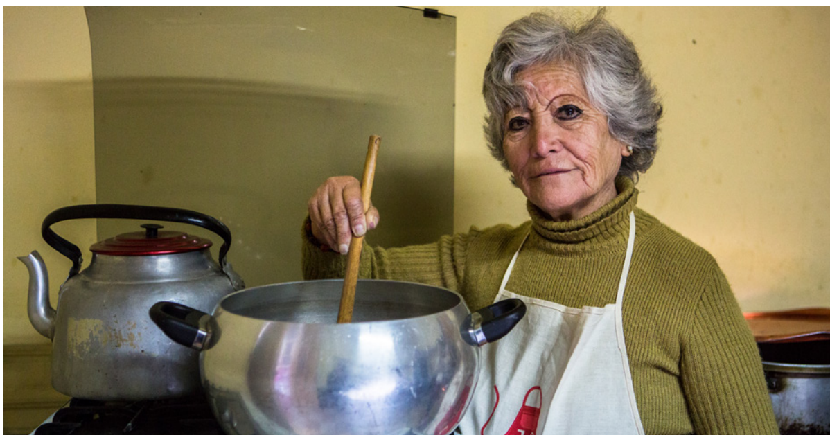
Workplaces, such as private homes, leave women susceptible to violence due to isolation and a lack of access to complaint and legal recourse mechanisms.

violence, at the workplace (para 11). Integrated strategies to address violence can aim at improving national legal frameworks, strengthening OSH and labour inspection, extending social protection, and organizing informal workers (ILO 2018a). A more pluralistic approach is needed. First, this requires bringing together different parts of government beyond the labour inspectorates, including urban authorities, law enforcement, and legal and social security services to prevent and address the violence informal workers face.