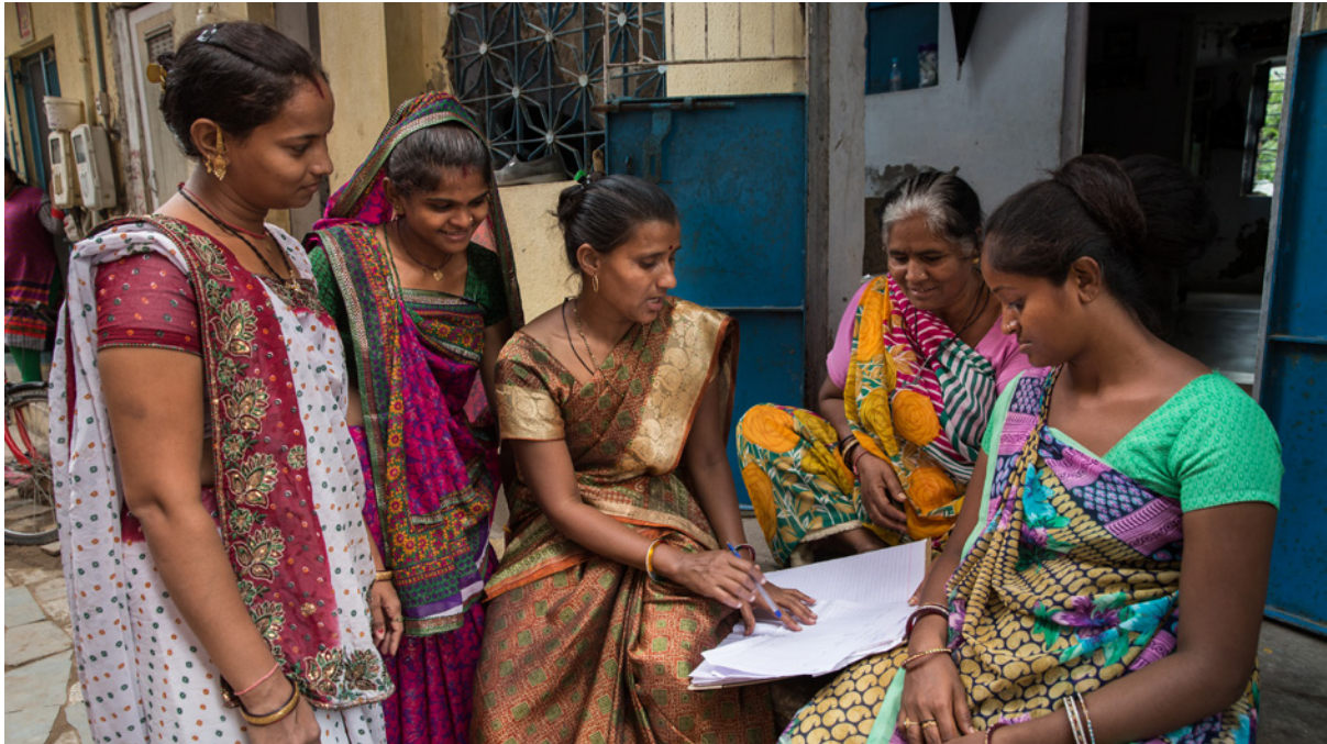
Organizations of informal workers need support to train women leaders among their membership on how to address violence and harassment at work.