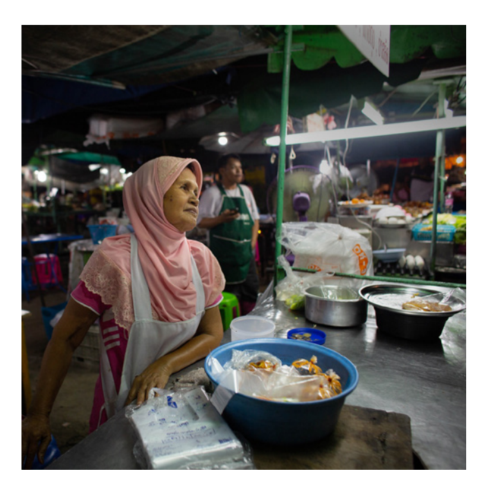
Informal workers are a significant part of the labour force in Thailand.