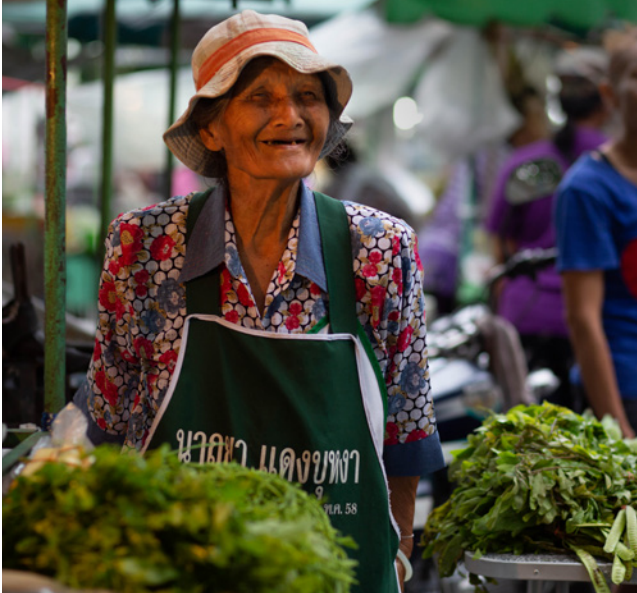
Many informal workers in Thailand begin work at an early age and continue to work after age 65.

www.wiego.org WIEGO Statistical Brief Nº 20 | 7