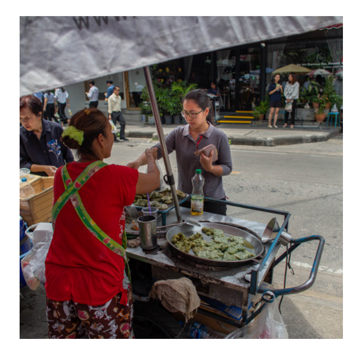
Street vendor at work in Bangkok, Thailand.

Nearly three-quarters of home-based workers are informal. Rates of informality among women are substantially higher than among men. The majority of