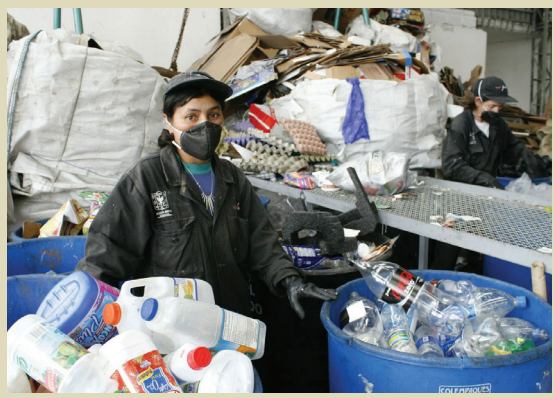
Alqueria recycling centre, Bogota.