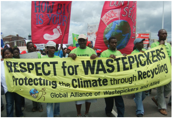
Waste pickers unite and rally at COP 17 in Durban.