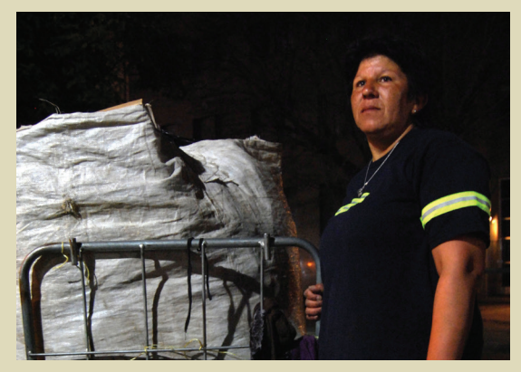
Cartoneando, Excluded Workers Movement, Argentina.

A recent study <sup>5</sup> shows that 1.5 million new jobs stand to be created in the United States by diverting waste away from landfills and incinerators toward reuse, recycling, and composting initiatives. The European Commission estimates that 400,000 jobs would be created in Europe just by implementing the current policies on recycling.