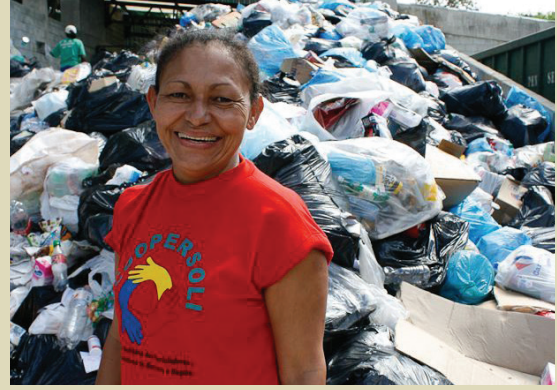
Coopersoli waste picker, Belo Horizonte.