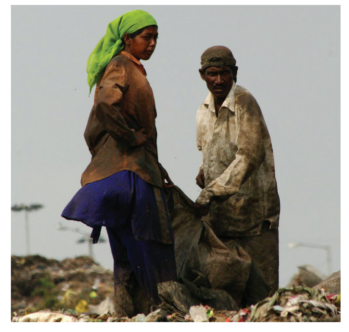
Uruli landfill, Pune.

Waste pickers usually belong to socially excluded and economically marginalized populations—e.g. Dalits and minorities in India, blacks in South Africa, Vietnamese refugees in Cambodia, displaced rural people in Colombia, and Zabbaleen/Coptic Christians in Egypt. Waste picking is an occupation that offers easy entry, flexibility of hours and worker autonomy. Although vulnerable, the waste pickers have agency and often choose to work in this sector, which can offer better returns on labour than their other options. Formalization and/or privatization should not displace or exclude the already marginalized waste pickers for whom the informal recycling sector has provided space.