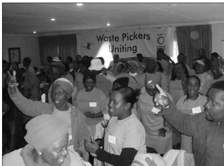
Delegates at the First National Waste Picker Meeting