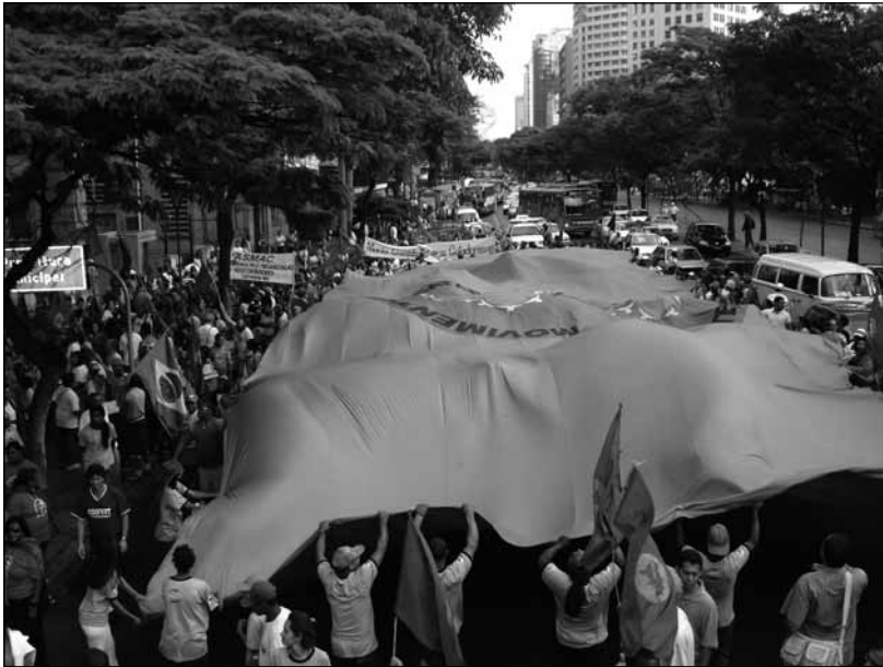
MNCR Brazil, march against privatisation

Forum of Studies on Street Dwellers with the support of the Pastoral de Rua , the Belo Horizonte municipal administration and many other organisations (Dias and Alves 2008, 9-10). In June 2001, the National Movement of Catadores (MNCR) was founded by the more than 1,700 catadores who attended the first National Congress of Catadores held in Brasilia ( www.mnccr.org.br ).