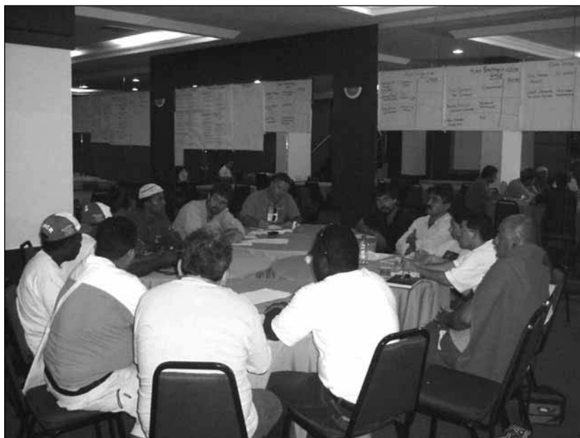
First meeting held at the World Social Forum in Porto Alegre, February 2005