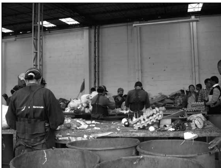
Alqueria Recycling Centre, Bogota