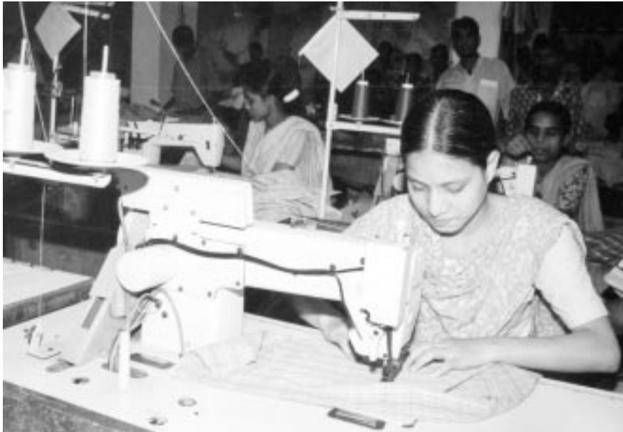
Women machinists work long hours.