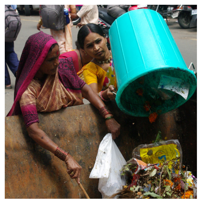
Waste picking is a necessary livelihood in Pune–but one that most workers feel is threatened.