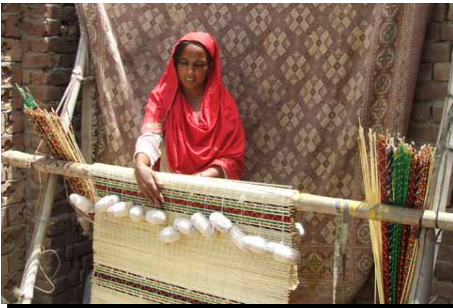
A self-employed home-based worker in Kasur, Pakistan making traditional blinds, or chiks.

Round 2 findings suggest that recovery has been weak and uneven across the worker groups since mid-2009. Most participants are still experiencing the impacts of the recession, most notably sustained competition pressure. Few new entrants driven into the informal economy by the crisis seem to have re-entered the formal economy. Even as the economy picks up, retrenchments and austerity measures within the formal economy persist, pushing more new entrants into informal work. In Round 2, waste pickers reported some rebound in the prices they receive for recycled goods, but prices, as well the volume of waste available, remain below pre-crisis levels. Self-employed home-based workers reported continued decreased demand. Local buyers continue to buy less – and buy less often – than they did prior to the crisis, and sales related to tourism have not recovered. While sub-contracted workers generally reported an increase in the number and volume of work orders, piece rates have not risen over either Round 1 or 2 of the study. Street vendors experienced neither an increase in demand nor a decrease in competition from new entrants.