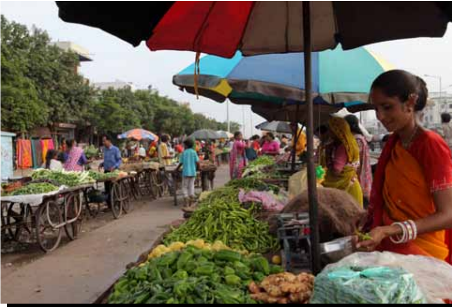
Street vendors selling vegetables in Ahmedabad, India.

This crisis will not be the last; the lesson that must be learned is one of minimizing exposure and building capacity for those at the bottom of the economic pyramid.