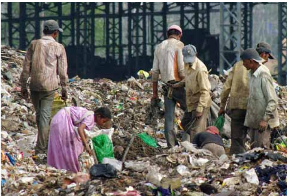
Waste pickers searching for material at a landfill in Pune, India.

Many of these were the children of home-based workers, who often involve their children in their work to help boost production. Most did so reluctantly, out of necessity. They worried how this would impact on their children's future employment prospects. One vendor from Ahmedabad, India, said, "I am a widow. My youngest daughter was studying in fourth standard but with the crisis I had to stop her schooling. Now she works as a kitchen helper earning Rs 5 a day." 60