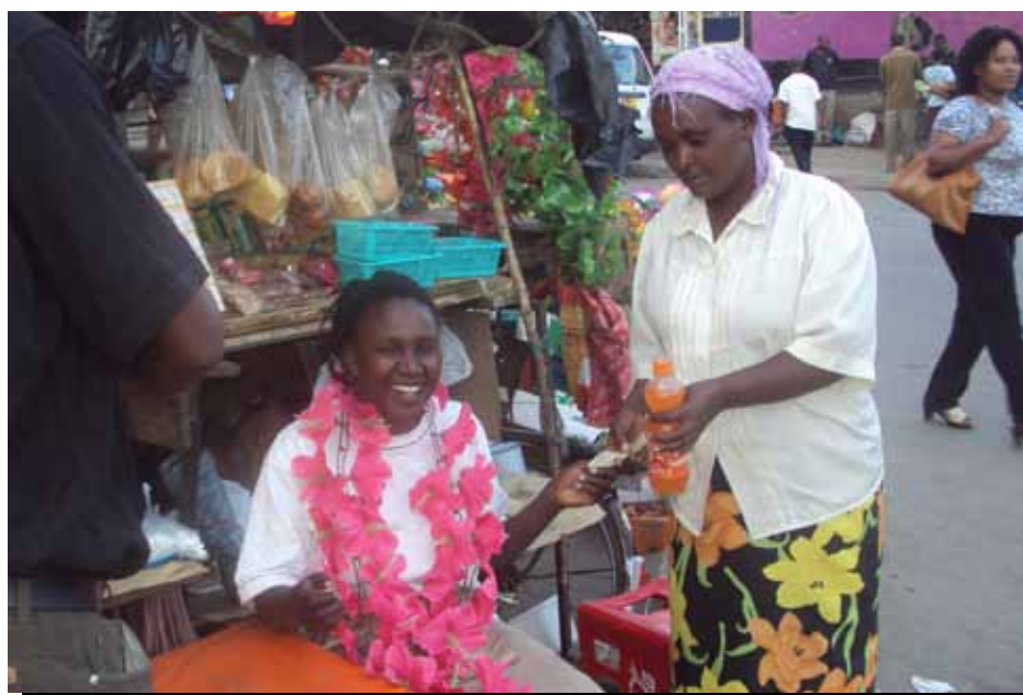
Street vendors at work in Nakuru, Kenya.

Compounding the loss of customers in the Besters market to the new mall and due to nearby factory retrenchments, as described above, the number of vendors in the area increased during 2009. Vendors at Besters are not organized and have no formal mechanisms to control the number of