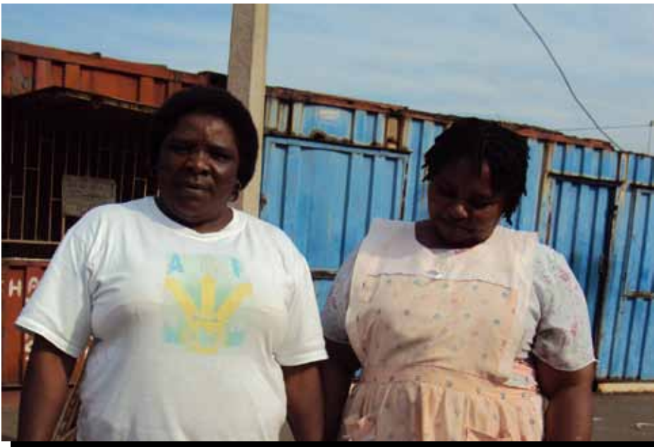
Street vendors at the Besters vending site in Durban, South Africa.

Even where there is social insurance for the poor, the problem of access is very high. In Colombia, candidates for the System for the Selection of Beneficiaries of Social Programs (SISBEN) are classified into strata according to their socio-economic level. Most of the social subsidies and public health programs are focused in the first stratum, from which most informal workers in the study were excluded, despite their modest earnings.