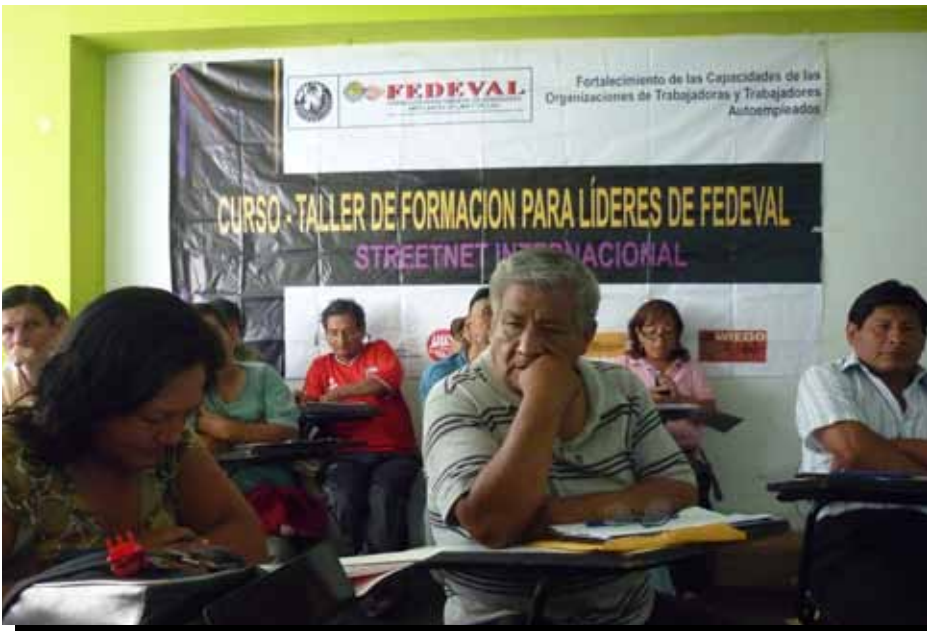
Street vendors from study partner FEDEVAL meet in Lima, Peru.

This report proposes a number of policies to help address the existing vulnerabilities of informal workers and minimize the impact of the crisis on them. The emergency measures, employment policies and social protection measures discussed are based on recommendations prioritized by the study respondents. A new stance on informality must place informal workers at the centre of employment schemes and social protection measures, and include them in economic policies and urban planning. Without serious rethinking and decisive action, there will be limited capacity to improve the vulnerability and inequality facing informal workers across the globe.