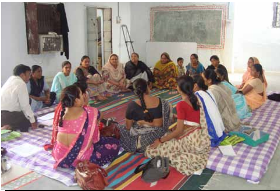
Participants from study partner SEWA engage in a focus group discussion.

Formalization and integration – Most street vendors and waste pickers wanted to register and be integrated into the formal regulatory environment, but expressed concerns about the nature of the process. Waste pickers in Colombia and India valued their autonomy and as well as their association with other informal workers.