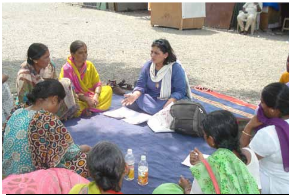
Informal waste pickers from study partner KKP KP participate in a focus group in Pune, India.

The participation of MBOs as research partners was key. Their knowledge of, and relationship with, local informal workers was central to maintaining study participation over time. Familiarity helped mitigate scepticism among participants and handle sensitive subject matter in the interviews. MBOs were also well placed to provide clarity and navigate the complexities of this highly contextual research. To the best knowledge of the study designers, the contribution of MBOs as research partners is a unique feature among studies addressing the impacts of the global economic crisis.