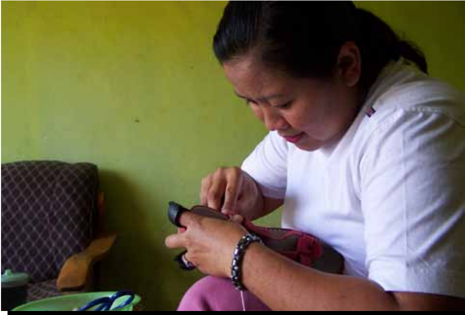
A sub-contracted home-based worker in Malang, Indonesia making shoes for export.

with other home-based workers through their own organizations and can provide estimates of new entrants. Sub-contracted home-based workers felt no significant change in employment between the first and second rounds. Among shoe producers and badminton racket producers in Malang, Indonesia, production picked up after mid-2009 but did not lead to new jobs, either formal or informal. This is because the sub-contractors did not recruit new workers but rather utilized known contractees to fill orders. 27 In part this is because home-based production is often quite skilled, which can make it difficult for new workers to rapidly enter or be hired in the segment. Any new sub-contracted producers are likely to be former employees of the sub-contracting firm or nearby firms involved in similar production. Home-based producers in Sialkot, Pakistan reported that the 2010 World Cup had not created many employment opportunities for women football stitchers. 28