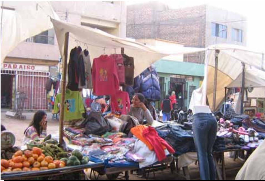
Street vendors selling their wares in Lima, Peru.

The situation at the Besters market in Durban, South Africa illustrates the difficulty of moving vending locations. The new mall in the area dramatically reduced the number of customers frequenting the marketplace. But the vendors did not know where to move. Barred from vending near the mall, the vendors felt their best option was to stay at the Besters market. As one explained, “I tried trading in another area, Veralum. The monthly rent was too high and I couldn’t make enough money.” 50