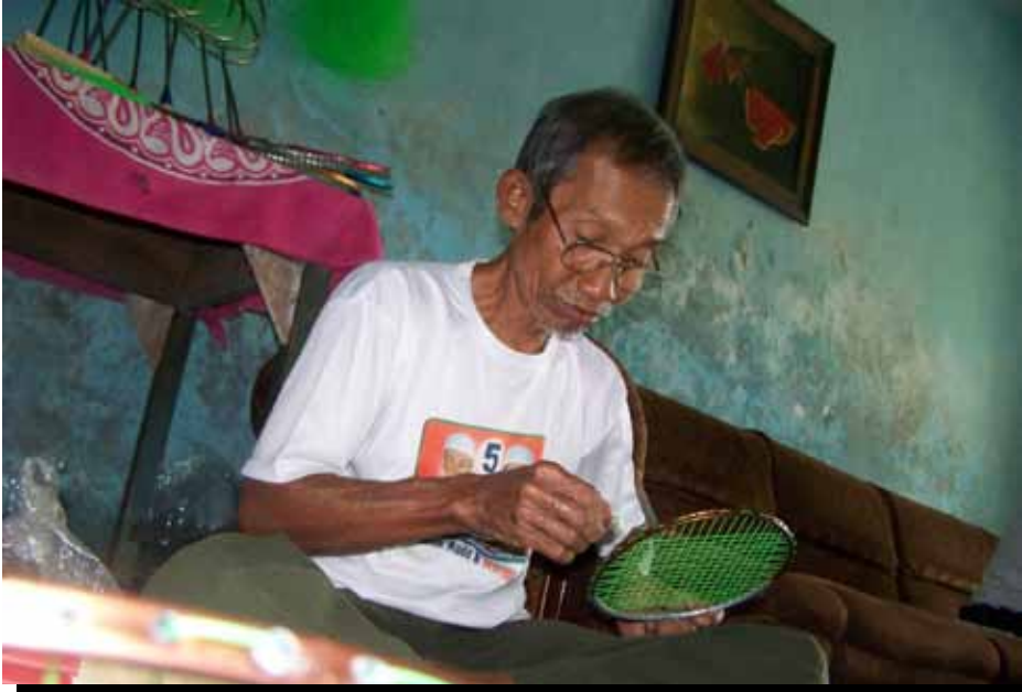
A sub-contracted home-based worker in Malang, Indonesia making badminton rackets.

traditional bamboo shades (chiks) became unprofitable as the price of the raw material (bamboo) rose and older designs were going out of fashion. Between Rounds 1 and 2, there was no recovery in demand from domestic or international buyers. In response, by Round 2, most chik-makers in Kasur had turned to twisting rope while some tried making decorative chiks in response to changing tastes. By Round 2, those who had switched to rope production had done so for only a few months but felt it generated higher earnings than chik-making. Wooden toy producers in Chiang Mai, Thailand shared a similar story. In response to a sharp drop in overseas orders through most of 2009, they experimented with new games and other products. Many of the new orders they received in early 2010 are for these new products.