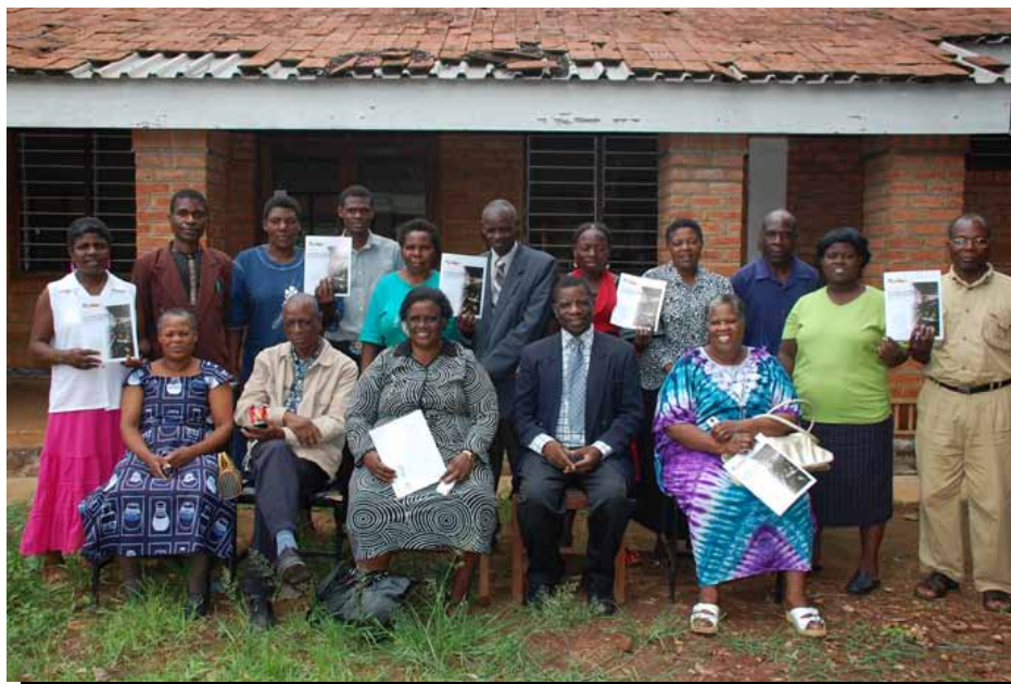
Participants holding the study's first report, "No Cushion to Fall Back On" in Blantyre, Malawi.

In early 2009 the partners of the Inclusive Cities project, coordinated by Women in Informal Employment: Globalizing and Organizing (WIEGO), initiated a study to investigate the impacts of the global economic crisis in urban locales across Africa, Asia, and Latin America. The first round of research provided a rapid assessment of the on-the-ground effects of the crisis in 14 locales, among workers in three segments of the informal economy: home-based work, street trade and waste collection. The first report, No Cushion to Fall Back On 1 (August 2009) discredited the widespread notion that the informal economy 2 escaped harsh impacts during the crisis. Findings confirmed that informal enterprises and wage workers in the study were affected by the crisis in many of the same ways as formal firms and formal wage workers. In addition to declining demand, participants faced increased competition from new entrants to informal employment; participants also had little access to social or economic protections. Additional research in Asia 3 reinforced the evidence that, while the informal economy provided some work opportunities