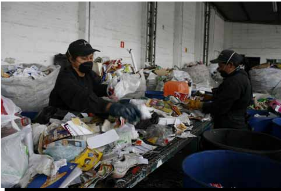
Informal waste pickers sorting waste material at a recycling centre in Bogotá, Colombia.

“Government policies and actions have actually destroyed our work and cut the family income. In the last ten months the situation has become worse and worse.”