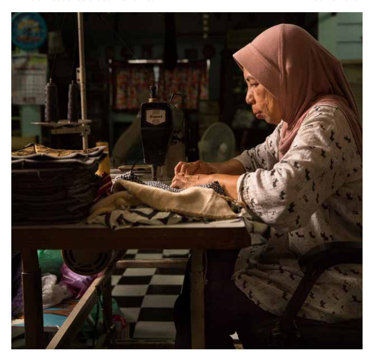
Homeworkers in Global Supply Chains: A Review of Literature