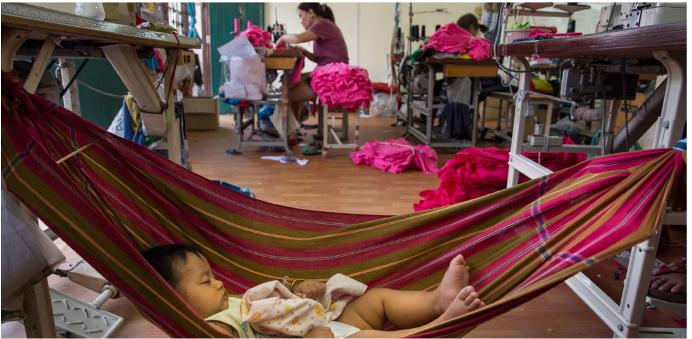
Lo umntwana onezinyanga eziyisithupha uzalwa umsebenzi othunga izingubo, uyalala ngesikhathi umama wakhe esebenza efemini elikhqiza izingubo eBangkok eThailand.

“ Phambilini, lapho ngangi ngenayo ingane encane, ngangisebenza kuze kushaye u 16:00 noma u 17:00. Kuvamile ukuthi amathilagi alethe izimpahla ezinhle ngezikhathi zantambama lapho mina ngisuke sengingasekho, ngizizwa ngilahlekelwa kakhulu, ngoba ngilahlekelwa yithuba lokuba khona ekudayiseni kwasemakhethe ngalesisikhathi. ”