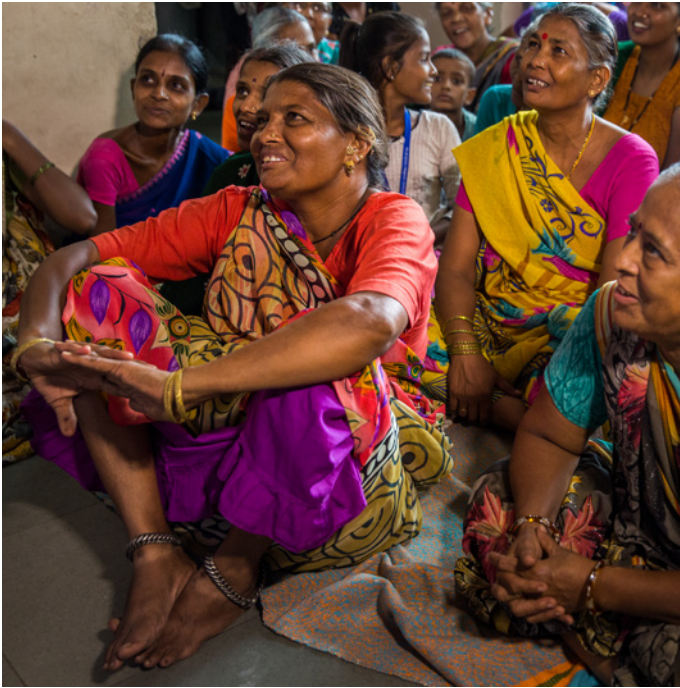
Iqembu labantu besifazane lilalele emhlangenweni kuxoxwa ngokudla okunomsoco obuse BaSEWA centre eAhmedabad eNdiya.

engenayo njalo kungaqhubeka impilo yonke ngoba ukulahlekelwa iholo ngokuthi usebenza umsebenzi ungasoleli, kusho ukuthi abesifazane abakwazi ukuthi balondolozwe imali abazoyisebenzisa uma sebethathe umhlalaphansi. Nomake abasebenzi besifazane bonke benayo lenkinga, kodwa labo ebazisebenzayo eningizimu esemzansi emhlabeni yibo abayizwela kakhulu lenkinga ngoba abanako ukuvikeleka ngokomsebenzi kanye nokwezenhlalakahle okungasiza ukuthi abesifazane abazisebenzayo bakwazi ukunakekela abantwana babo futhi baqhubeka basebenze. Ngalandlela lomsebenzi ongenaholo wenza futhi ugququzela ukungalingani kwamathuba.