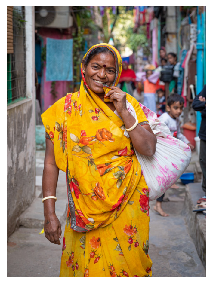
A street vendor member of SEWA in Delhi.