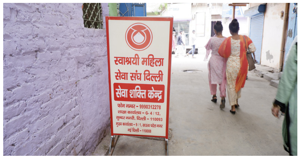
Aagewans (grass-roots leaders) walk past the SEWA Shakti Kendra centre in Sundarnagari, Delhi, which was used as a hub for relief distribution during the pandemic.

Early in the pandemic, my engagement with an official led to the creation of a unified resource pool of food supplies. SEWA Delhi offered the use of the SEWA Shakti Kendra centres as distribution hubs. I shared ideas like giving rations to the