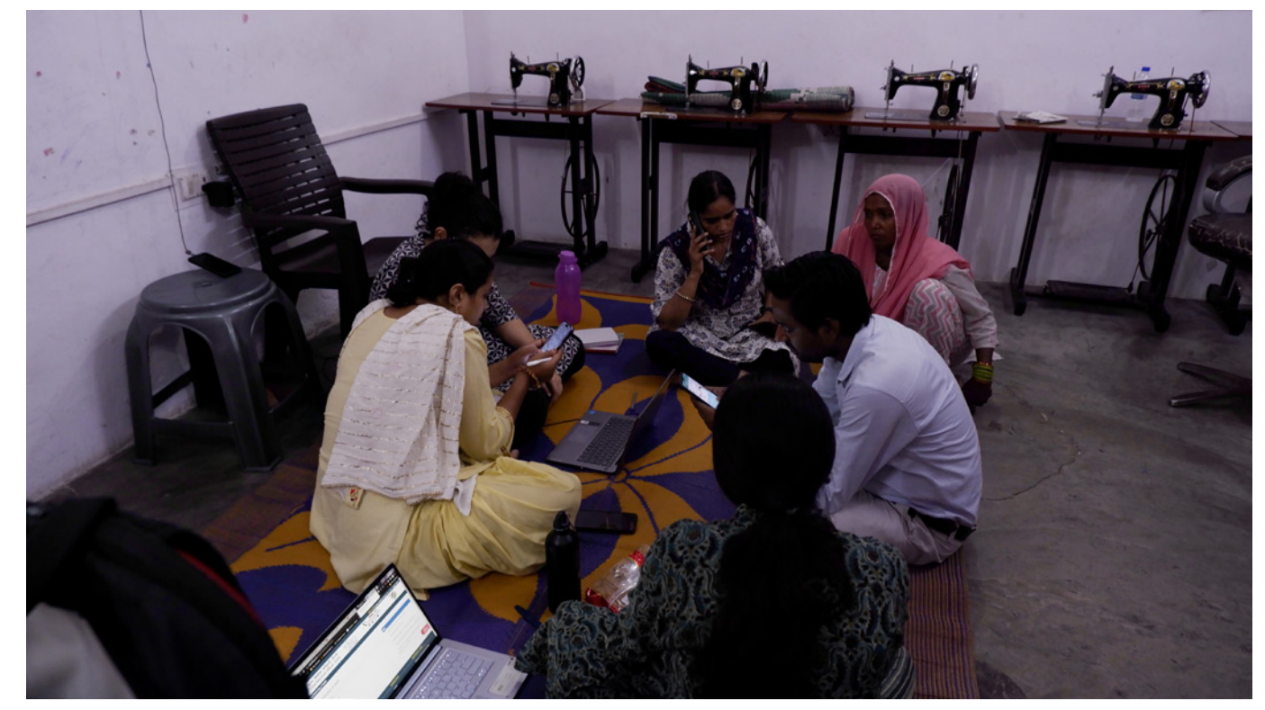
SEWA organizers at one of their regular meetings that took place throughout the pandemic.

The strategy employed in relief efforts in the first wave clearly demonstrated that a collaborative model involving civil society organizations and the government was the most effective way to address pandemic challenges. This was especially evident in ensuring the last-mile delivery of food, medical supplies and other essential