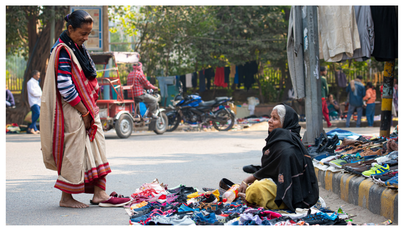
A vendor selling used goods at the weekly mahila bazaar – a women's market supported by SEWA.

Addressing the need for livelihood rejuvenation after the pandemic, SEWA Delhi supplied direct financial aid to those in need via the SEWA Delhi Credit Cooperative Society. Additionally, they partnered with financial services provider