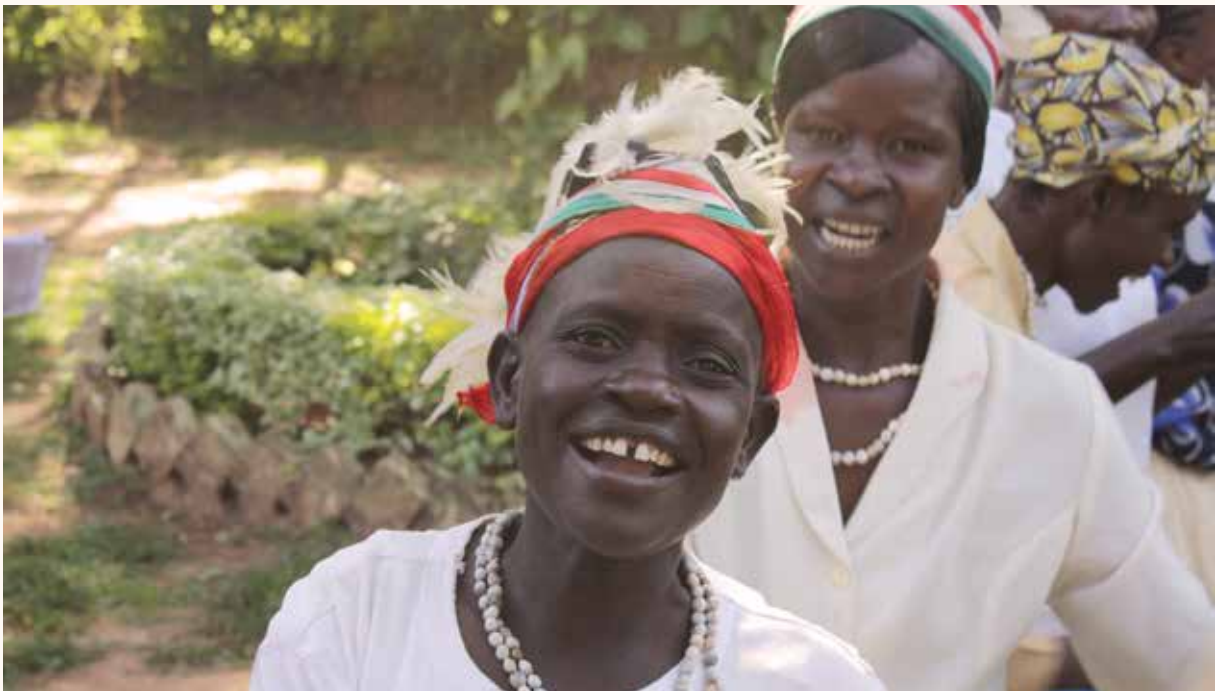
Home-based workers from the OYES Cluster in Kenya, 2015