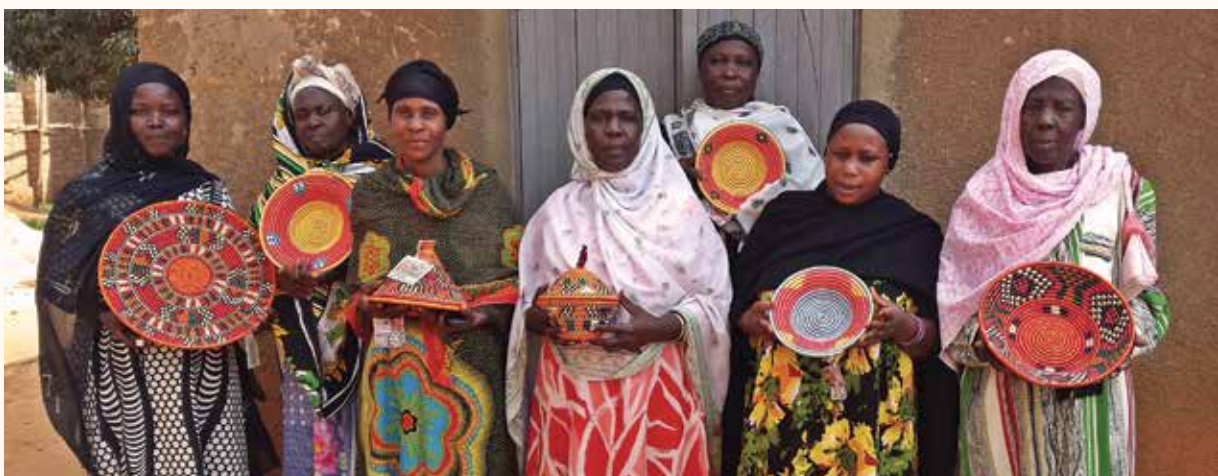
Nubian Crafts group members show off some of their intricately-woven products.

According to Hadijah Ahmed, despite inter-marriage and other influences, the Nubians do maintain many of their cultural customs. The weaving of colourful containers for household use is a centuries-old Nubian art form.