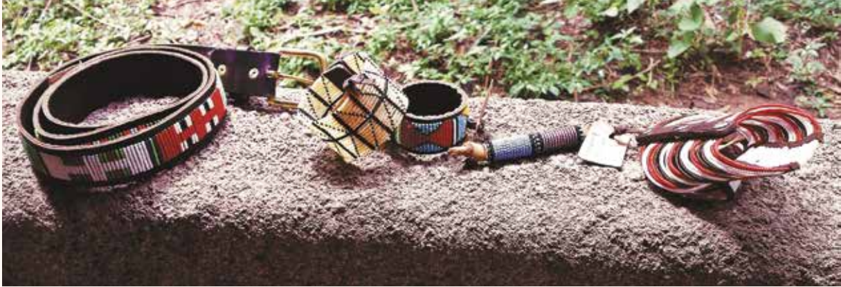
A range of Basecamp Maasai Brand products.