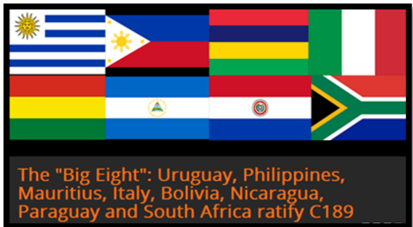
The "Big Eight": Uruguay, Philippines, Mauritius, Italy, Bolivia, Nicaragua, Paraguay and South Africa ratify C189