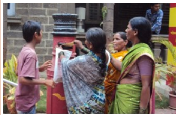
Above and below: Waste pickers rally and submit petition letters