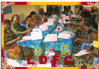
Above and below: LD FC