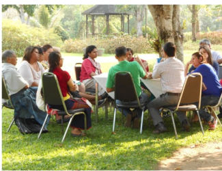
Above and below: Photos from Inclusive Cities Workshop