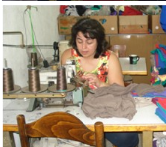
Participants in the HNSA /SEWA Visit