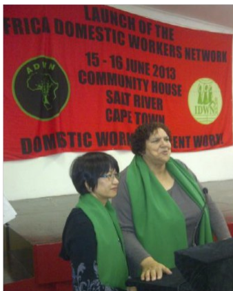
Above and below: Declaration and launch of AfDWN