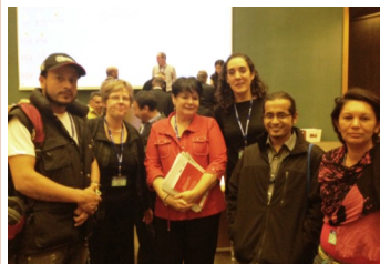
Waste Pickers Delegation with Sharon Burrow, ITUC General Secretary