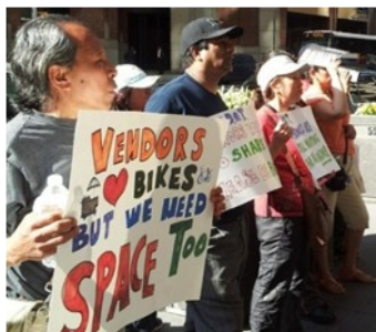
Manhattan street vendors protest