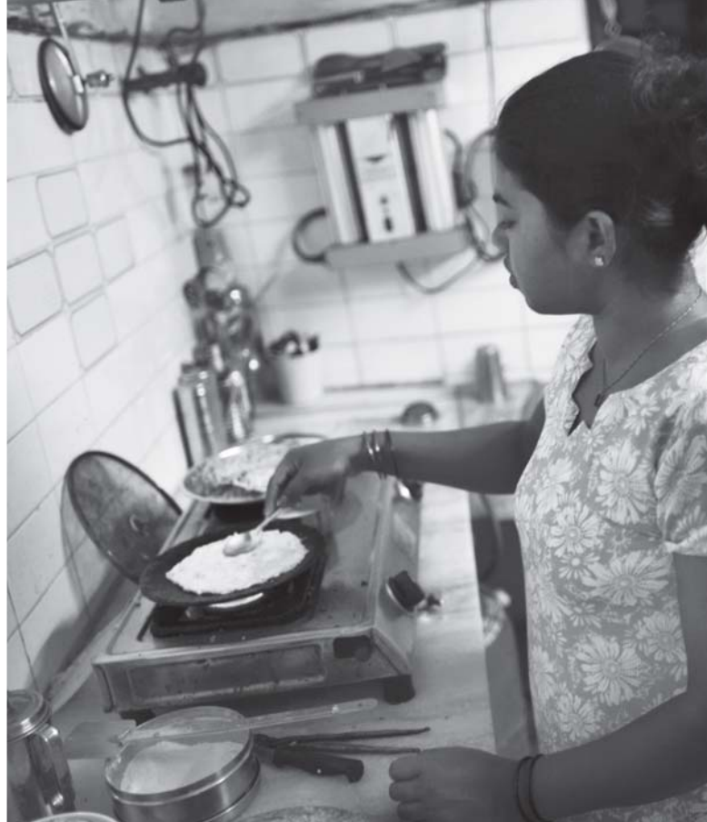
Asia: According to the Asian Domestic Workers' Network, employment in private households accounts for about one-third of all women's employment in Asia.