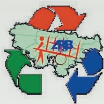
Asociación de Recicladores de Bogotá