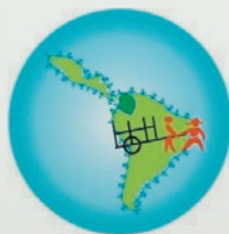
Red Latino Americana