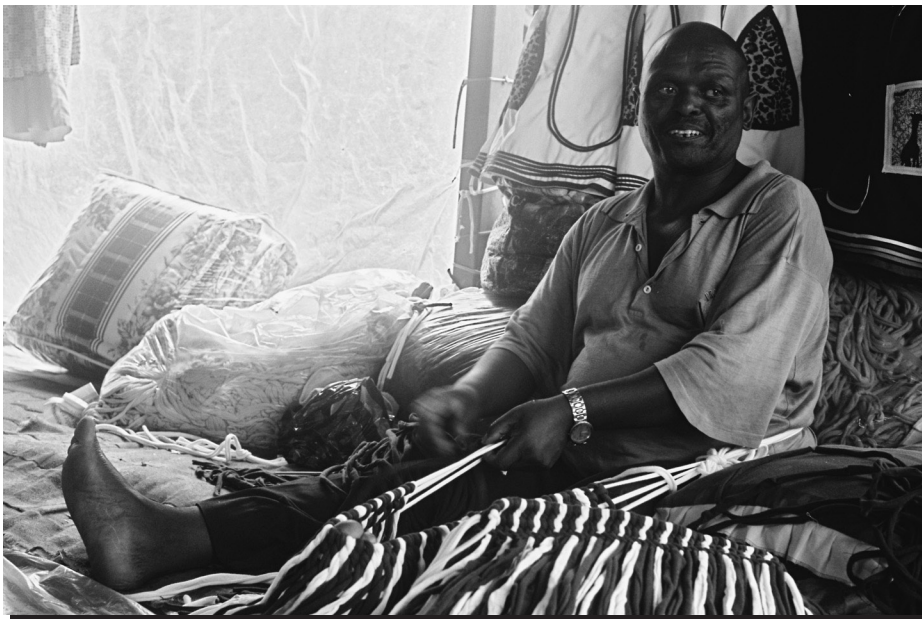
Street vendor preparing his goods in Durban, South Africa.

waste recycler felt that he and other waste pickers were victims of a global “game”, and that entrepreneurs were “playing” with the price of waste materials. The feeling that they were being subjected to forces beyond their control translated into a sense of powerlessness among some workers. A waste picker in Bogota revealed, “My feeling is frustration... Much more effort is required every day to get a result that is much lower than what it was previously. Very little can be done.” 62