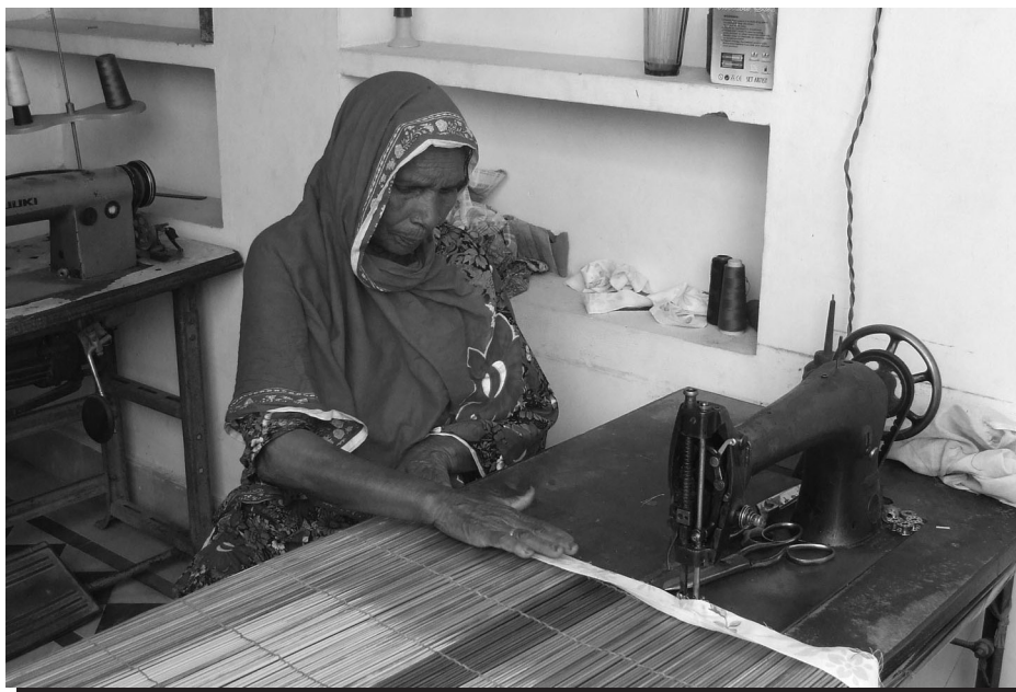
Home-based worker making reed mats in Kasur, Pakistan.

The current global economic crisis has hit the global workforce very hard and few economic actors have been insulated from the shocks. Initially, media and policy attention was confined to analysis of the global financial sector and the macroeconomic situation. Attention has now turned to the impact of the crisis on the real economy in both the developed and developing worlds, and many are concerned that the crisis could gravely afflict emerging markets and developing countries, effectively destroying the economic progress of recent years. The developing world is home to a major proportion of the global poor, for whom the consequences of the crisis could be especially severe, given their slim margins for survival in the best of times. 1 And yet, as the crisis transformed into a recession, and the recession spread across borders, the informal economy has remained largely absent from public and media attention. This is a particularly glaring omission given that a majority of the world's poor and vulnerable workers rely on the informal economy as a source of employment and income.