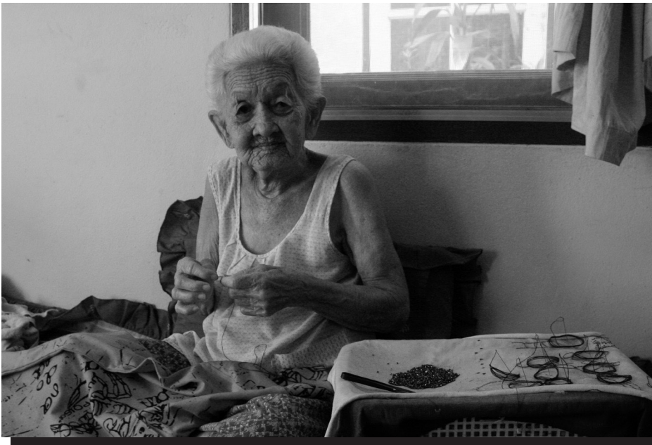
Sub-contracted home-based worker beading in Bangkok, Thailand.

of orders, and/or wages, depending on their employment arrangement with their workforce. In Table 3, more than half (55%) of the industrial outworkers – sub-contracted home-based workers – reported that their work orders had been cut and that the volume of their production had fallen significantly in the preceding six months. Work orders were fewer, and smaller, and in some cases, workers were not being paid on time for their work. One respondent in Thailand reported that her employer had not paid her at all in the previous six-month period. Another reported, "I used to get orders for slippers from Phuket and Sa Mui, about 600-800 pairs. Now I have no orders so I have to produce and sell by myself." 9