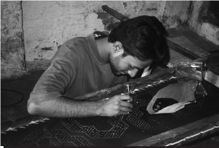
Own-account home-based worker doing needlework in Ahmedabad, India.

workers. Laws that recognise organisations vary considerably from country to country. The first step is the need to recognise the existence and importance of member-based organisations of informal workers by all levels of government but also by international bodies like the International Labour Organisation.