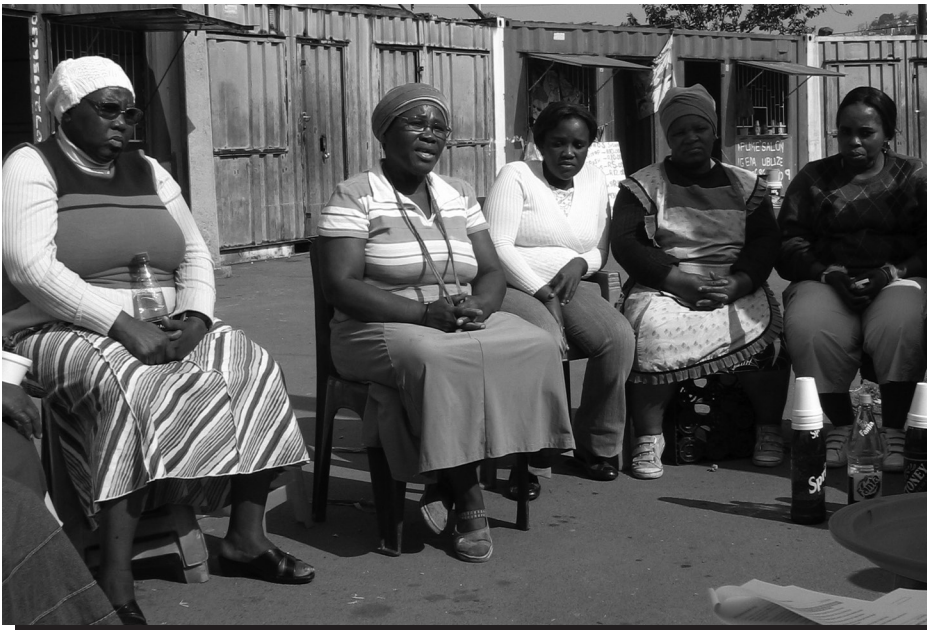
Street vendors voice their demands in Durban, South Africa.

Informal workers feel that there are a number of specific actions that governments can take to help alleviate their hardship during the crisis. Emergency measures such as soup kitchens or community kitchens will provide meals and food staples at subsidised rates to informal workers and their families, who are struggling to feed themselves. Likewise, workers demand that governments take action to ensure that children are not dismissed from school if their parents are struggling to pay fees during the crisis. Informal workers also propose that shelters are provided for those facing eviction, as well as new migrants internally displaced by economic crises.