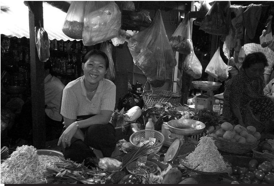
Street vendor selling food at a stall in Thailand.

Finally, special thanks are due to the 164 informal workers who participated in this study. The project partners and coordinator are deeply grateful to them for their time, their contributions, and their candour.