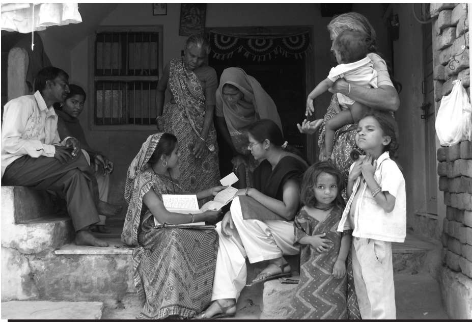
Consultation with a family of informal workers in India.

Much like formal counterparts, informal workers and enterprises are experiencing decreasing demand for goods and services, rising cost of inputs, and increasing pricing volatility for goods sold. In contrast to formal workers, informal workers are experiencing increasing competition and swelling ranks of their trades. Contrary to conventional wisdom, expanding employment in the informal economy does not mean informal workers are thriving during the recession. Unlike some of their formal counterparts, informal firms and informal wage workers have no ‘cushion’ to fall back on and have little option but to keep operating or working through these economically challenging times.