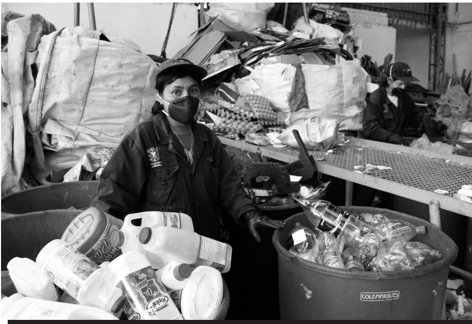
Waste picker sorting material at the Alqueria Recycling Centre in Bogotá, Colombia.

However, a higher number of informal workers does not mean they are thriving. On the contrary, respondents were clear that they faced greater absolute numbers of competitors for fewer customers over the same period, and this had decreased their revenue substantially. Of the street vendors, 80 per cent reported that they had experienced increased direct competition from new vendors selling similar goods. Over two-thirds (655) of home-based workers, who are most likely to work in isolation, reported increased direct competition. One home-based worker reported that she used to sell her products at 199 Baht (USD 6) but her new competitors were willing to sell as low as 59 Baht (USD 1.7) and she now faces a 50 per cent decrease in her income. Some of these new competitors were migrant workers who were willing to sell at the lowest prices.