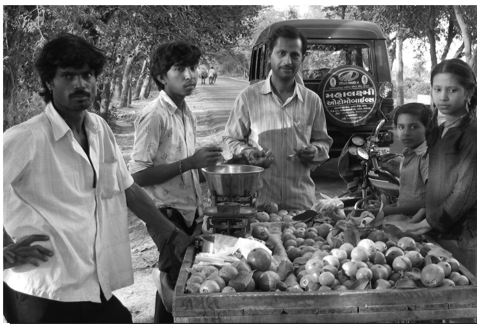
Street vendors selling their produce in Ahmedabad, India.

Individual waste pickers are the most vulnerable as they do not have any supportive organisation or network to turn to. In Pune, waste pickers participating in this study are involved in highly organised waste-recycling schemes and some sell waste through their own co-operative. 48 The drop in prices of various recyclable goods reported by these respondents ranged from five to seven per cent. In Latin America, where a lower percentage of the sample was involved in these kinds of recycling schemes, the drop in prices of various recyclable goods over the same period ranged from 42 to 50 per cent. Whether this contrast is due to the level of organisation remains an empirical question that needs further investigation.