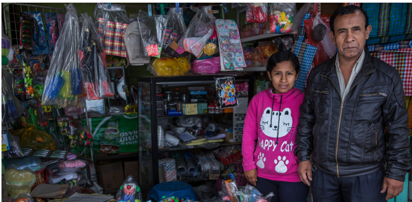
A vendor and his daughter pose for a photograph in a market in Lima, Peru.