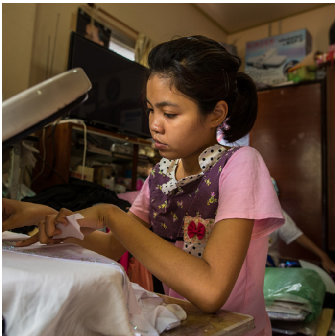
This young girl is helping with her mother with work in Bangkok, Thailand. As is common for many families employed in informal work, her mother is her sole caretaker.