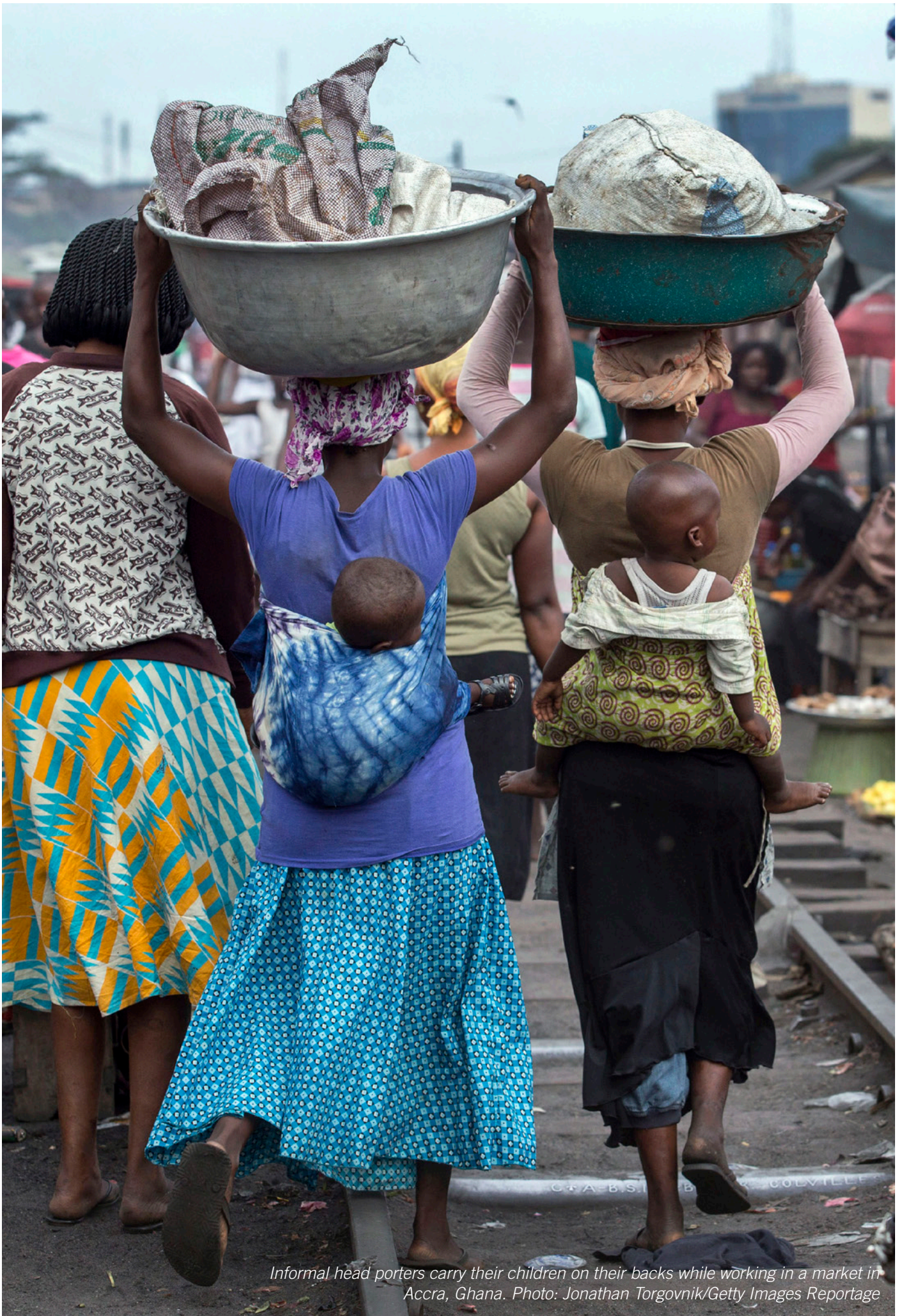
Informal head porters carry their children on their backs while working in a market in Accra, Ghana.