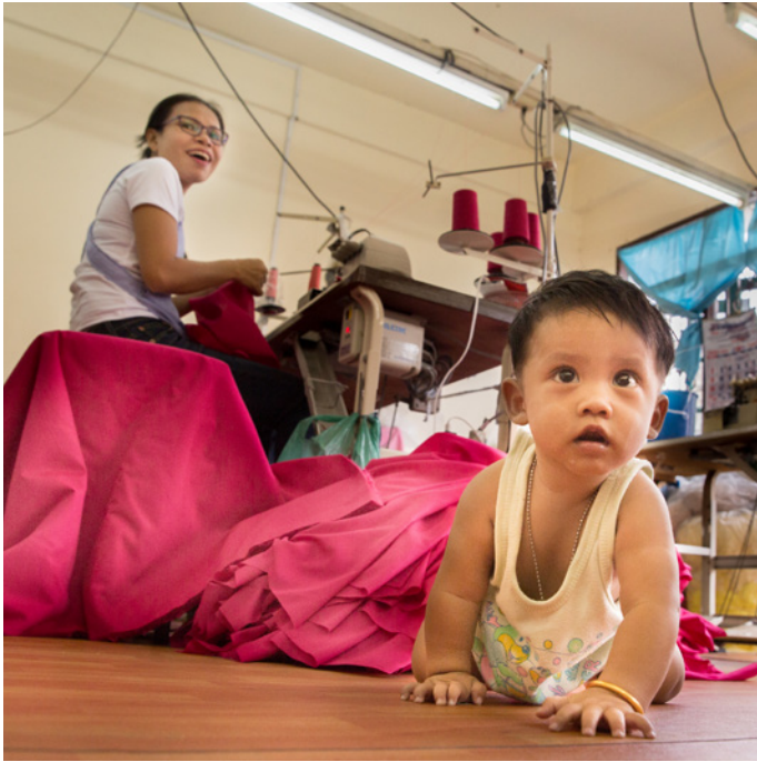
A 6-month-old child plays on the floor of the garment factory where her mother works in Bangkok, Thailand.

A sentiment that arose out of several of the focus groups was that the responsibility for child care should be seen as part of a public, collective responsibility because women simply did not have time to both provide income and adequate care for their children. In Brazil, the research participants suggested that it was the responsibility of the state to support working women with more comprehensive social policies with respect to the care of children. They argued for more child care centres running for extended hours during the day, but also for the provision of additional health and education programmes to compensate for the time that mothers are unable to spend with their children [Brazil FG1]. Indian women who sent their children to the SEWA child care centres echoed these sentiments, feeling that they had neither the time nor the energy to impart good values and behaviour and basic education to their children; they really appreciated that the centres were able to do this for them [India FG Report].