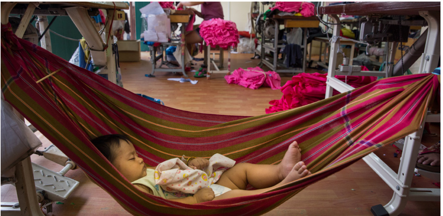
The 6-month-old child of a garment worker naps while her mother sews at a garment factory in Bangkok, Thailand.