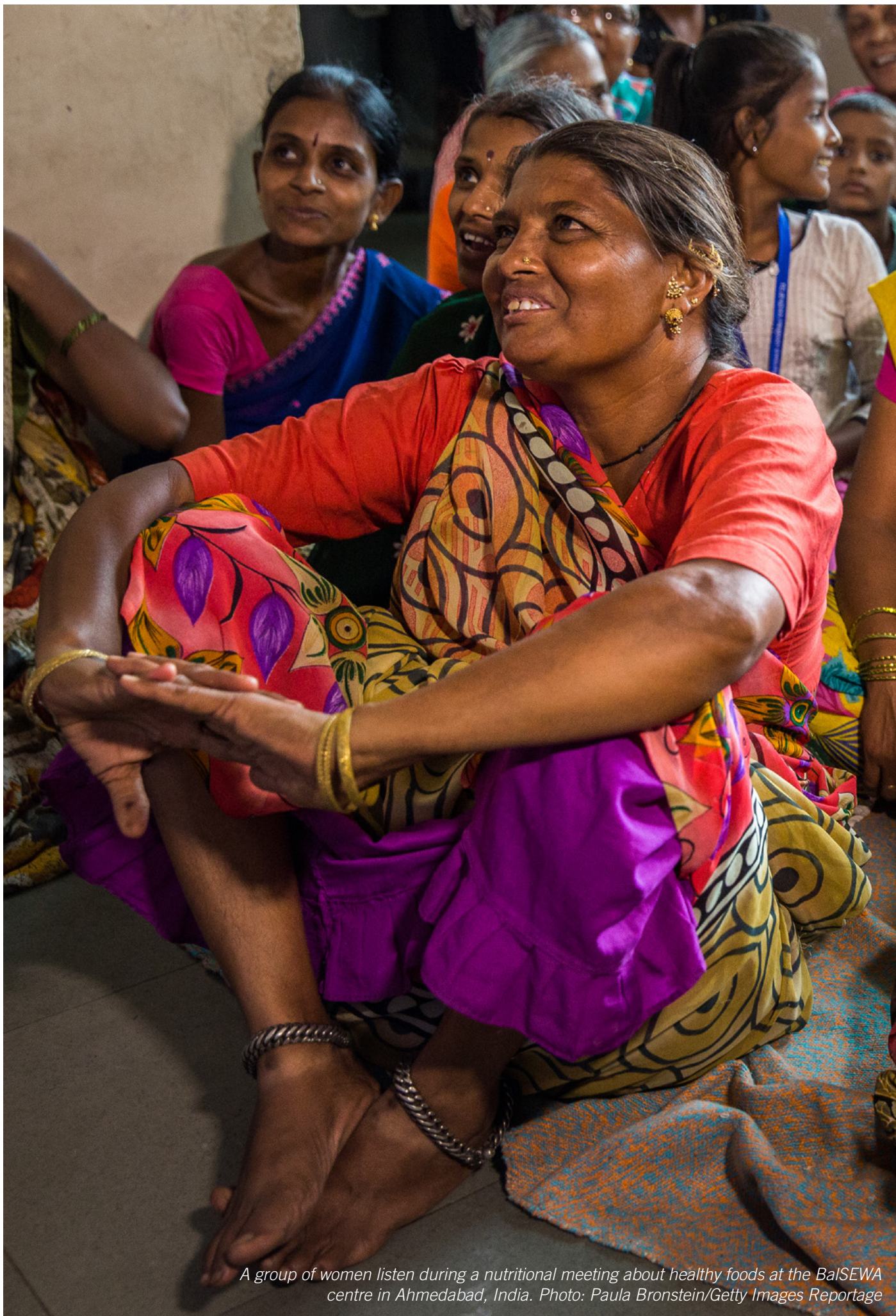
A group of women listen during a nutritional meeting about healthy foods at the BalSEWA centre in Ahmedabad, India.

“Our children do not get the attention they deserve”