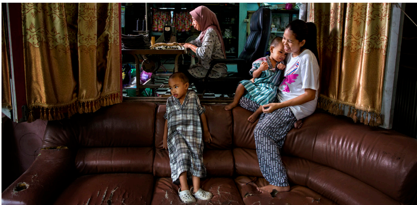
A home-based worker sews garments while her grandchildren play in their home in Bangkok, Thailand.