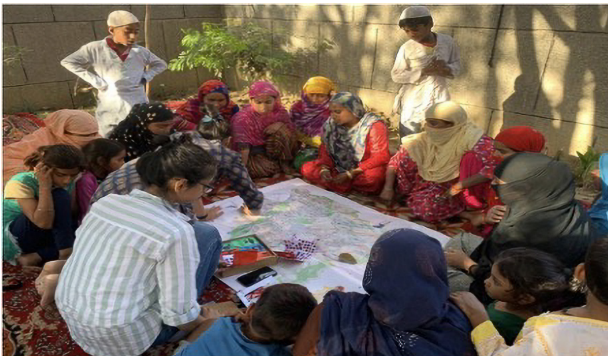
Training conducted with women waste-pickers using the participatory toolkit Kaun Hai Master? Kya Hai Plan?

expected that the final plan will be issued in 2022. MBD is committed to monitoring any further developments, ensuring the timely implementation of enabling provisions, and resisting or challenging provisions that are detrimental to the groups it represents. Pushing for the formulation of zonal and local area plans is also a significant area of intervention for the campaign as decentralization to more local scales would enable more substantive citizen participation.