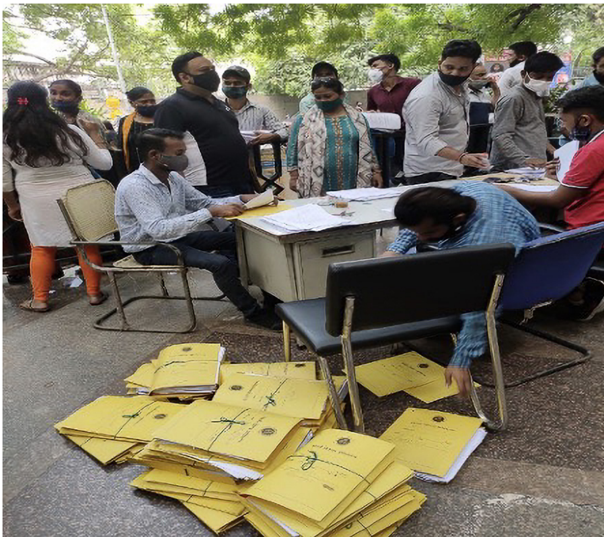
MBD campaign members outside the DDA headquarters, filing suggestions and objections to the draft Master Plan for Delhi-2041 in person (19 August 2021).

into granting a 30-day extension to the public comment period.