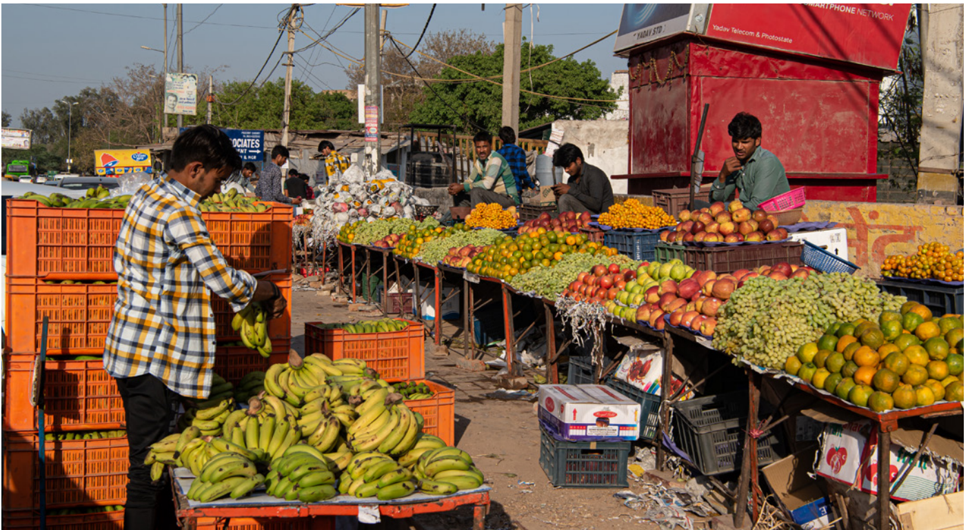
A weekly market in South Delhi.