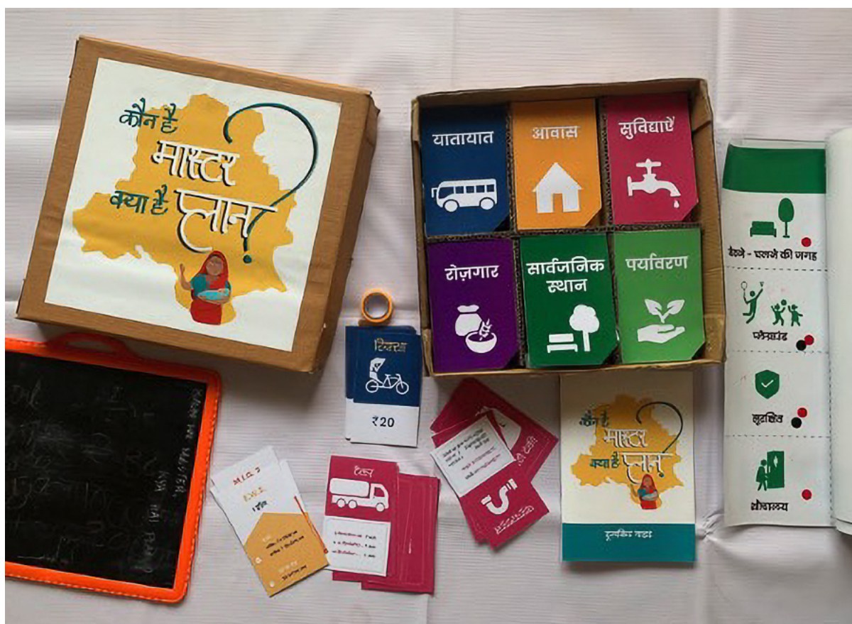
Contents of the participatory toolkit Kaun Hai Master? Kya Hai Plan? (Who is the Master? What is the Plan?). The different components relate to various aspects of planning such as livelihood, transport, housing and services.

members' lives (transport, work, social infrastructure, etc.) and help them to articulate their objections.