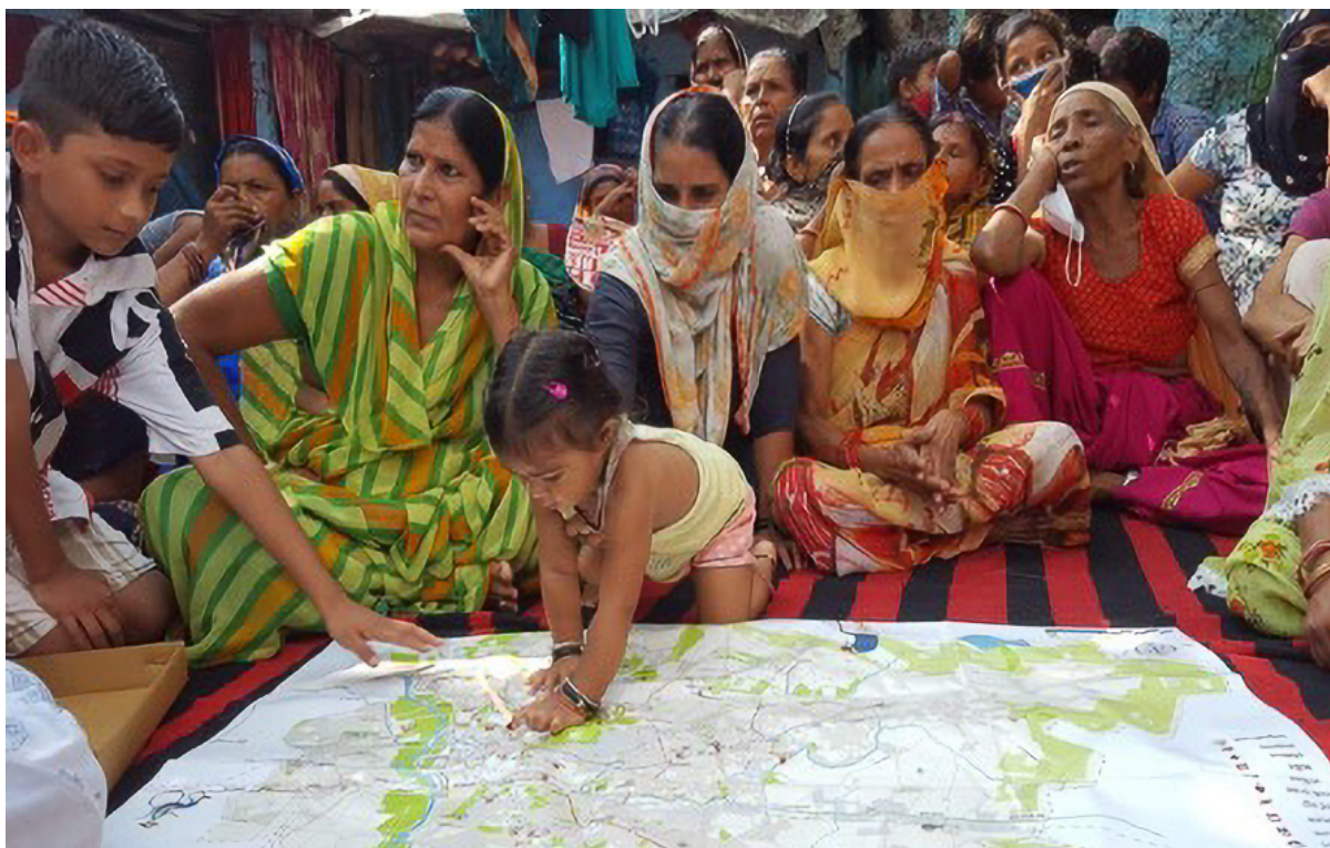
Community members situating themselves on a map of Delhi.

public meetings in informal settlements and workplaces across Delhi to source new insights on the problems, priorities and demands of its communities.