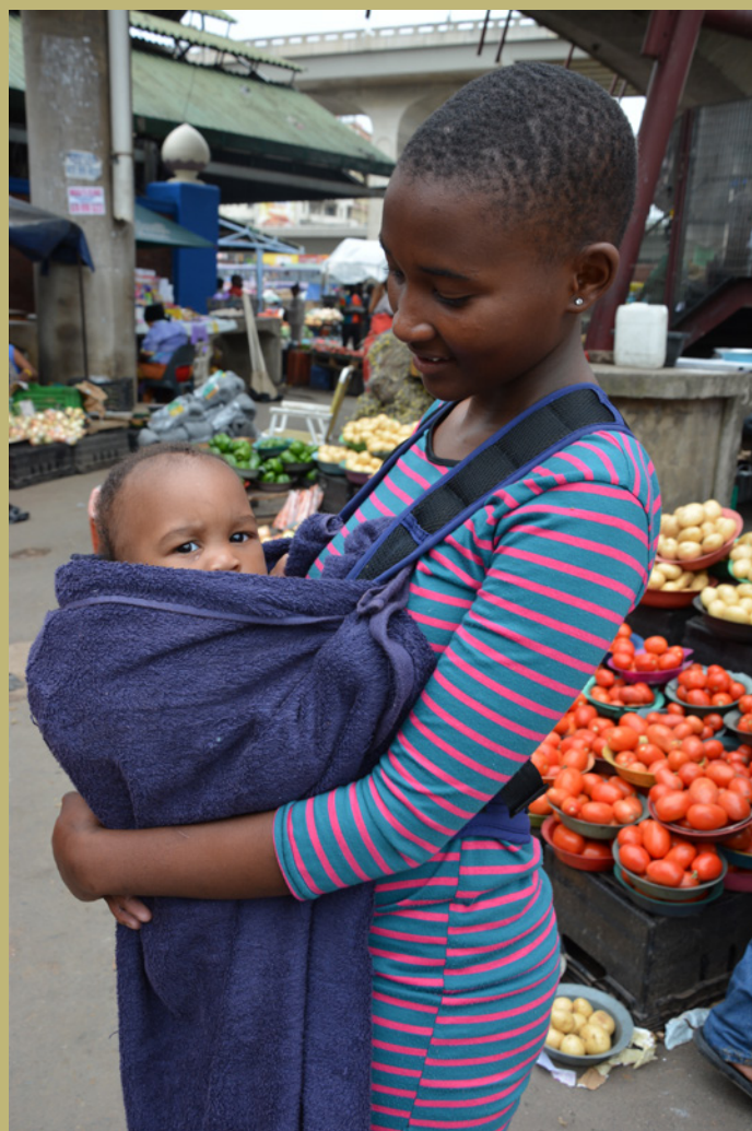
WIEGO undertook exploratory research in Accra, Ghana and Durban, South Africa on child care and women's economic empowerment.