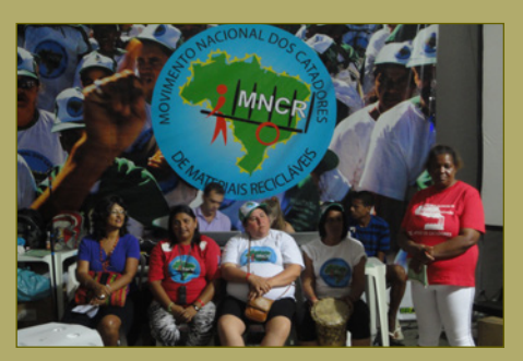
Rio+20, June 2012.