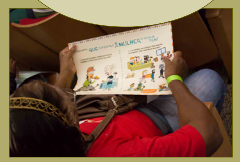
Photos from the General Meeting with waste pickers from Brazil and Latin America for discussion on the Gender & Waste Project, April 2015.

"We aren't making any money with this workshop but we're gaining knowledge. That's why participating is important".