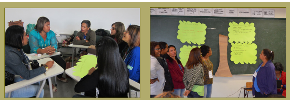
Workshops in the metropolitan region of Belo Horizonte (L), May 2013, and Itaúna (R), October 2013.

This activity was important for building upon the ideas that circulated in the previous activity. First, this activity was useful for making sure that everyone's voice was heard and opinion expressed. Second, taking time out to discuss autonomy in a more in-depth manner allowed room for challenging more socially ingrained views on gender relations. In some workshops, there was tension due to different perspectives on autonomy over one's body and sexuality, but even these moments had value as they allowed for a more broadened discussion on autonomy and women's roles in overcoming traditional viewpoints and beliefs that even women reproduce. Overall, interaction among the groups during the presentations was significant, and fulfilled the objective of creating an environment based on respect and solidarity.