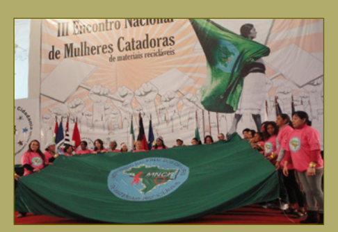
III National Meeting of Women Waste Pickers.