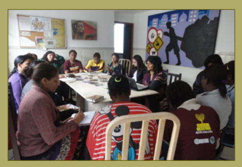
Meeting with Women Waste Pickers in Belo Horizonte, May 2012.

The involvement of women waste pickers was an important step in promoting a more critical reflection on gender dynamics among the waste pickers. In 2013, NEPEM's staff and the project team conducted four exploratory workshops