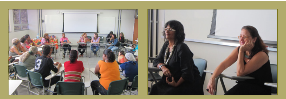
Workshop in the metropolitan region of Belo Horizonte, May 2013.

These questions brought up a variety of different answers that would later set up the discussions in the next activity. In this activity, the facilitators filled a crucial role by encouraging the participants to speak and by establishing links between some of the women's remarks and general ideas about gender relations and women's autonomy. The facilitators should also pay attention to those who still have not participated and to avoid repetitive answers. At the end of the activity, the facilitators should briefly summarize the general ideas and examples that were given throughout the activity.