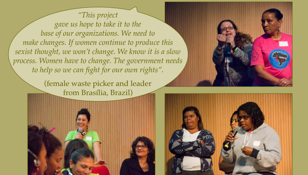
General Meeting with waste pickers from Brazil and Latin America to discuss the Gender & Waste Project, April 2015.