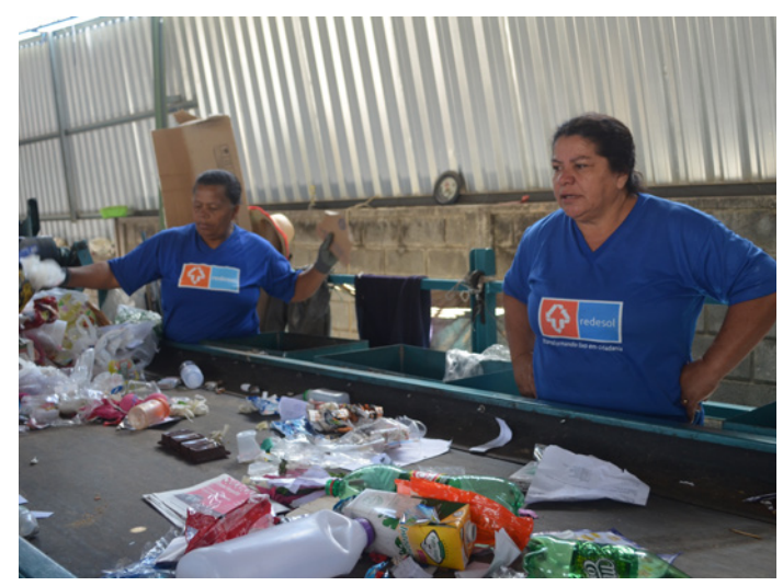
Waste pickers from Comarp explain how they have adapted to working with a sorting belt and what improvements they have observed in the cooperative.