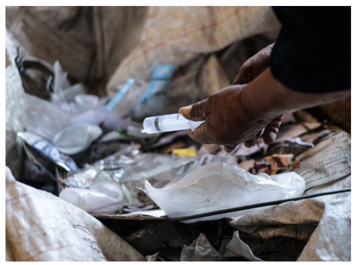
Syringe from hospital or household waste is found during the sorting process.

The findings reveal three general coping strategies across the cooperatives: self-medicalization to minimize impacts, problem solving measures and acceptance of the problem.