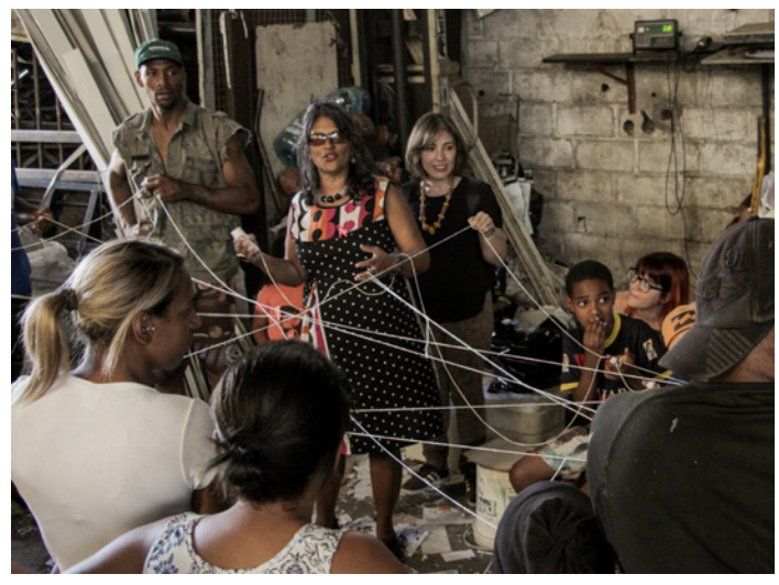
Group Conversation at Associrecicle.