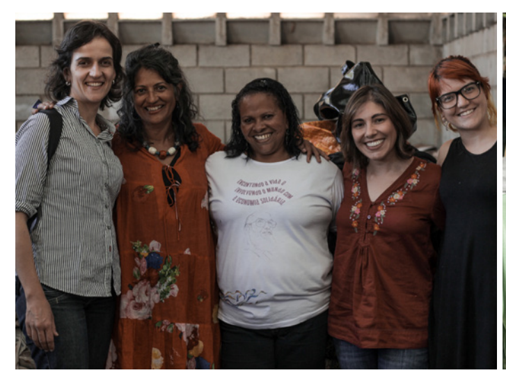
The Cuidar Project staff visit cooperatives belonging to Redesol.