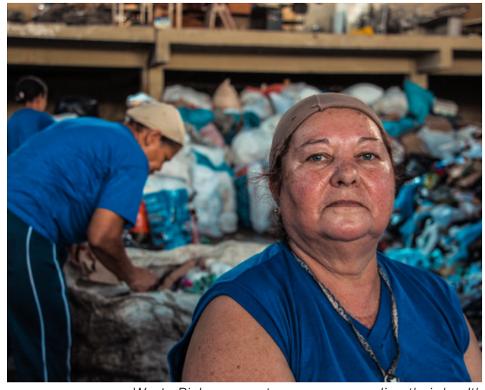
Waste Pickers report concerns regarding their health during the Cuidar Project.