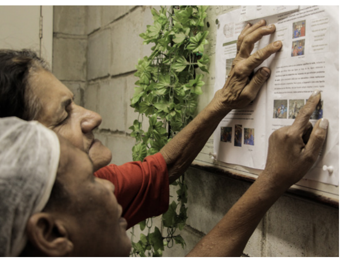
Participatory research requires constant communication between researchers and waste pickers.

this effort can draw attention to how the quality of and access to public health services can lead to a loss in earnings for those with the weakest link in the recycling value chain. Attentive and patient appointments are also important. The correct destination of hospital and household waste from recyclables is also a key issue for waste pickers' health and well-being. Municipal governments need to guide local health centers, both public and private, and the community on the risks created by the inadequate segregation and destination of waste from these centers.