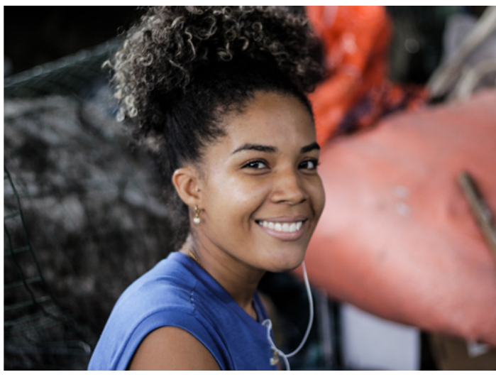
Young waste picker likes to share information about health issues with work colleagues to prevent diseases such as diabetes.