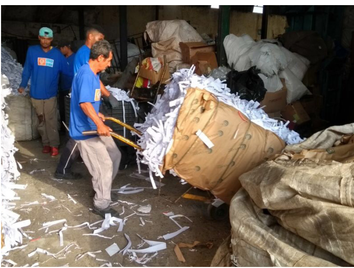
Waste pickers at Associrecicle describe how they sort specific materials and which ones lead to more thirst and fatigue at the end of the day.