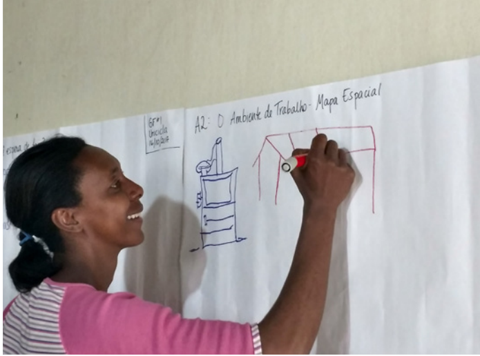
Focus Group and co-production of knowledge at Unicicla.

The exploratory health risk mapping involved technical visits to the cooperatives, group conversations (GC), participatory focus groups (FG), surveys, and interviews with leaders from September 2017 through December 2017. The findings cannot be generalizable for all of Redesol or other cooperatives in Minas Gerais, Brazil, but they provide important insights into what collective habits, processes and policies can improve working conditions and minimize certain health risks for waste pickers.