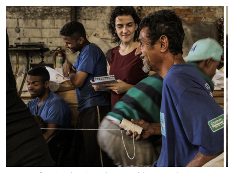
Popular education tools and participatory methods created a favourable dynamic for engagement during fieldwork.