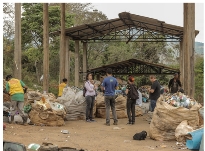
Without adequate sorting infrastructure, materials are scattered and their recycling quality is compromised.

Of the 48 waste pickers interviewed in the survey, 75% stated they use gloves frequently and 85.4% claimed they used boots frequently. The sporadic use of protective gear can be attributed to the diversity of materials waste pickers handle. Several waste pickers also mentioned that a lack of resources has limited the leaders' and/or cooperatives' capacities to purchase new protective gear.