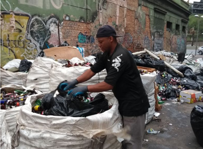
Waste picker uses gloves and boots while sorting through bags with glass.