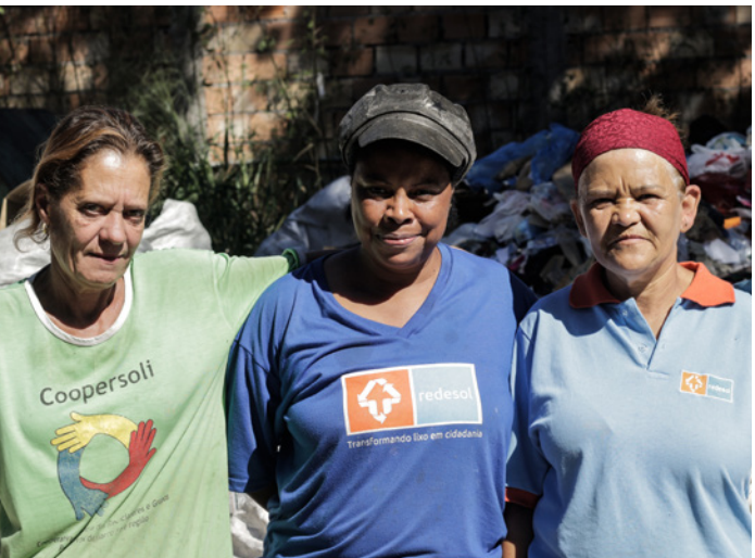
For waste pickers at Coopersoli, discussing health concerns can lead to changes in waste pickers' daily habits.