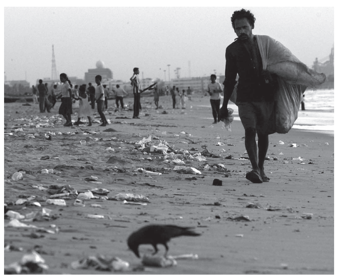
A rag picker collecting recycleable material at Marina Beach in Chennai, India

Municipalities in India are not required to collect waste from households. They are only obliged to provide public receptacles for garbage and to transport and dispose of this waste. 400 members of KKPKP are paid a monthly rate by 40,000 households and companies to collect source segregated garbage from them. The Pune Municipal Corporation now promotes the programme. The scheme has helped to dramatically increase the earnings of the participating wastepickers. But it has also created new challenges for the wastepickers who had to develop new ways of working as they made the shift to being service providers. As new central government regulations now require certain types of municipalities to conduct door-to-door collection the KKPKP is advocating this type of initiative as an alternative to privatization models which grant contracts to private companies and deny the wastepickers access to recyclable materials (Chikarmane and Narayan 2005<sup>135</sup>).