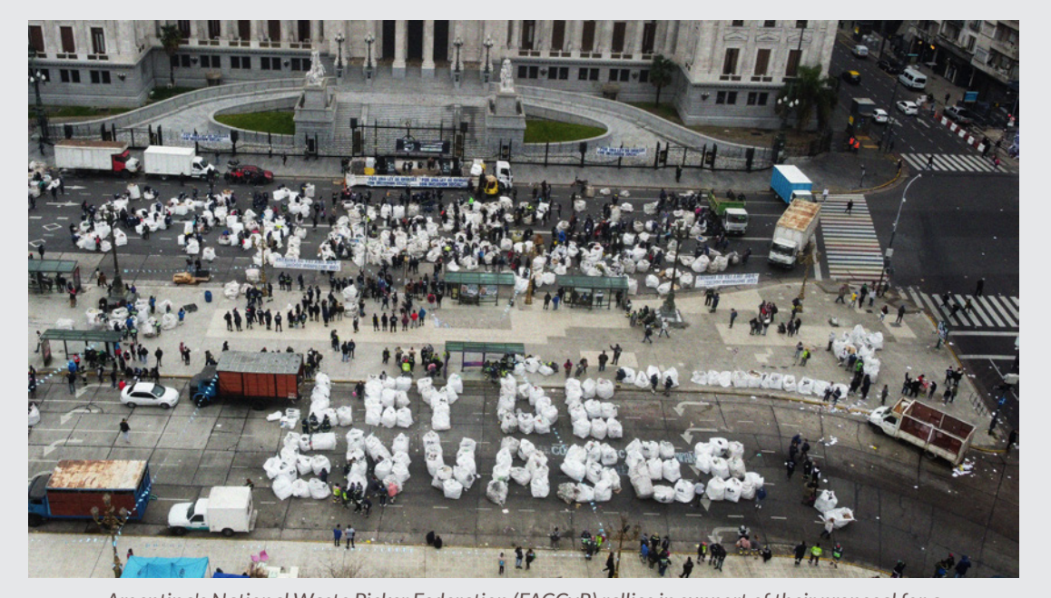
Argentina's National Waste Picker Federation (FACCyR) rallies in support of their proposal for a packaging law ("Ley de Envases") with social inclusion, 2021.

fees and pricing targets, grievance mechanisms, review processes, etc. are essential. Collaborative engagement processes must be institutionalized to ensure that changing dynamics and political shifts do not undermine or erode practices or make way for token representation. with no power for collective bargaining. In some circumstances, as with Argentina's National Waste Picker Federation's (FACCyR) proposal for a socially inclusive packaging law, waste picker organizations themselves can develop EPR proposals and model legislation. These proposals should be taken seriously and studied for their potential to influence EPR to be more inclusive.