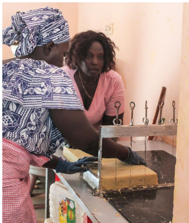
Home-based workers in Dakar.

(45 per cent of men, compared to 27 per cent of women). In Dakar, the next largest group is street vendors, where women are more heavily concentrated (about 21 per cent of employed women, compared to 9 per cent of employed men). Women are also more likely to be in home-based work (19 per cent of women compared to 5 per cent of men) and in domestic work (19 per cent for women and 3 per cent for men). In the other two geographic areas, market trade is also the predominant group for both women and men, with higher percentages for men than for women. In urban Senegal, 37 per cent of men's employment is in market trade compared to 26