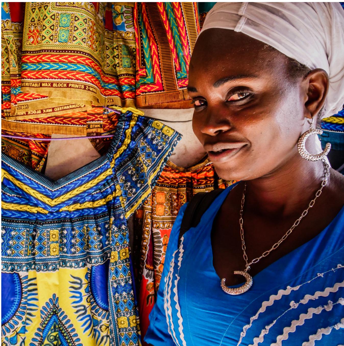
A street vendor in Dakar.

Women market traders in all three geographic regions have the highest per cent of secondary school attendance – 27 per cent in Dakar, 21 per cent in urban Senegal, and 17 per cent nationally. For all other groups, less than 15 per cent of women have attended secondary school at the national level, the per cent of women (as well as men) with no education increase, but substantial gender disparities persist. Among men, about a third of domestic and home-based workers in Dakar, and about 20 per cent nationally, have completed secondary schooling. Across all groups, the shares of women and men with completion of tertiary schooling is generally less than 5 per cent.