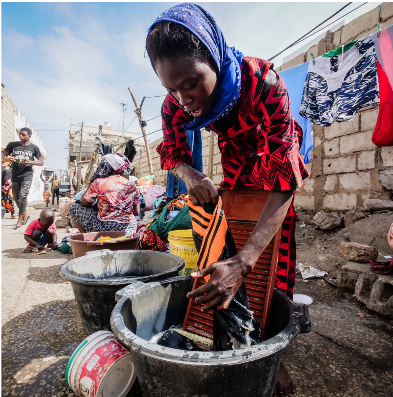
A laundress in Dakar.

(1) Employees are classified as informal if they did not receive employment benefits, specifically: medical, paid annual or sick leave, or contributions to social security. Self-employed are classified as informal if they are not registered or do not keep formal accounts. Contributing family workers are also included in informal employment.