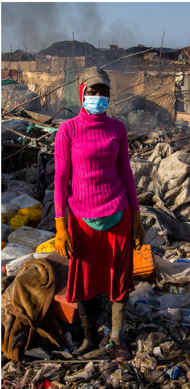
A waste picker working at the Mbeubeuss dumpsite.