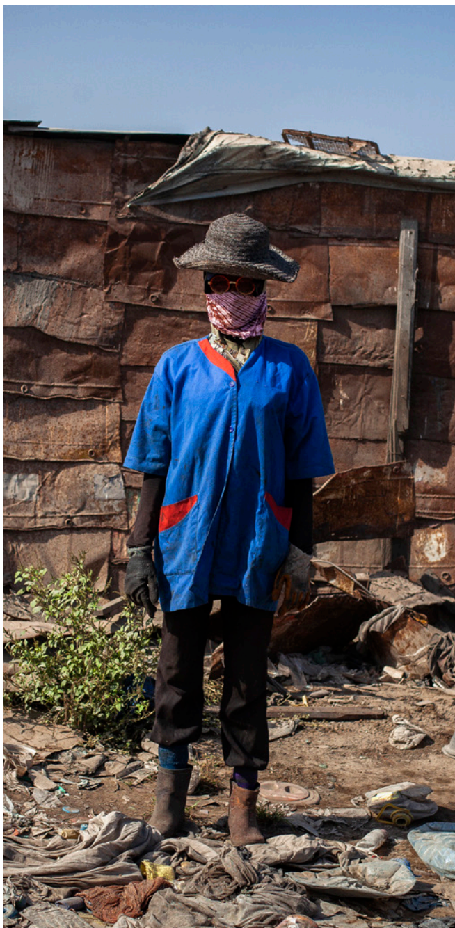
A waste picker working at the Mbeubeuss dumpsite.