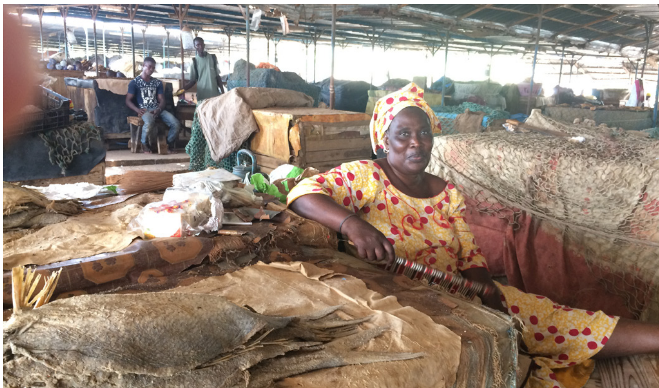
A market trader at the Marche de Diola Dakar.

Among women street vendors in all geographic areas, around 90 per cent are own-account